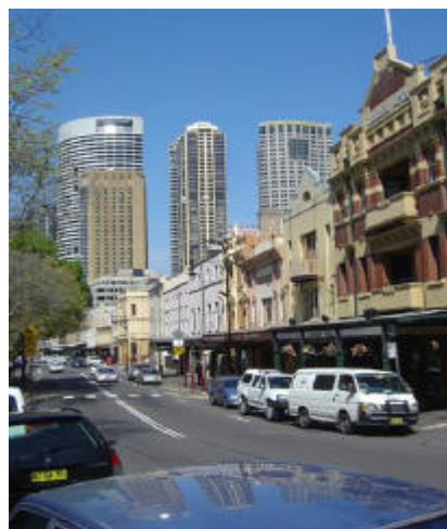
George Street, The Rocks