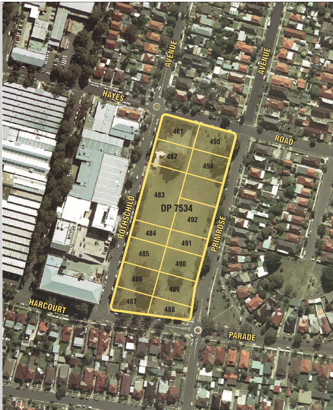
Figure 1 Location context