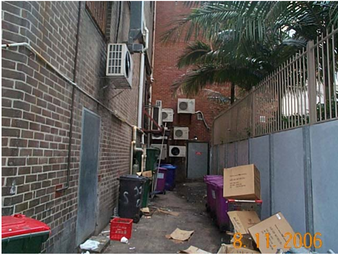
View of the passageway at rear of 31-33 Oxford Street Surry Hills.