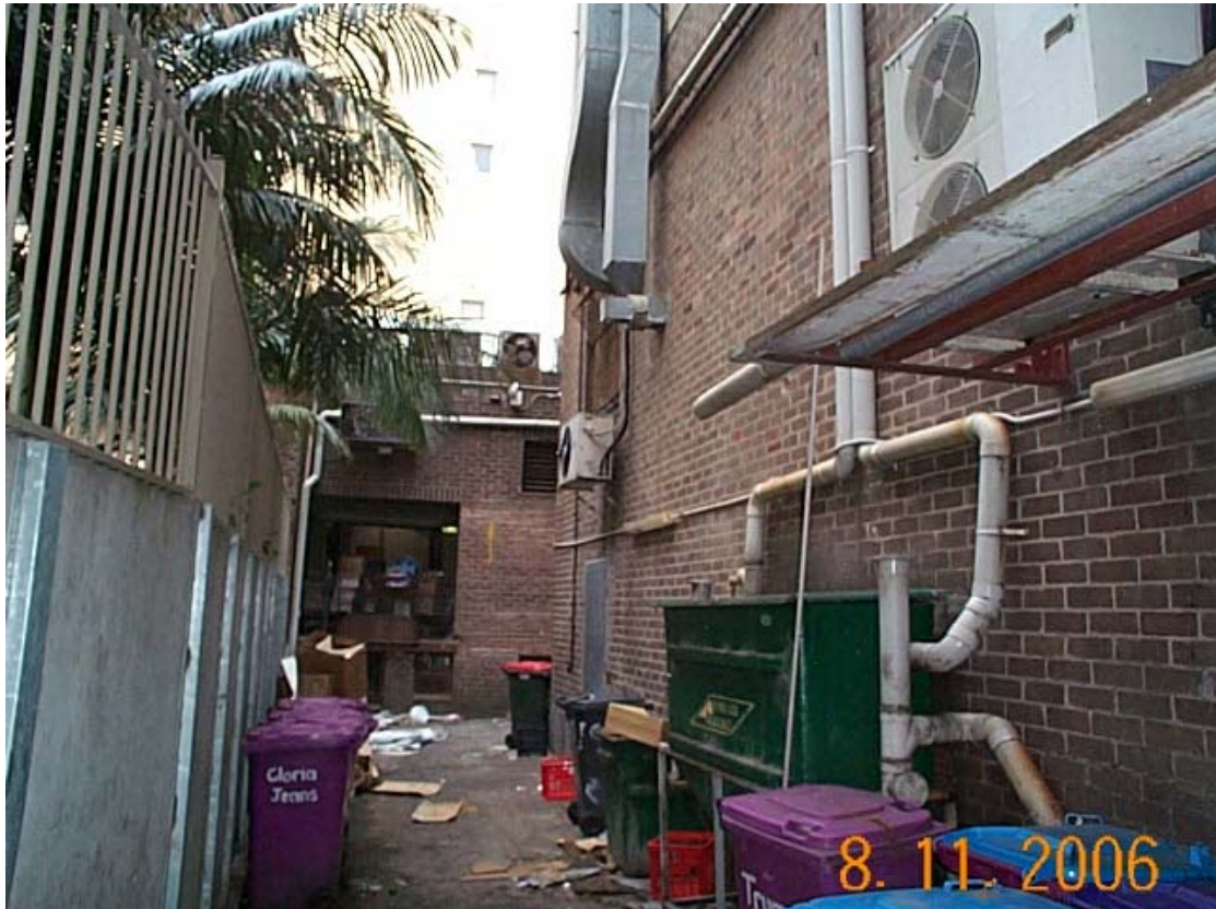
View of the passageway looking out towards the passageway between 29 and 33 Oxford Street Surry Hills.