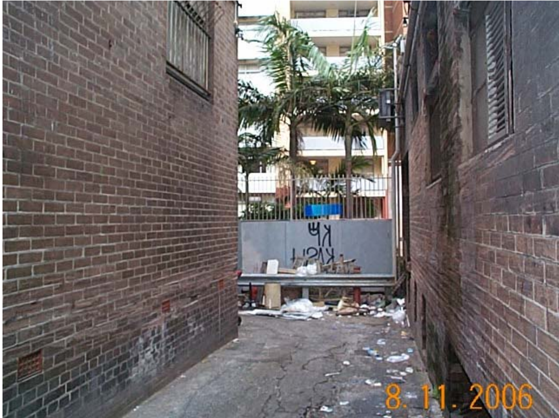
Passageway between 29 and 33 Oxford Street leads into passageway known as 31a and 33a Oxford Street (to the left) at the rear of 31-33 Oxford Street Surry Hills.