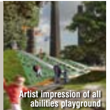
Artist impression of all abilities playground

The City's biggest park continues to take shape with the construction of an exciting all abilities playground, an upgrade of the village green and installation of a new toilet/shelter facility. Work is anticipated to be completed late 2008. Design work will soon commence on storm water harvesting for the park's wetlands. Come and hear about these new additions to the park.