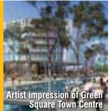
Artist impression of Green Square Town Centre

Design work for the Green Square Town Centre public park and plazas is well underway and will be exhibited soon. Your feedback will help finalise plans to create a sustainable new community in the City South. Council has also confirmed a 50 metre pool, sports centre, family and childcare services, library and cultural centre for the area.