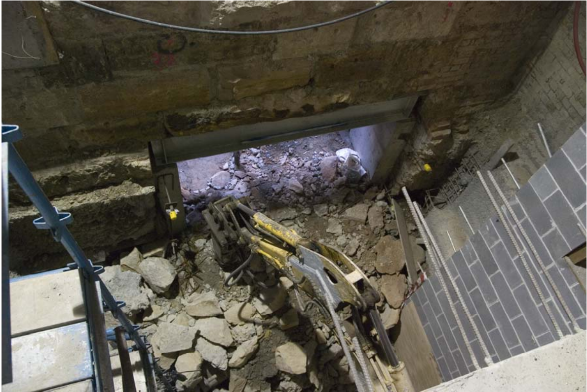
Installation of loading dock to basement tunnel