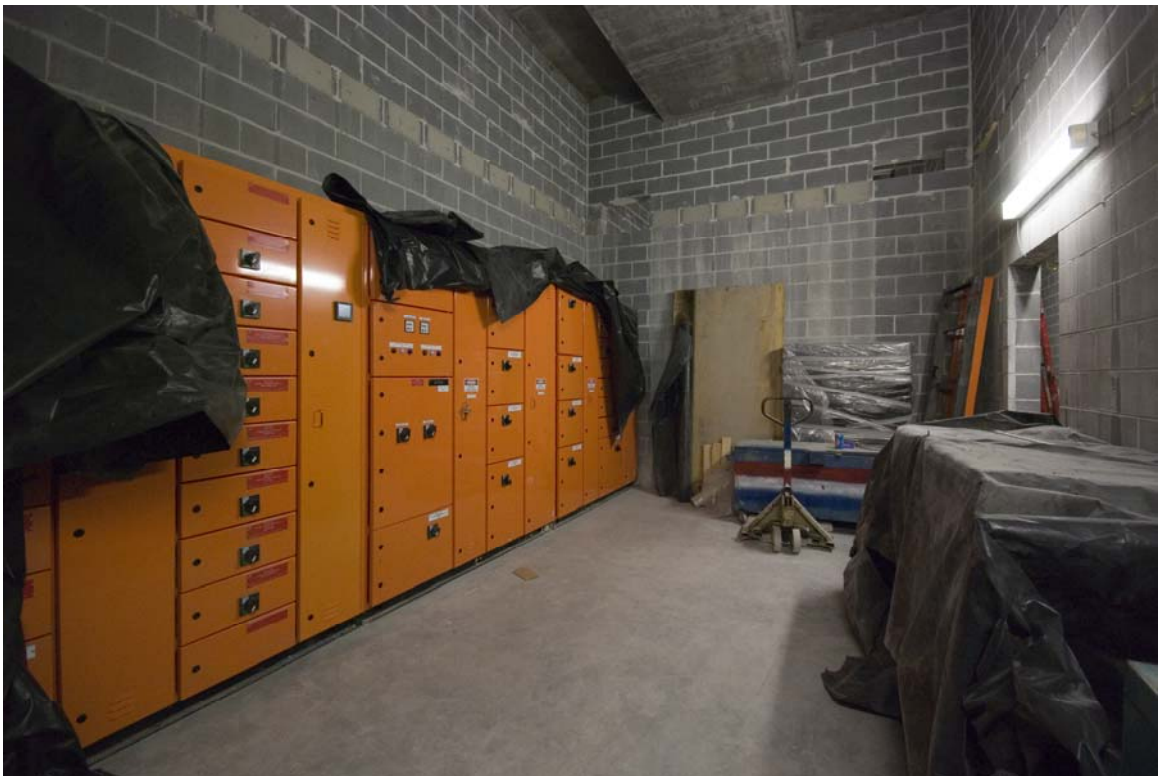
New electrical main switchboard installed in basement