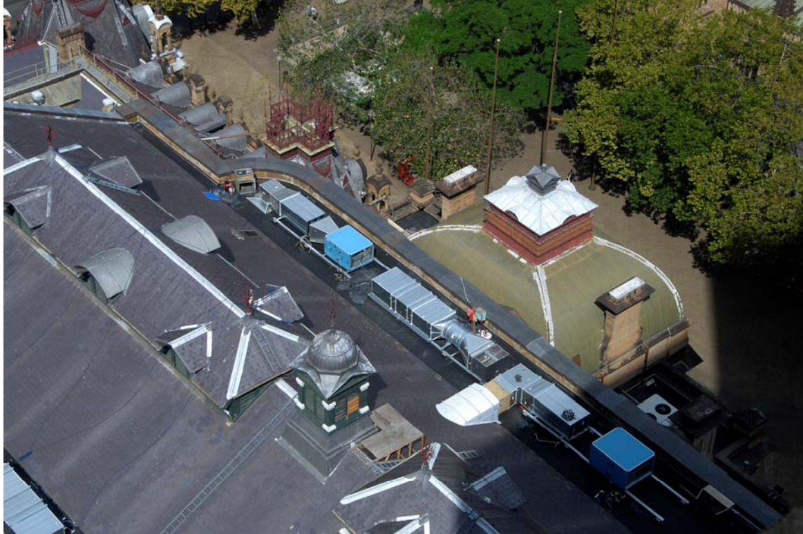
Installed Air Handling Unit for the new smoke systems