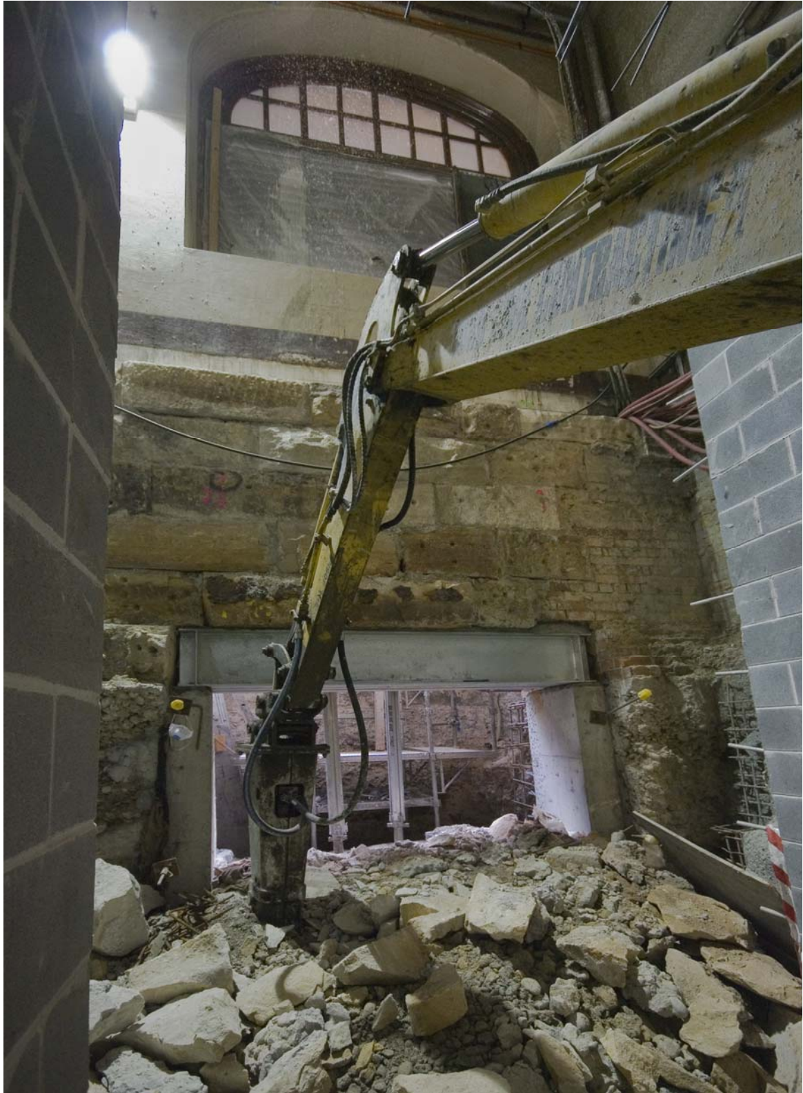
Break-through of southern tunnel