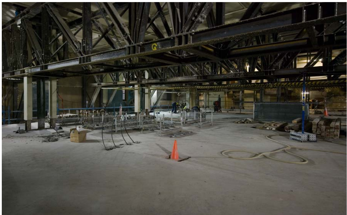
Post Tensioning of New Ground Floor Slab