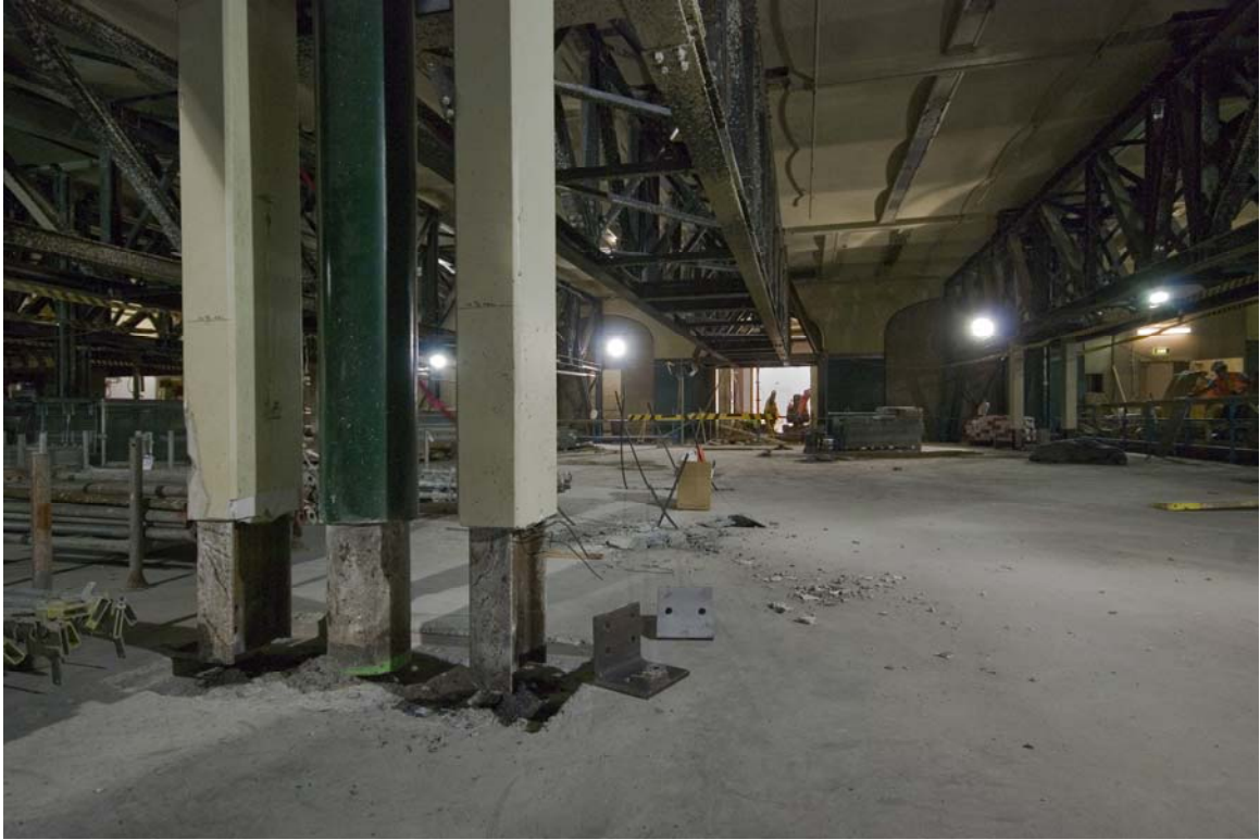
Ground Floor looking east – note part removal of temporary truss