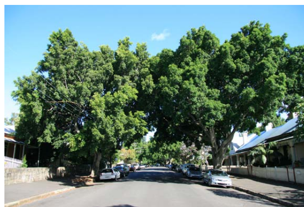
Figure 68- Westmoreland Street with mature Hills Weeping Figs. These are slowly being removed as they become over-mature. Opportunity will then exist in these streets to install in-road plantings.