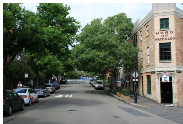
Figure 50- Historic Celtis australis on Lower Fort Street.