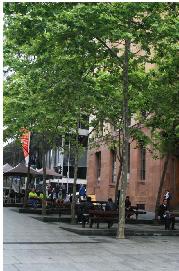
Figure 54- Plane trees in Martin Place.