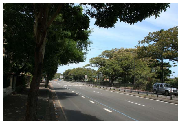
Figure 77- Borrowed landscape from Moore Park.