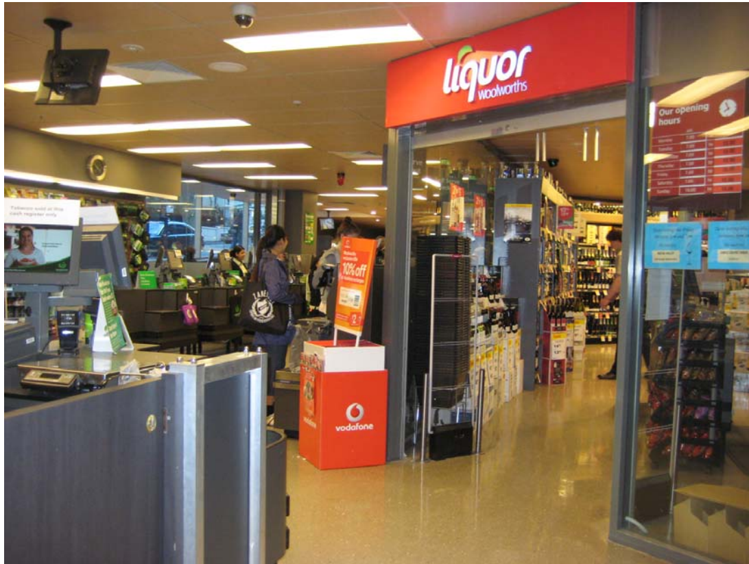
Figure 6: Internal view (towards Macleay Street) showing relationship between liquor store entry and supermarket checkouts