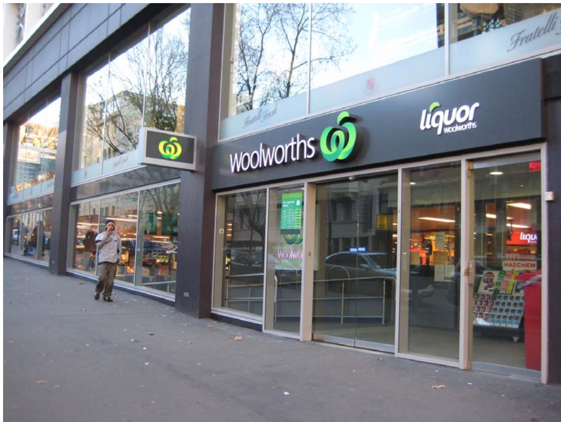
Figure 3: Macleay Street entrance – note liquor store location in background