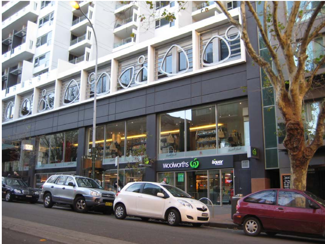
Figure 2: Site viewed from Macleay Street.