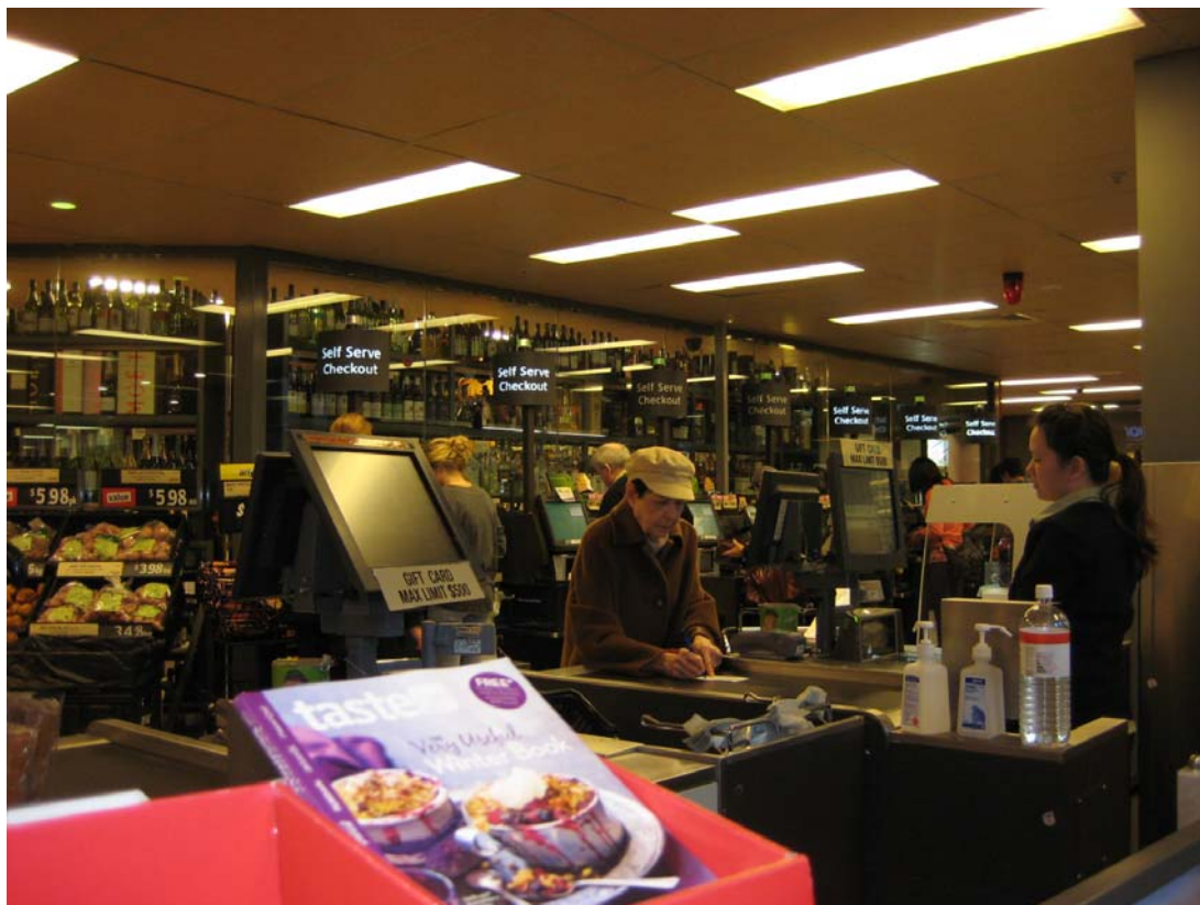
Figure 5: Internal view from supermarket checkout towards liquor store