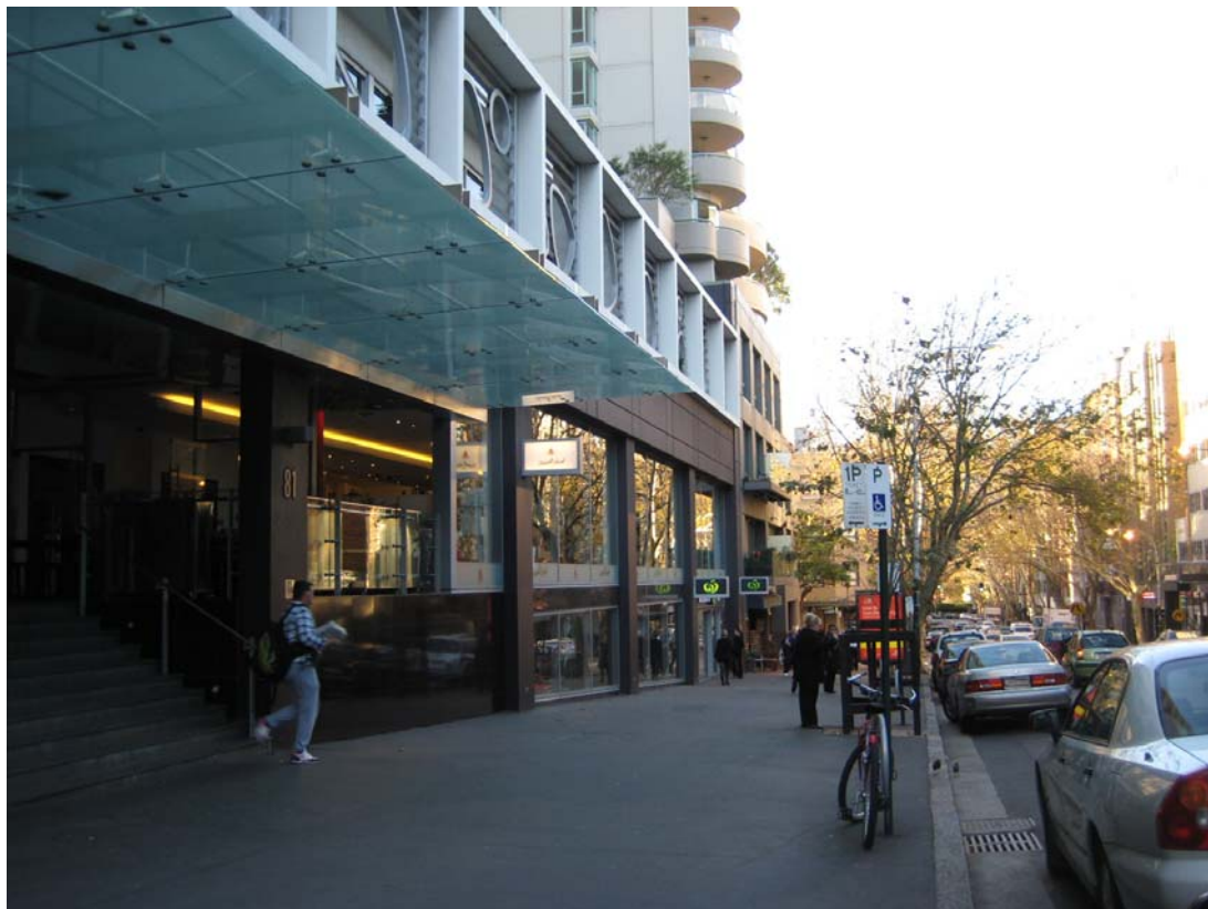
Figure 7: View looking down Macleay Street from residential entrance to Woolworths entrance