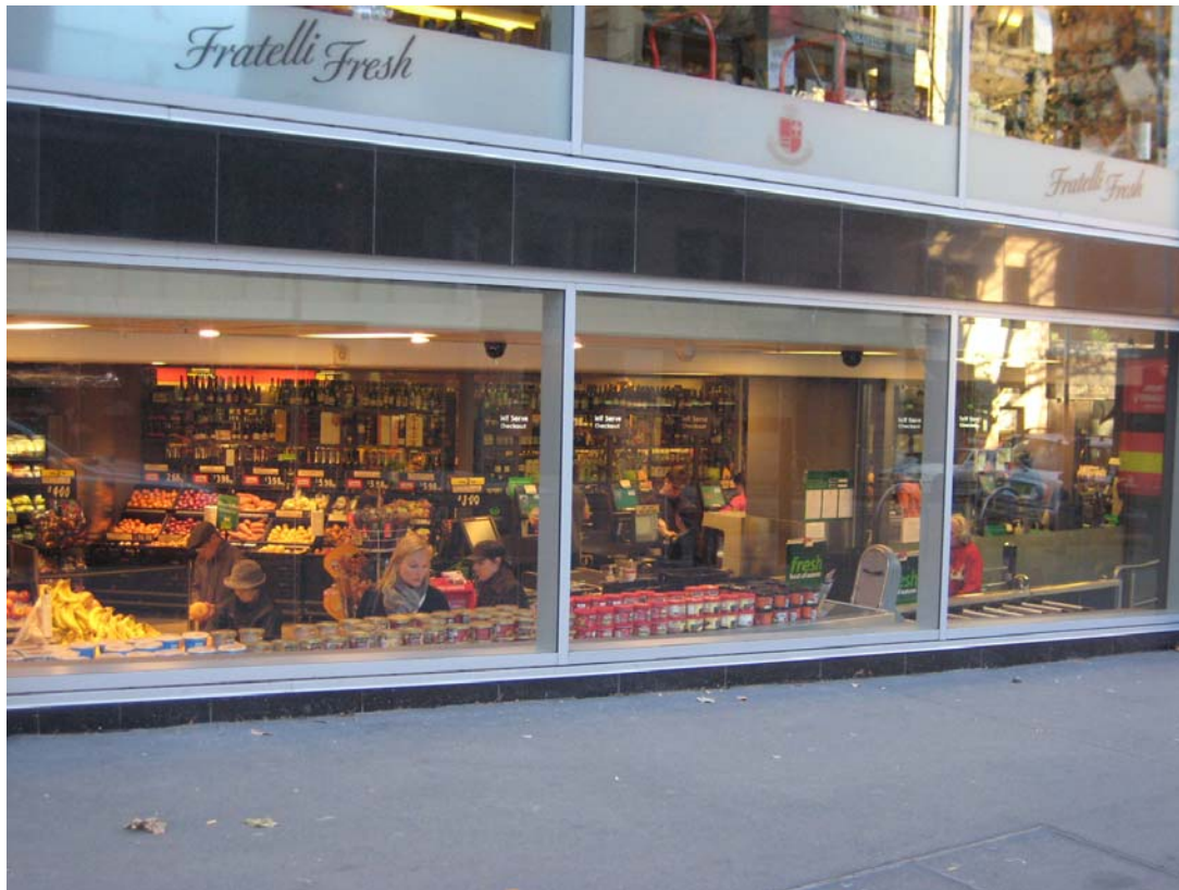
Figure 4: View from Macleay Street footpath – note liquor store location in background