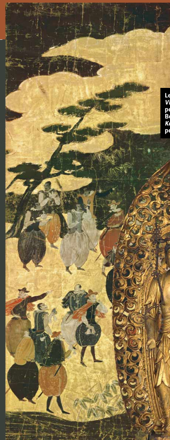
Left: Portuguese Visitors , Monoyama period, circa 1590; Below: Juichimen Kannon , Kamakura period, circa 1250