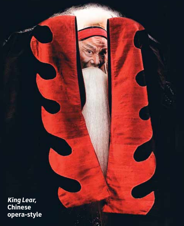
King Lear, Chinese opera-style

Degas: Master Of French Art , National Gallery of Australia, Canberra. His penchant for painting what was once modern daily life is sure to make an impression. www.nga.gov.au