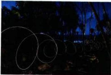
FROM TOP Fig Tree at Lady Jane Beach; Bondi Shark Engraving; Winding Home from the Beach.