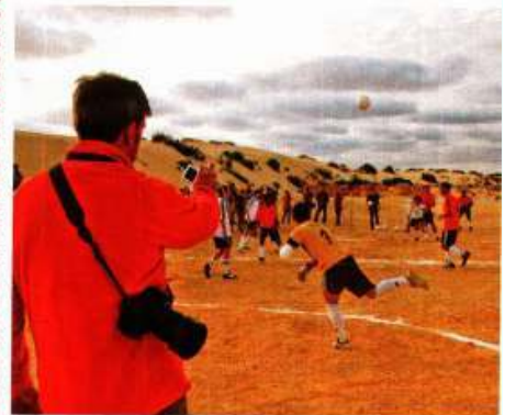
Image taken at the Pinnacles Desert for the UK vs Italy match.

Sony's Twilight Football (soccer) competition was won by the Australian team, which beat Latin America in one of the series of seven football matches played around the globe. The match formed part of Sony's global Twilight Football promotional campaign, which kicked off as the hour of twilight moved across the globe on September 22, 2009. A series of seven games of the round-ball code were played in seven parts of breathtaking locations, including Australia's own limestone landscape in the Nambung National Park (the Pinnacles) in WA. Games were played in the UK, Italy, Switzerland, Spain, Argentina, and