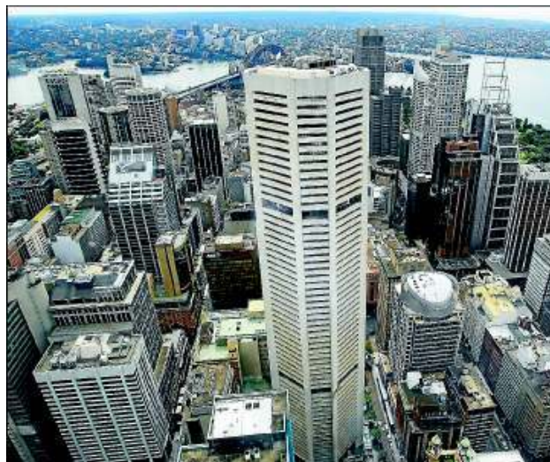
What he saw ... 40 minutes was spent committing the view to memory.