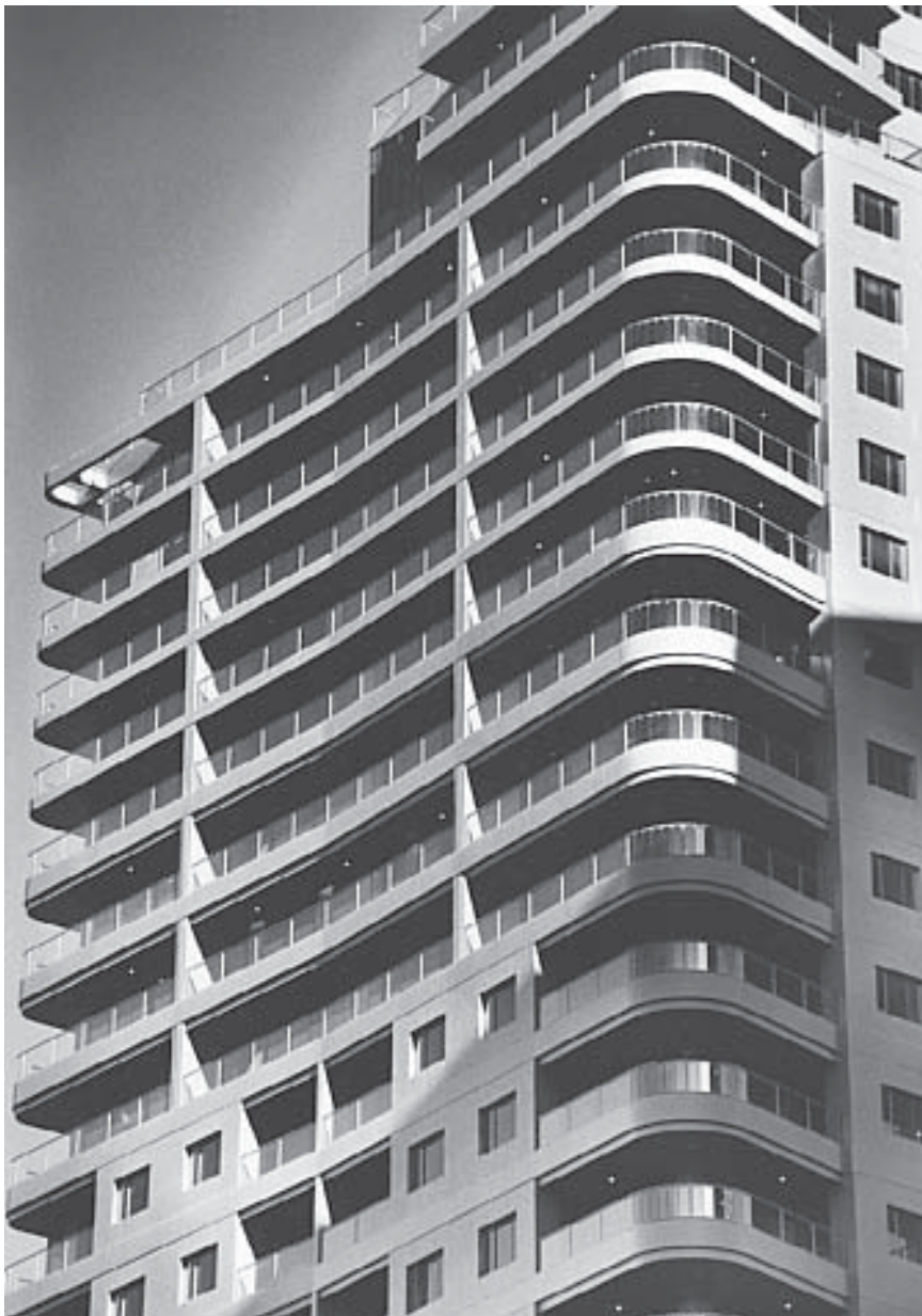
The north facing balconies and windows of Observatory Tower will provide residents with a high level of amenity.