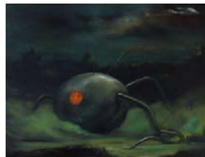
July 11 by Angus Wood, 2010

http://www.ngart.com.au/artists_wood.html