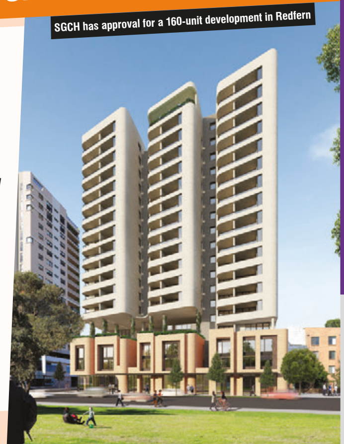
SGCH has approval for a 160-unit development in Redfern