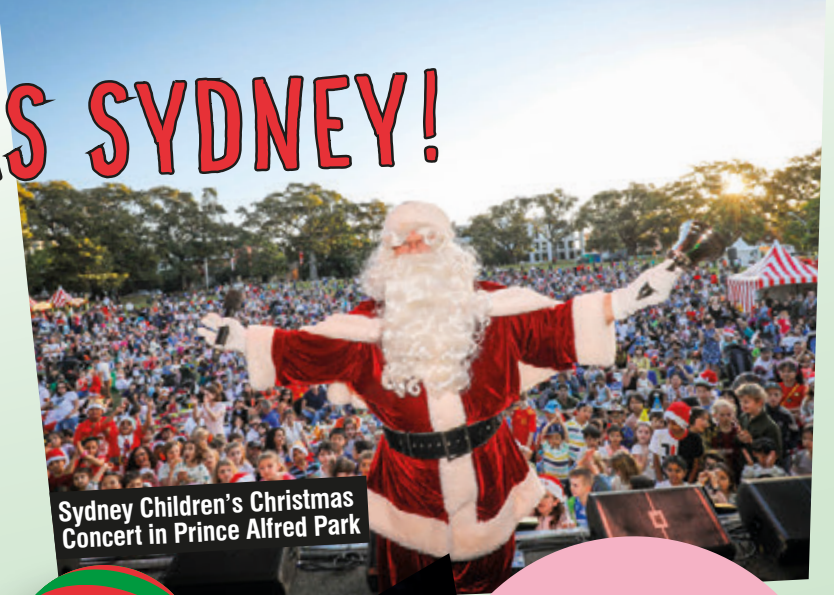
Sydney Children's Christmas Concert in Prince Alfred Park

Visit sydneychristmas.com.au for more information.