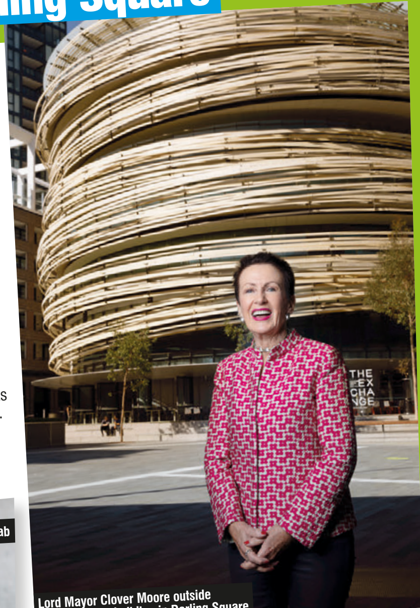
Lord Mayor Clover Moore outside The Exchange building in Darling Square

The Darling Square Library is open from Monday 28 October, 7 days a week. Visit cityofsydney.nsw.gov.au/libraries for more information.