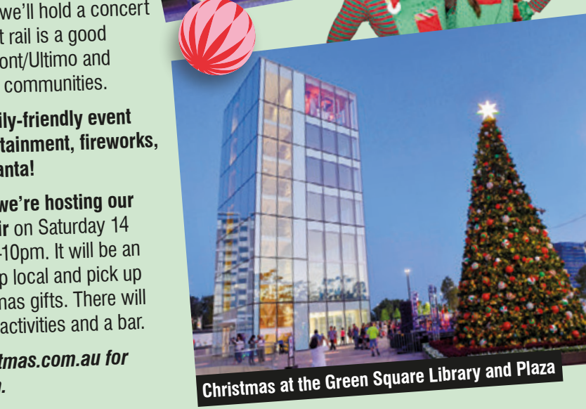
Christmas at the Green Square Library and Plaza

At all events, Santa stockings will be on sale for $5, with all proceeds going to our charity partner, Surf Life Saving NSW.