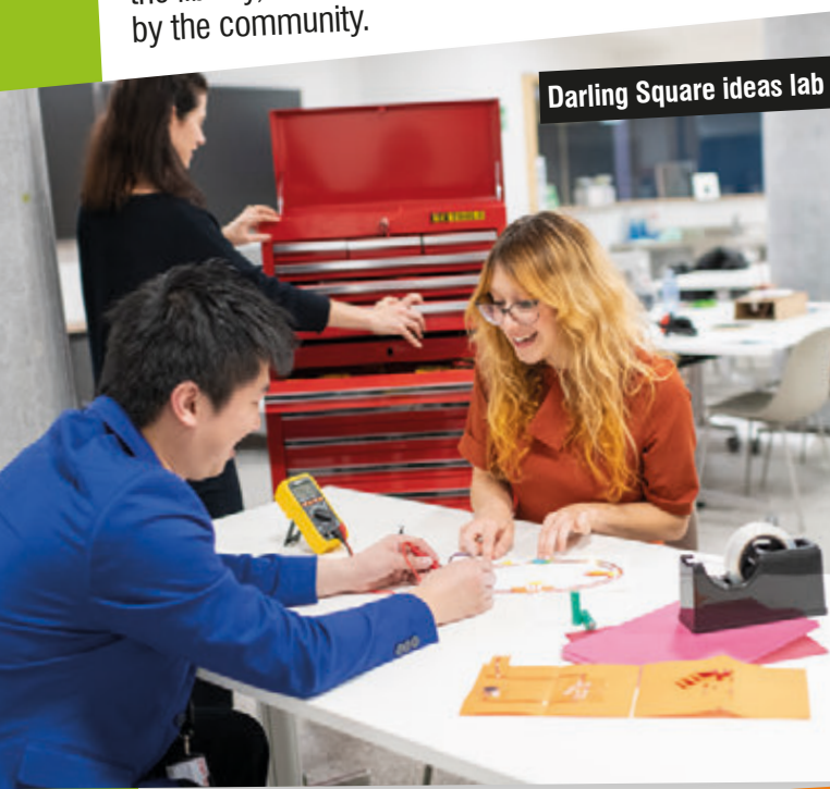
Darling Square ideas lab

There is also a dedicated children's area and spaces to read, work and study throughout the library, including rooms that can be booked by the community.