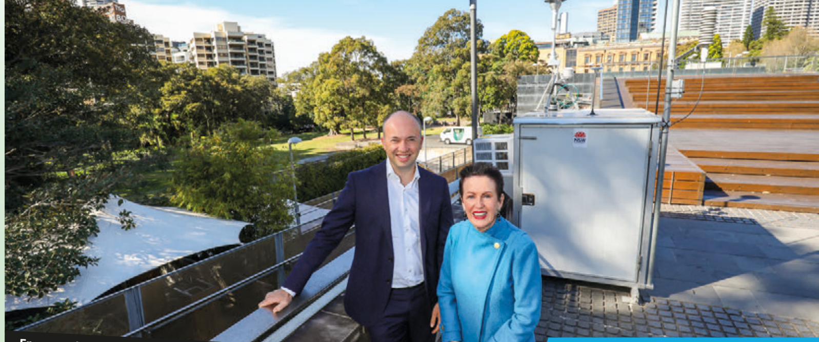
Energy and Environment Minister Matthew Kean and Lord Mayor Clover Moore in front of our temporary air quality monitoring station in Cook+Phillip Park

If you require this information in an alternative format please contact: City of Sydney: 02 9265 9333 council@cityofsydney.nsw.gov.au Translating & Interpreting Service (TIS): 13 14 50