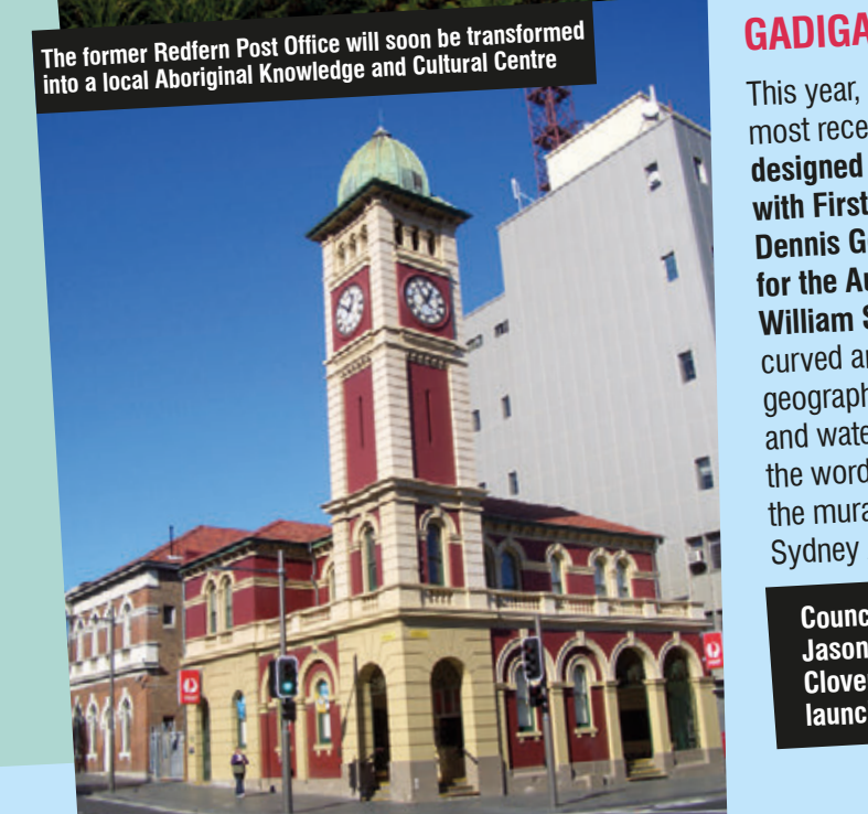
The former Redfern Post Office will soon be transformed into a local Aboriginal Knowledge and Cultural Centre