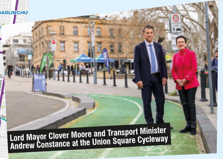
Lord Mayor Clover Moore and Transport Minister Andrew Constance at the Union Square Cycleway