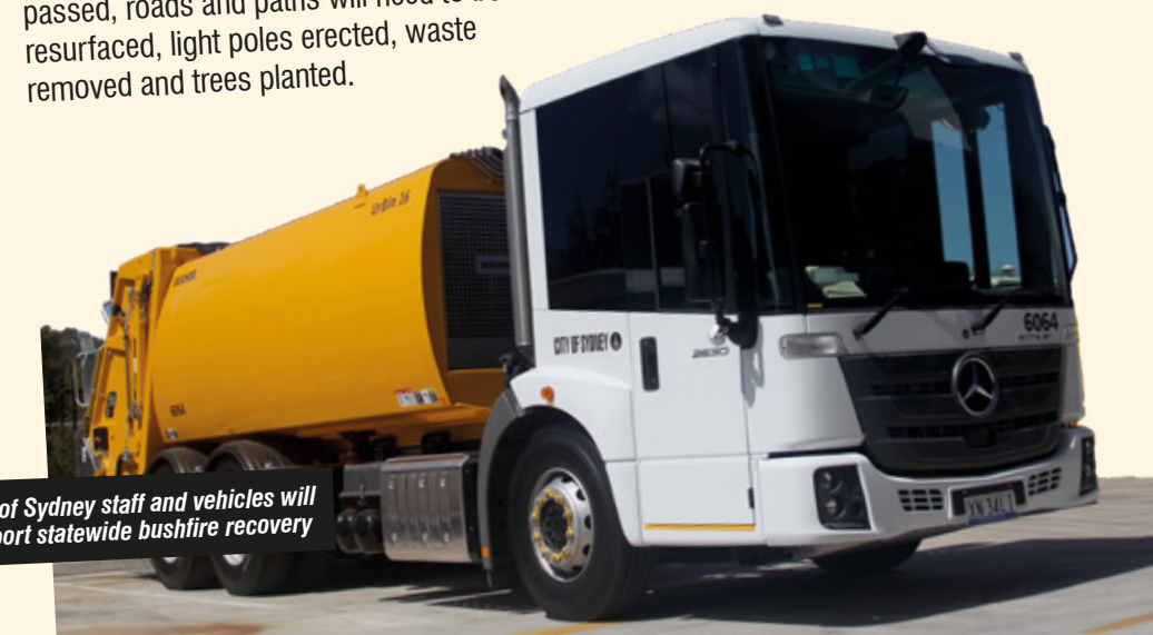
City of Sydney staff and vehicles will support statewide bushfire recovery

We are now working to support councils that will have to replace basic civic infrastructure. In partnership with the NSW Government and Local Government NSW, we have established an office (the Local Government Bushfire Recovery Support Group) to link offers of assistance from non-bushfire affected councils to communities in need.