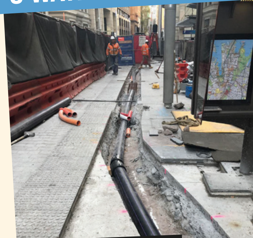
5.6 kilometres of pipes have been installed under George Street to facilitate future recycled water use

The City of Sydney is calling on the NSW Government to scrap 'retail minus' and revert to the 'non-residential prices' that all other businesses are charged, so we can urgently move to recycling wastewater – particularly in urban renewal areas across Greater Sydney.