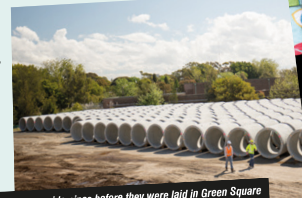
1.8 metre wide pipes before they were laid in Green Square

It also diverts stormwater to our recycling scheme in Green Square town centre, which can deliver 320 million litres of recycled stormwater each year for use in cooling towers and to flush toilets, wash clothes, and water parks and gardens.