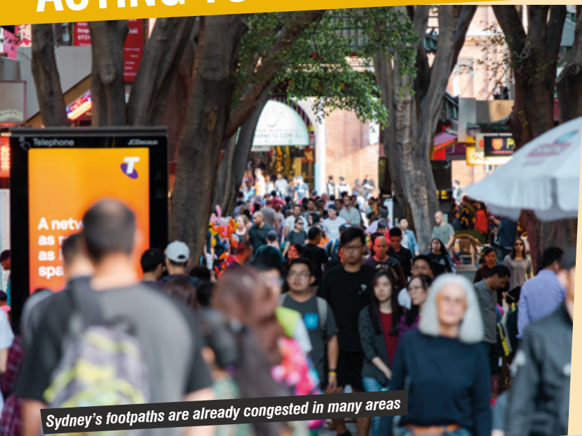
Sydney's footpaths are already congested in many areas

Last year, the City of Sydney joined the City of Melbourne and the City of Brisbane in taking legal action against Telstra over the proposed installation of large payphones with advertising panels and 5G cells in our cities' streets and public spaces.