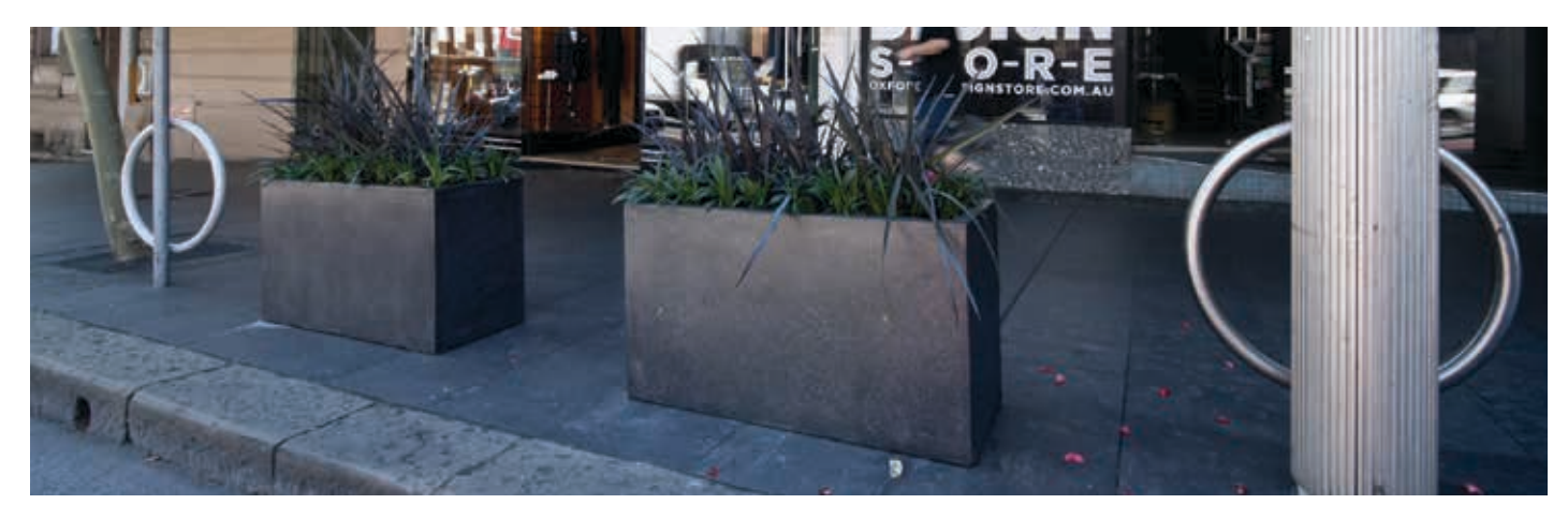
Granite-finish planter boxes - Oxford Street