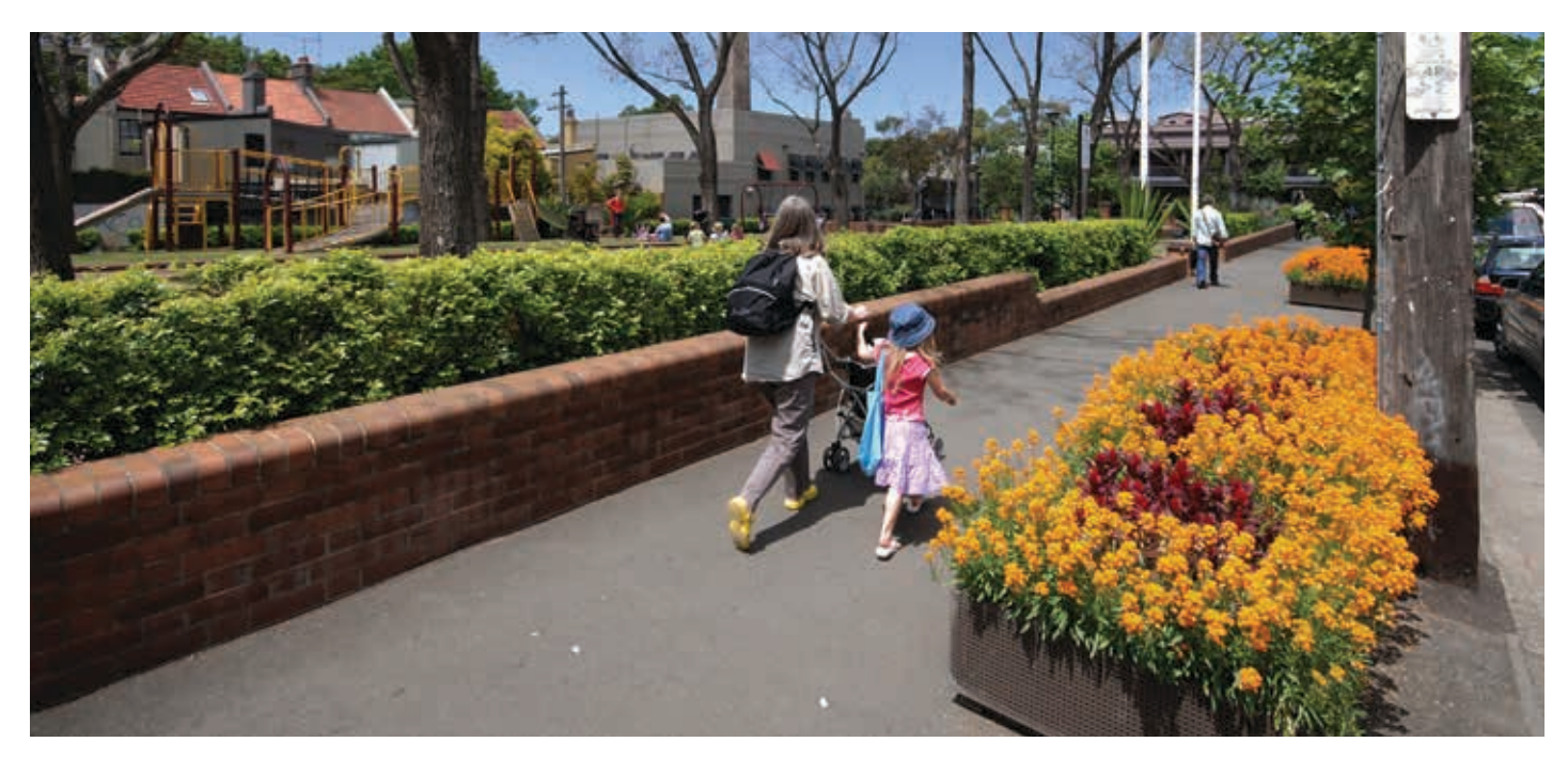
Crown Street, Surry Hills

Major village streets and retail strips (listed below) require the use of a consistent planter box design which reflects the character of the surrounding built environment.