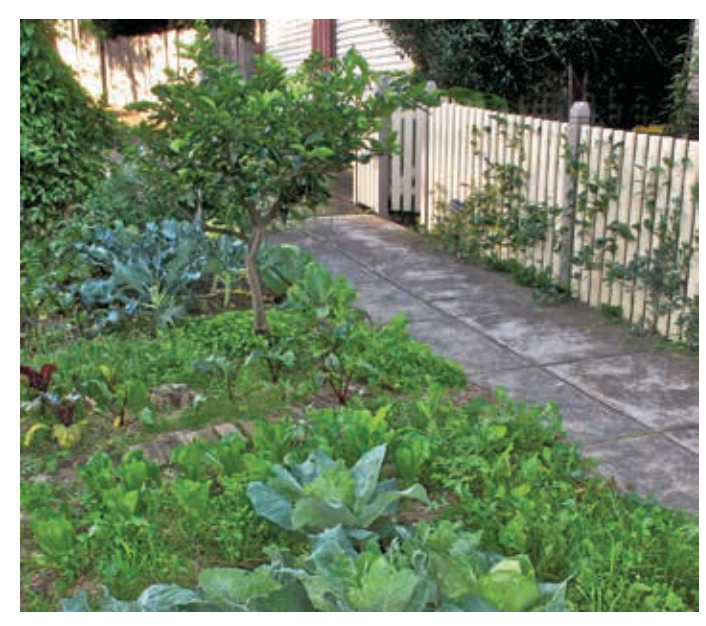
Sydney verge garden