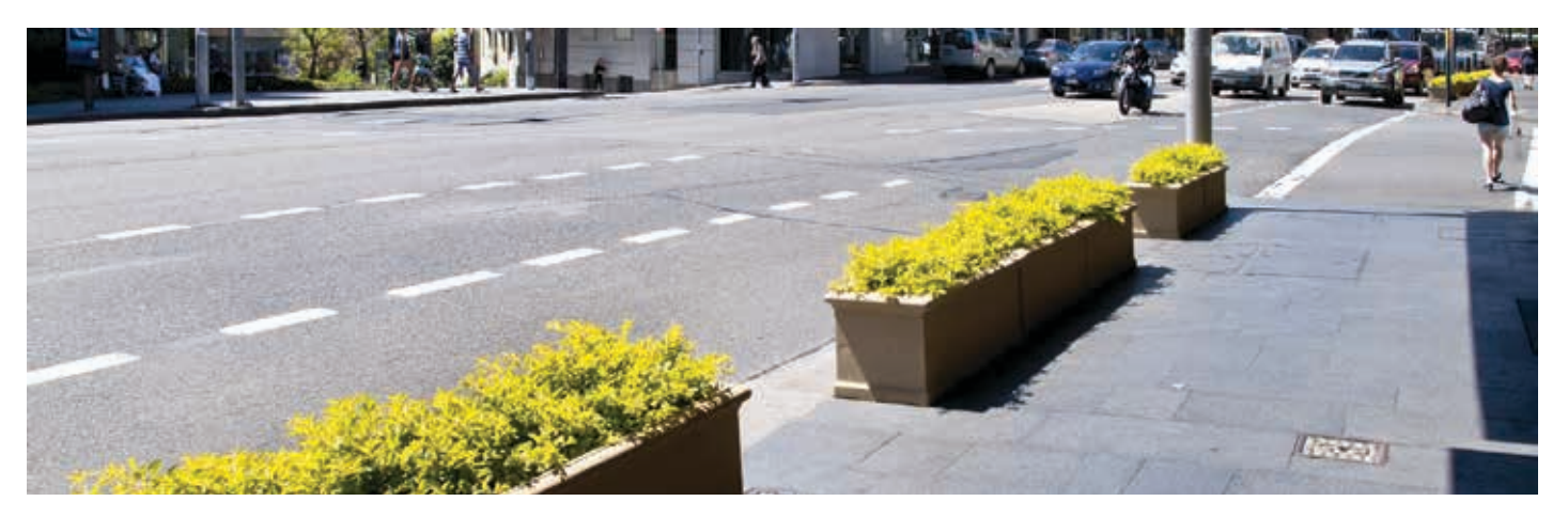
Sandstone-finish planter boxes - Three Saints Square, Darlinghurst