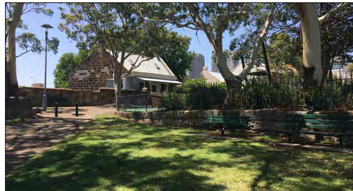
Existing view towards Merriman Street