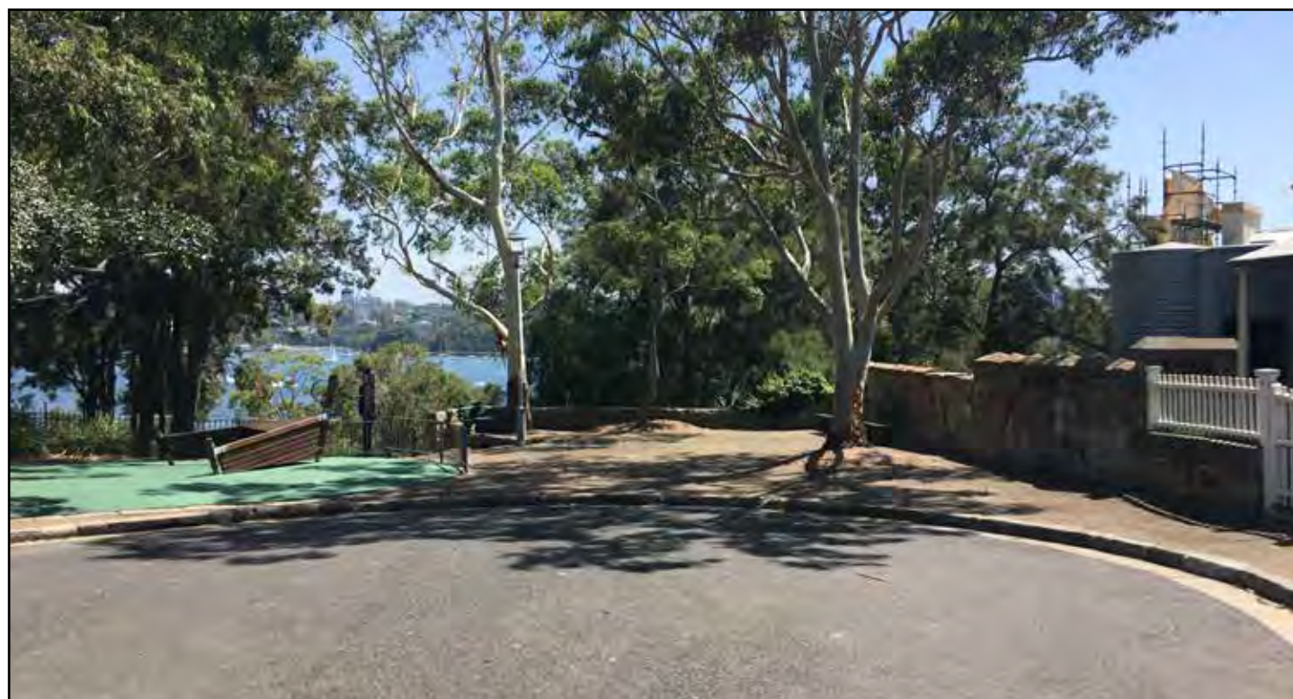
View of existing entry from Merriman Street