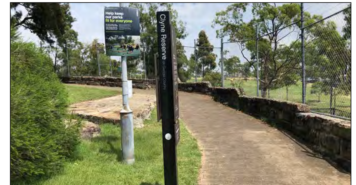
View of existing fence to be replaced