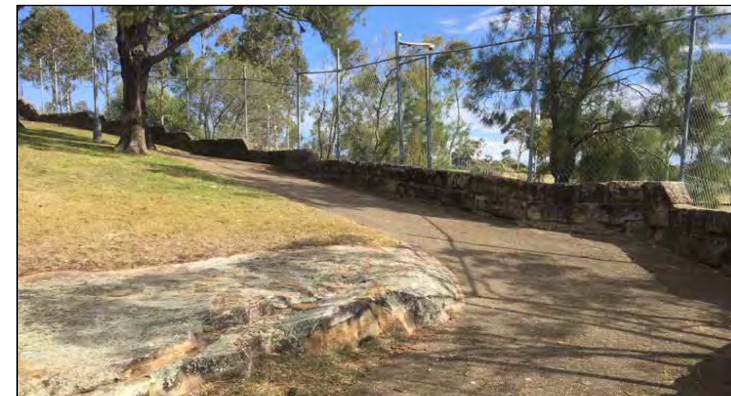
View of existing sandstone outcrop to be retained