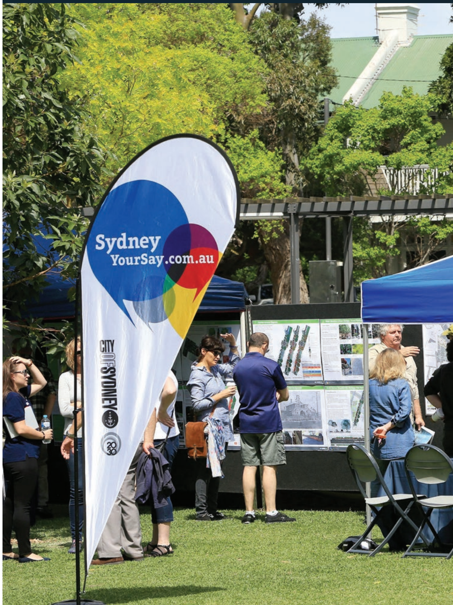
Green Square Info Day October 2016.