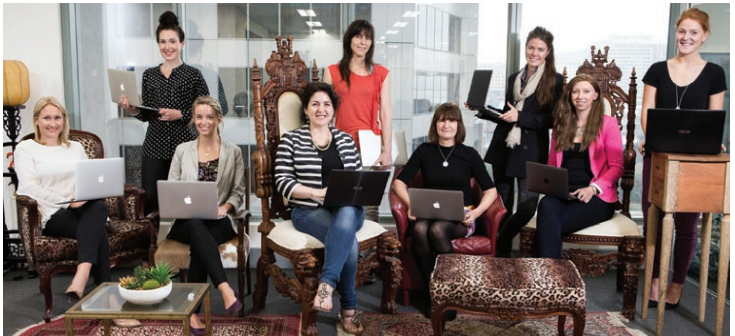
The Ventura, an all-female tech startup co-working space.