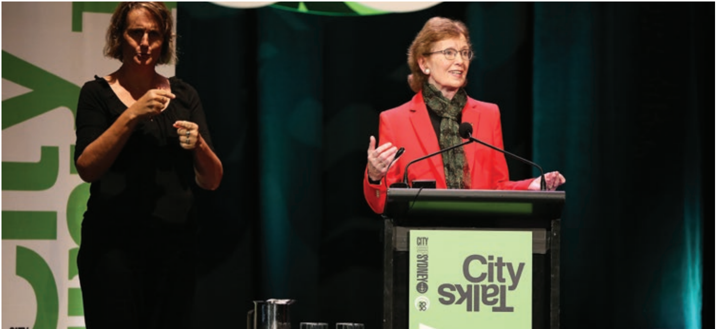
Mary Robinson speaking at City Talks 2016.

The City of Sydney is here to serve our communities and achieve our mutual vision of being a green, global and connected city. We provide regular opportunities for our community to participate in the decisions and projects that shape Sydney's built environment, economy, culture and society.