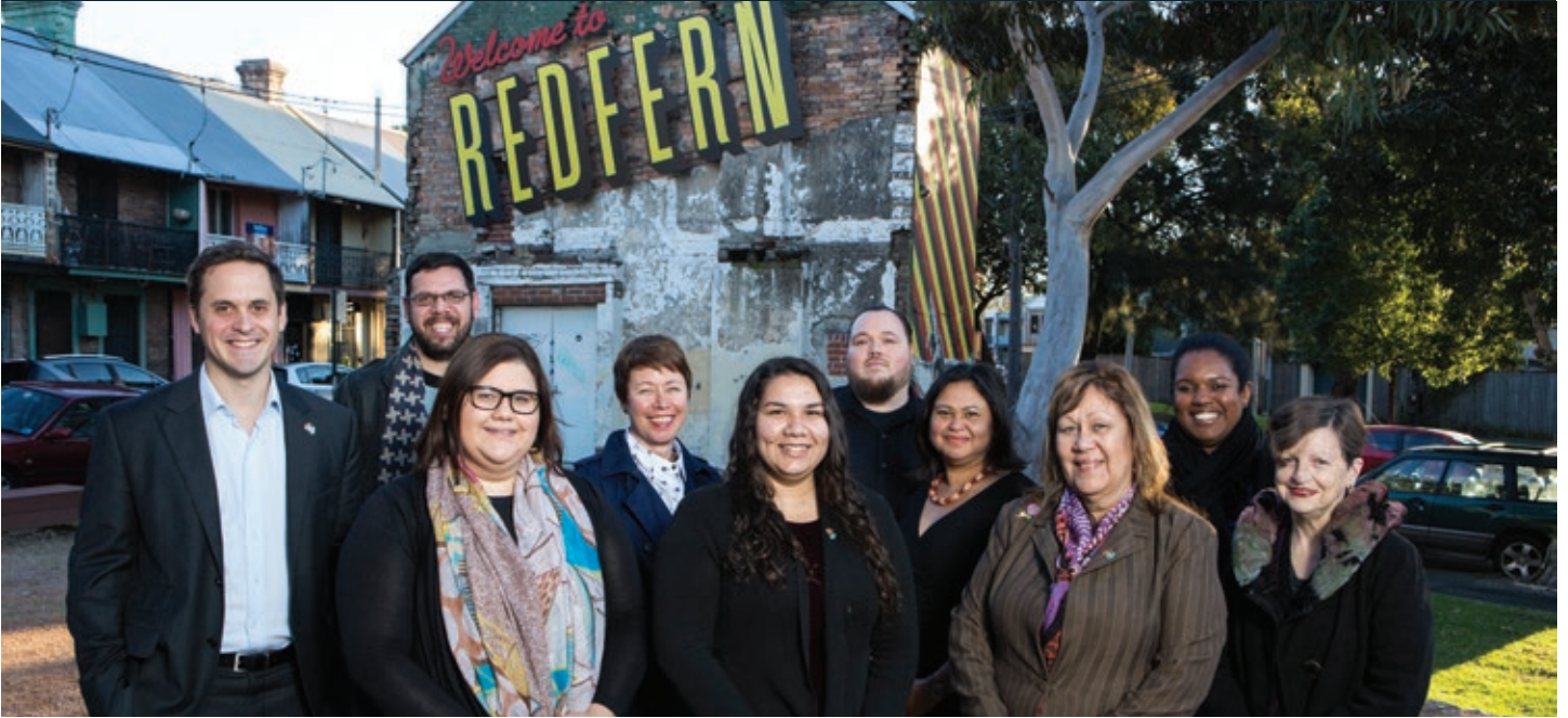
City of Sydney's Aboriginal and Torres Strait Islander Advisory Panel 2016.