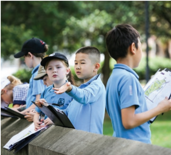
Primary school students provide the City with ideas for improving our parks.