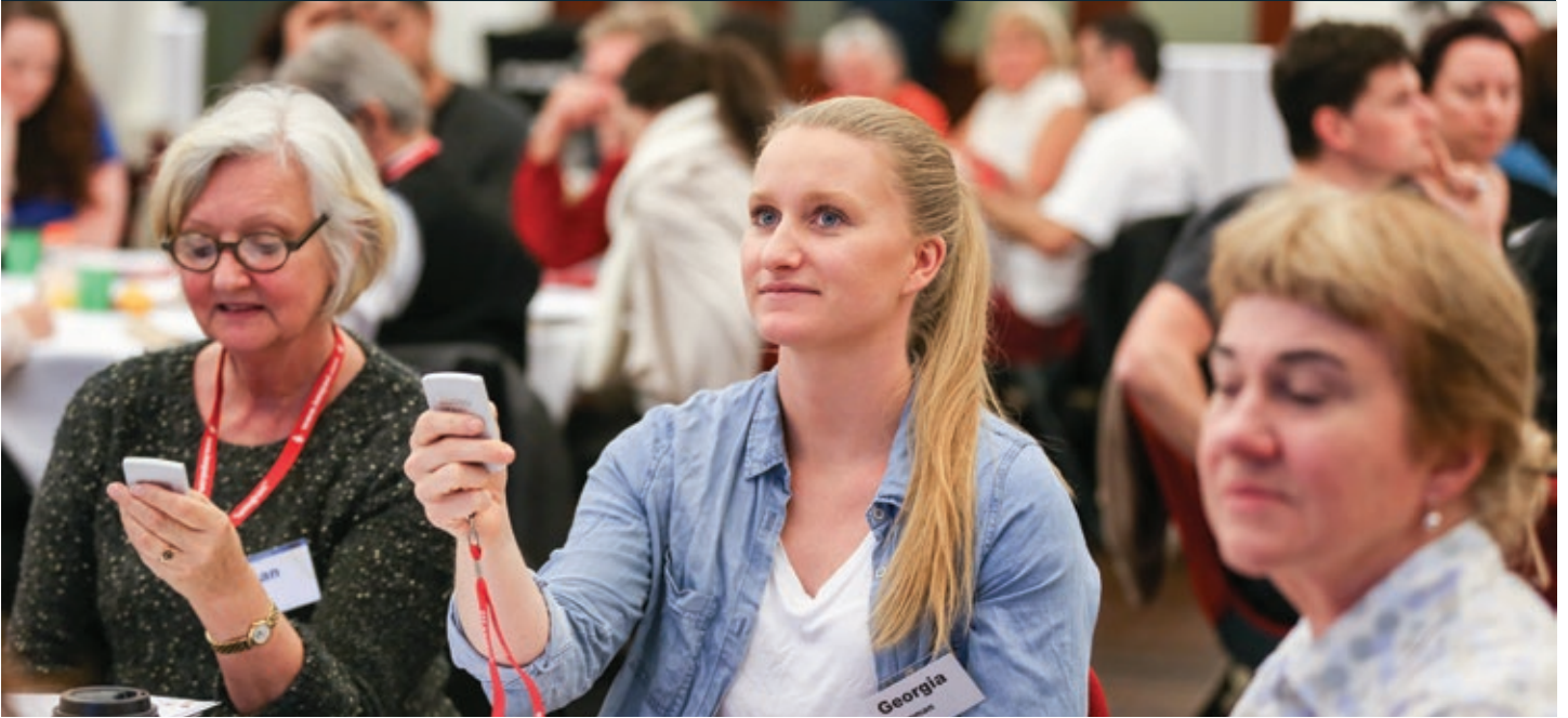
Voting on priorities at the People's Summit.