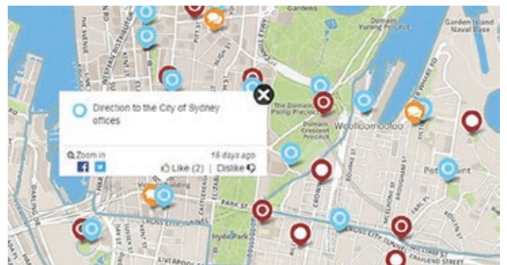
Drop a pin on the map tool from the sydneyyoursay.com.au consultation page

Sydney now has the world's largest braille and tactile sign network. The signs have been widely praised in helping people discover Sydney, explore attractions and find their way around.