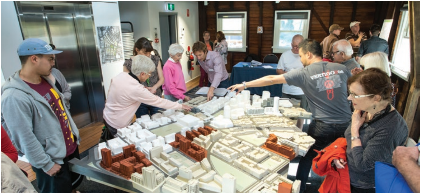
Residents explore the Green Square model 2014 at the Tote.