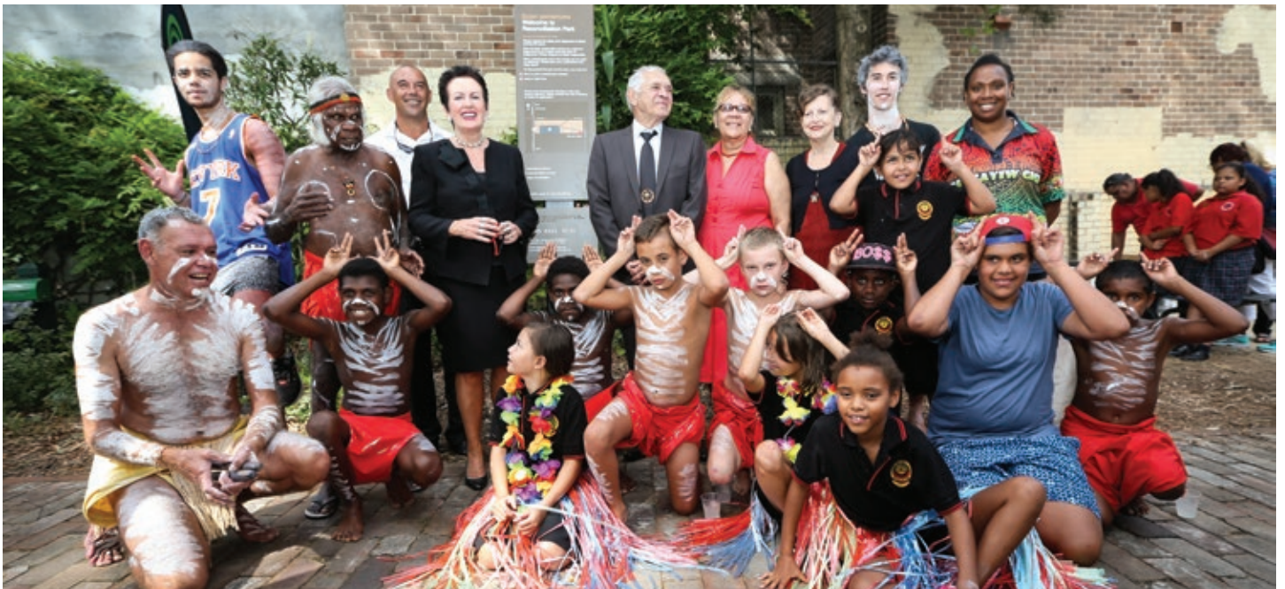
Celebrating the unveiling of the park signage in Reconciliation Park.