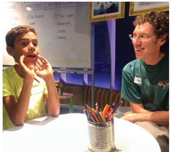
Sydney Story Factory workshop on a City for All.

Other examples align with specific directions of the plan. Some projects have a significant impact, such as the redevelopment of Green Square. Others impact smaller groups, such as those interested in community gardens.