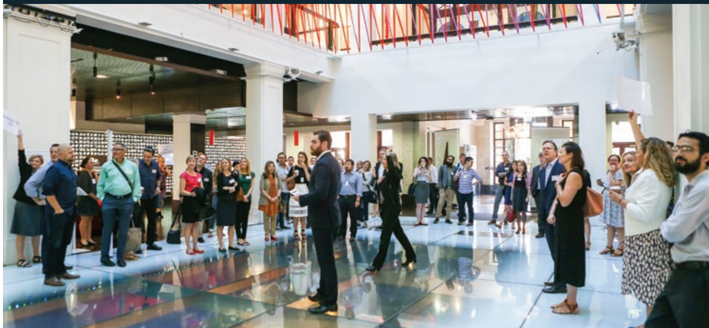
Final working group meeting Resilient Sydney.