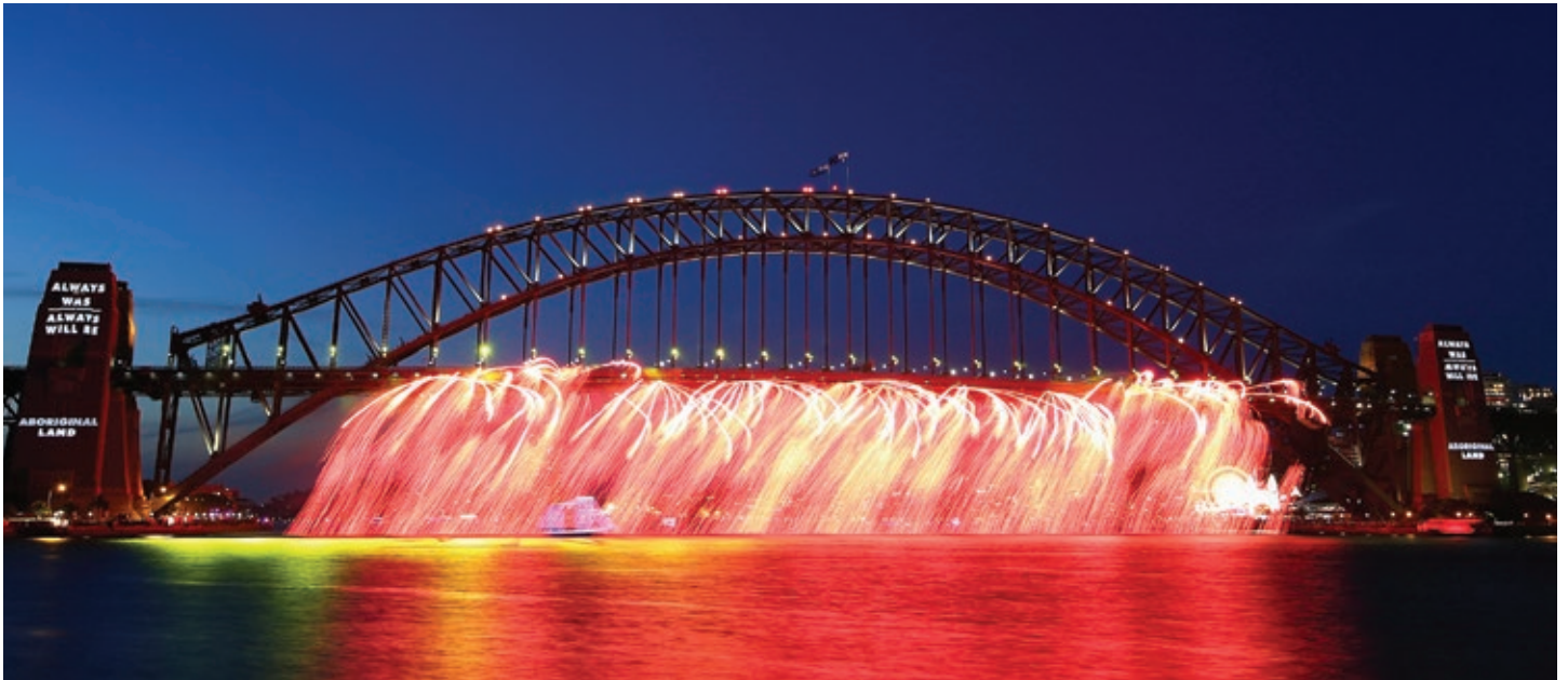
New Year's Eve - Welcome to Country featuring the Tribal Warrior boat and the words Always was always will be Aboriginal Land.