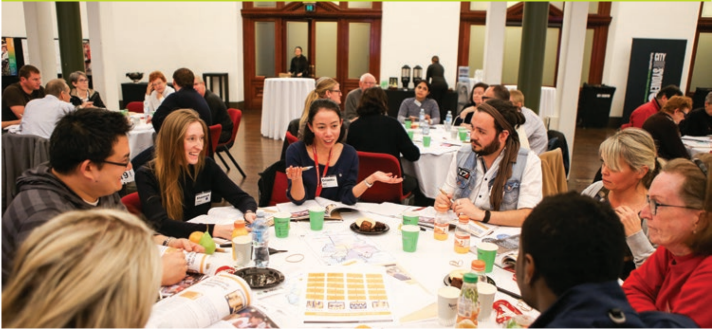
The People's Summit supporting the implementation of the social sustainability policy.