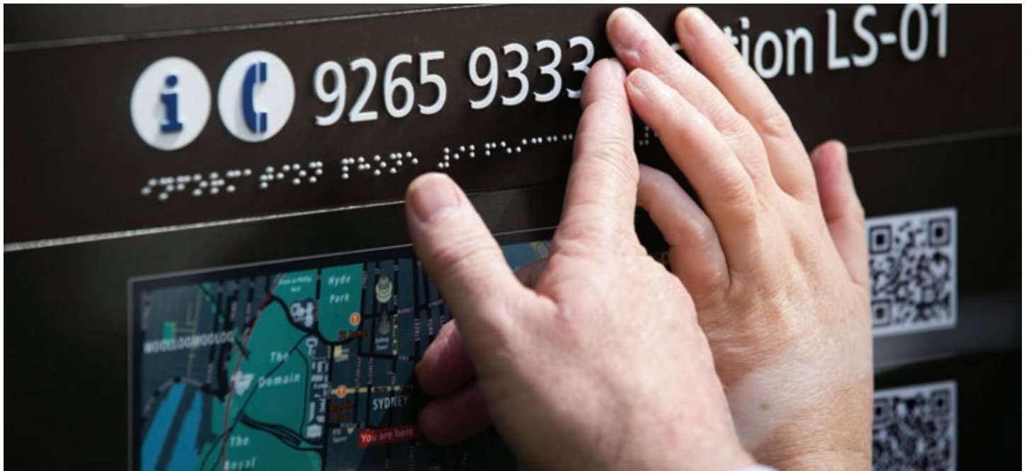
Signage prototype being tested.