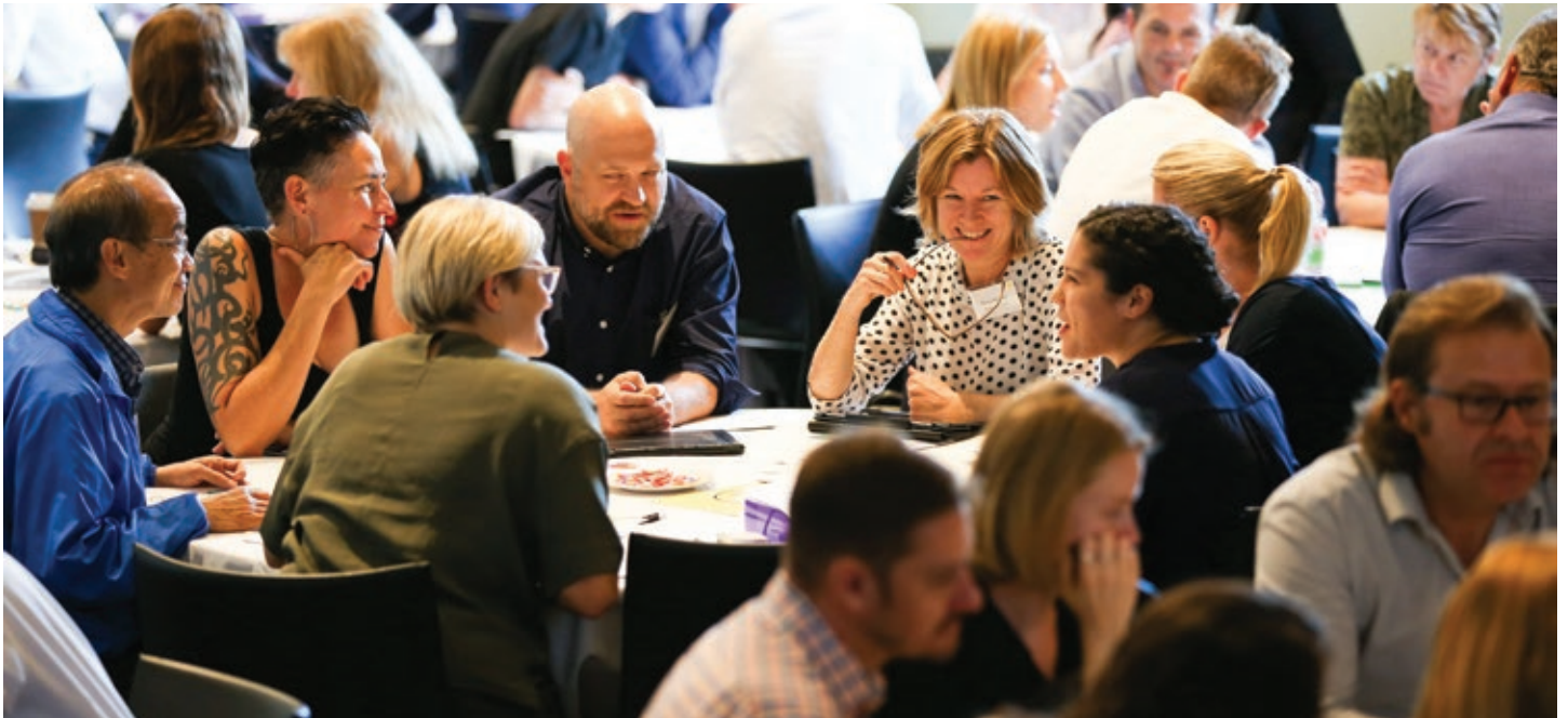
Resilient Sydney Community Meeting, Central District, Parramatta.