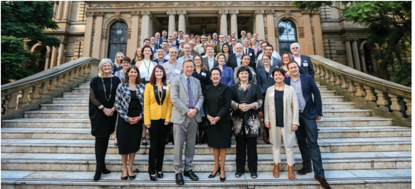
Net Zero Roundtable 2017. Photograph by Katherine Griffiths