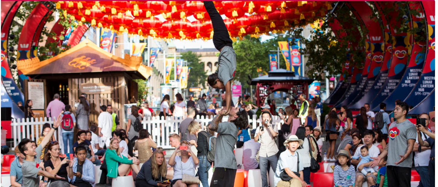
Chinese New Year 2017