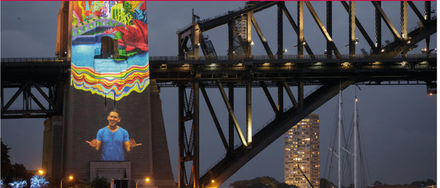
Sydney New Years Eve 2016. Auslan interpreter projected on to Sydney Harbour Bridge Pylon