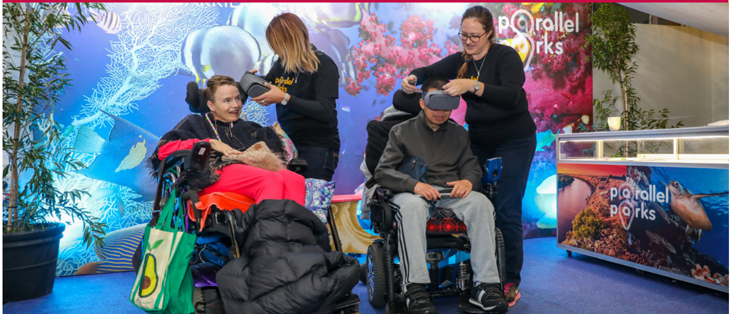
Parallel Parks. People explore the Great Barrier Reef at Customs House Library using Virtual reality headsets