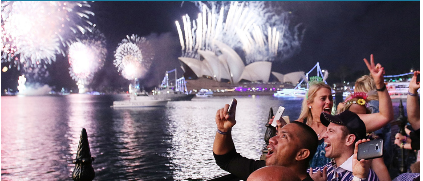
Crowds pictured at Dawes Point during the New Year's Eve fireworks, 2015

The following information that should be included on a dedicated event website: