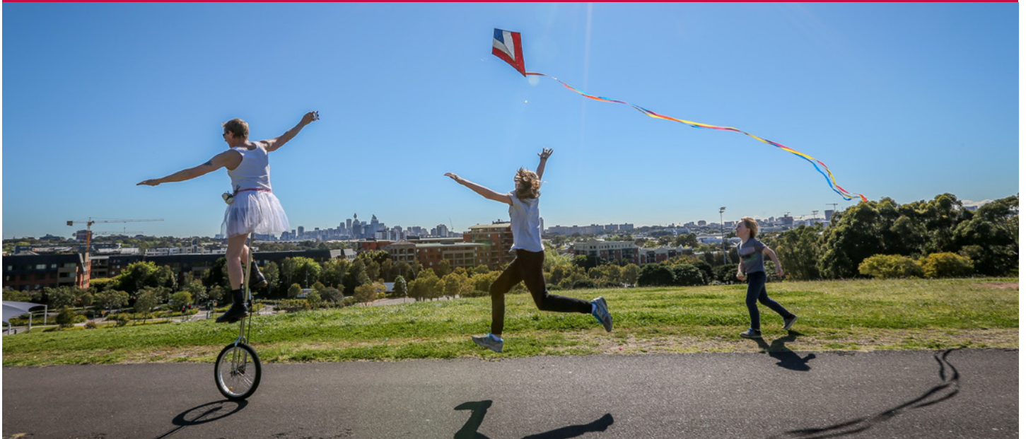
Sydney Rides Festival