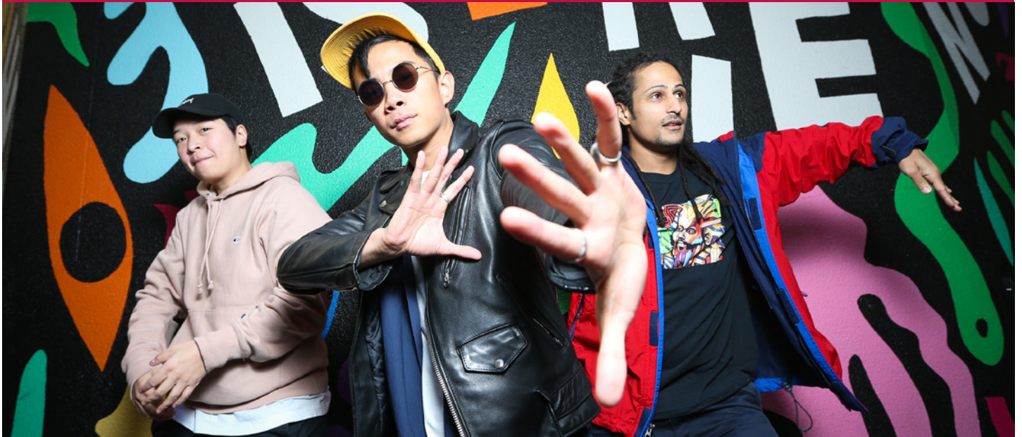
Destructive Steps - Street dance competition 2017