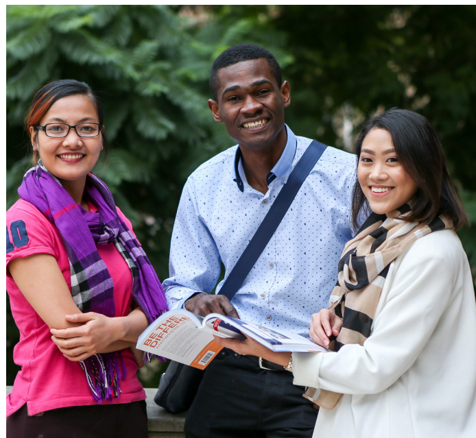
ISLA ambassadors enjoying a book

In 2016–2017, international students contributed $28.6 billion to the Australian economy, making the sector the largest service-based export industry in Australia. Overall, it is the country's third-largest export earner. 2