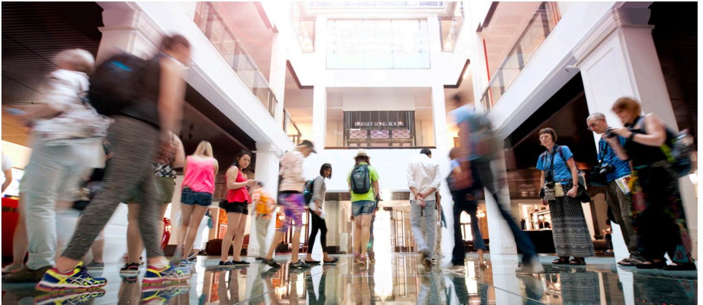
Our Customs House Library offers guided tours for international students to introduce them to general library services and English language learning resources