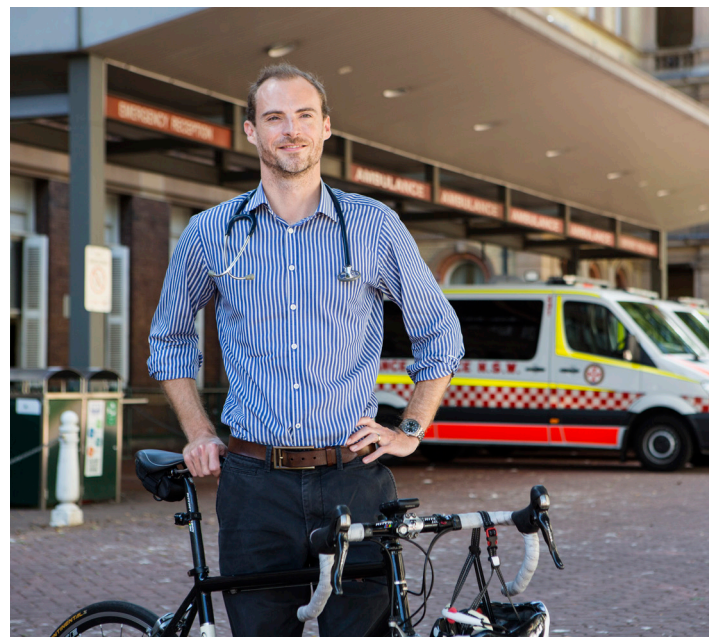
Cycling to work at Royal Prince Alfred Hospital