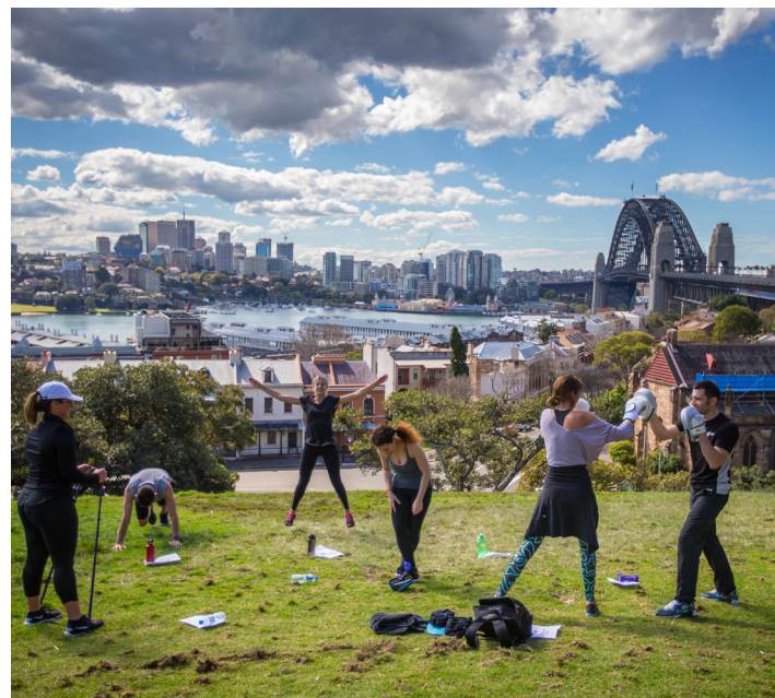
Outdoor fitness class with a view at Observatory Hill

We recognise that students may struggle to find affordable housing. Where appropriate, we will promote and facilitate the development of affordable student housing.