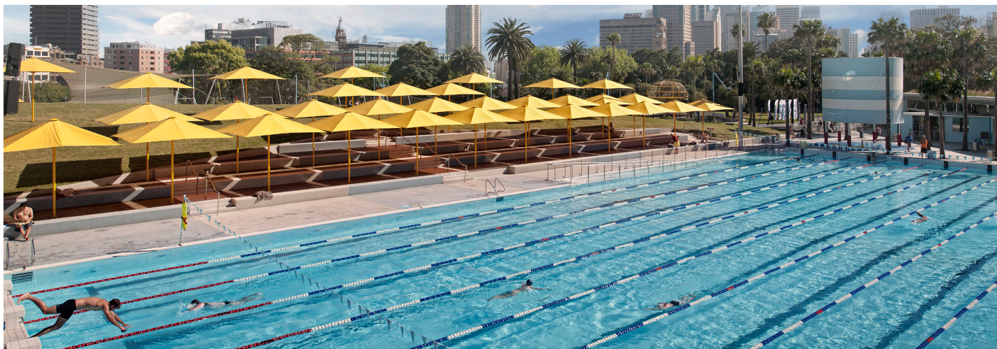
Prince Alfred Park pool is open year round is the City's first heated outdoor pool that is fully accessible. Adult learn to swim classes are available at pools in our local area.

At the end of the first five years of the action plan, we will launch a major review.