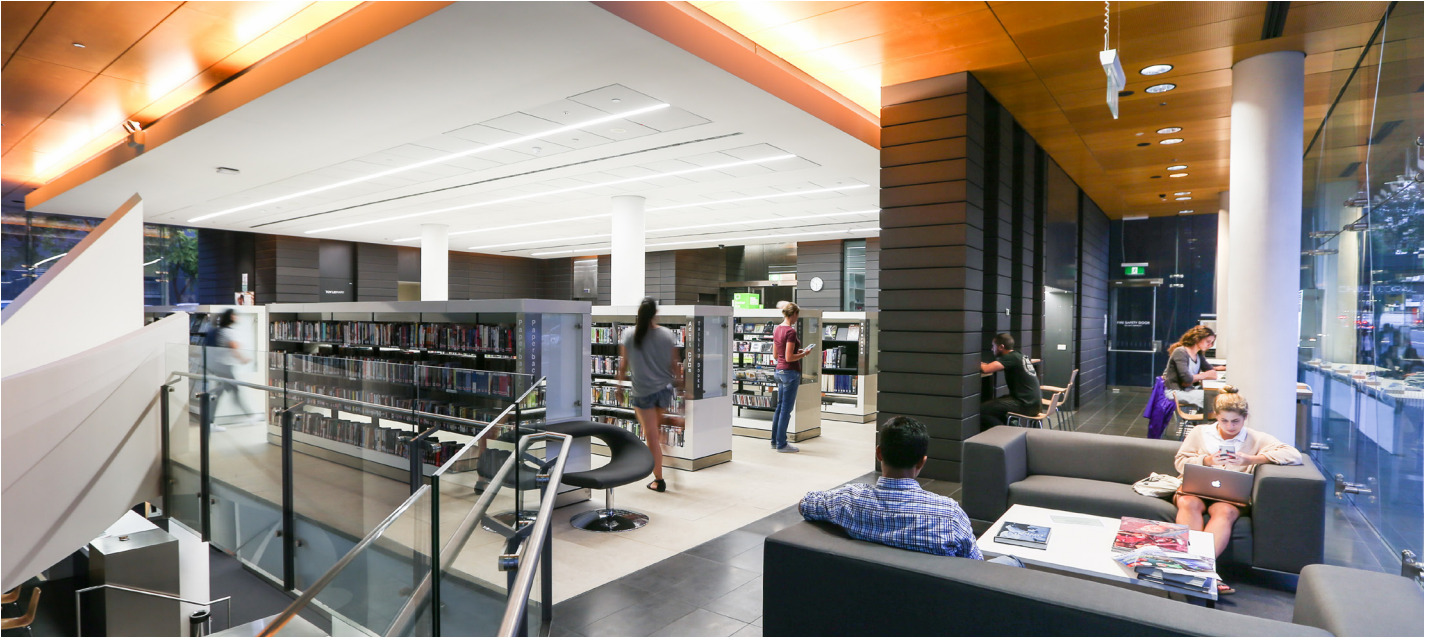
Our Surry Hills Library pictured above spans four floors and is open seven days a week. It also houses a community centre and childcare centre.

Our role is to work with industry and government partners to create an investment climate that allows the international education sector to grow and diversify. Through research and collaboration, three key themes were identified for how the City can best support the sector. They are welcoming, wellbeing and work-integrated learning. International students' study experiences – specifically, what happens outside the classroom – are key to enabling Sydney to stand out as a globally favoured education destination, and the City is uniquely placed to support these experiences.