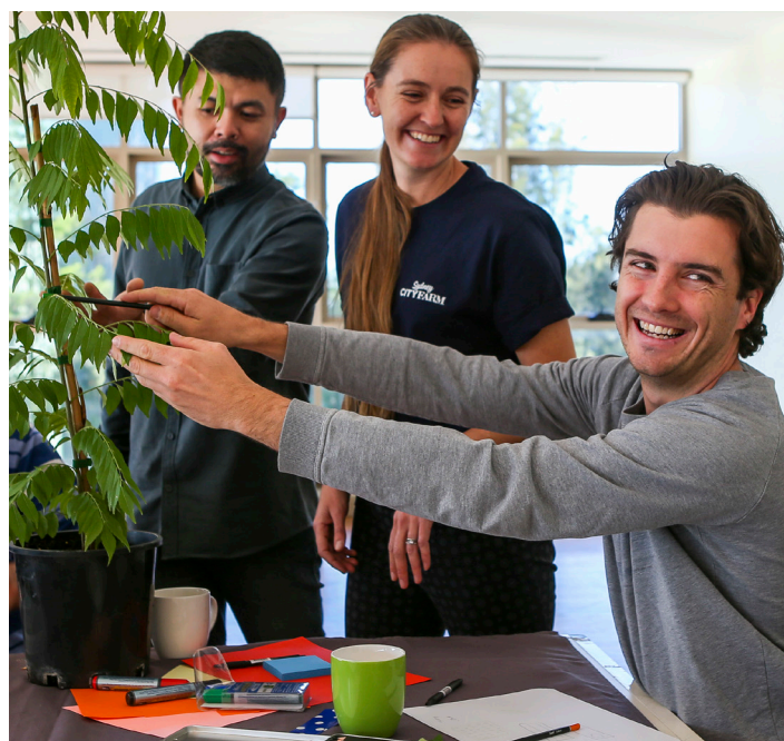
Group participating in a workshop at Sydney City Farm, an urban agriculture project in Sydney Park

We know that international students take many factors into account when deciding where to study. We can't influence all these factors but, by working with strategic partners, we can help ensure that Sydney remains Australia's premier education destination, and a global leader.