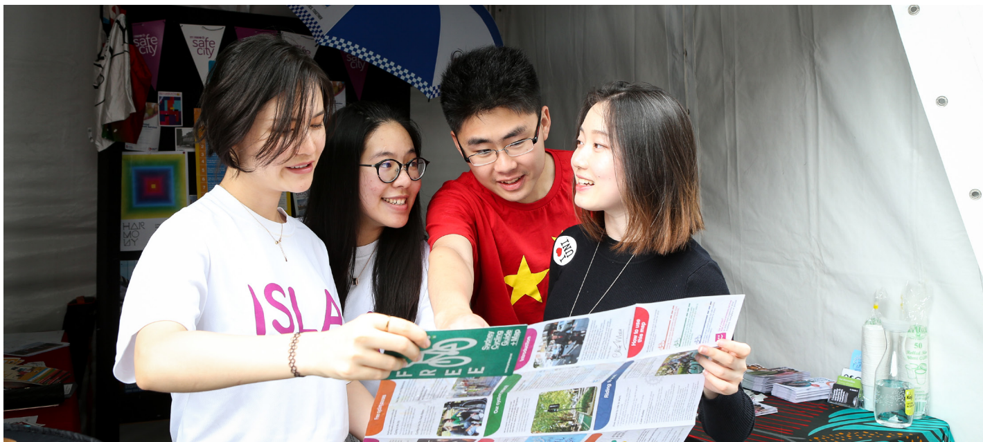
ISLA ambassadors hosting an information stall at an orientation event