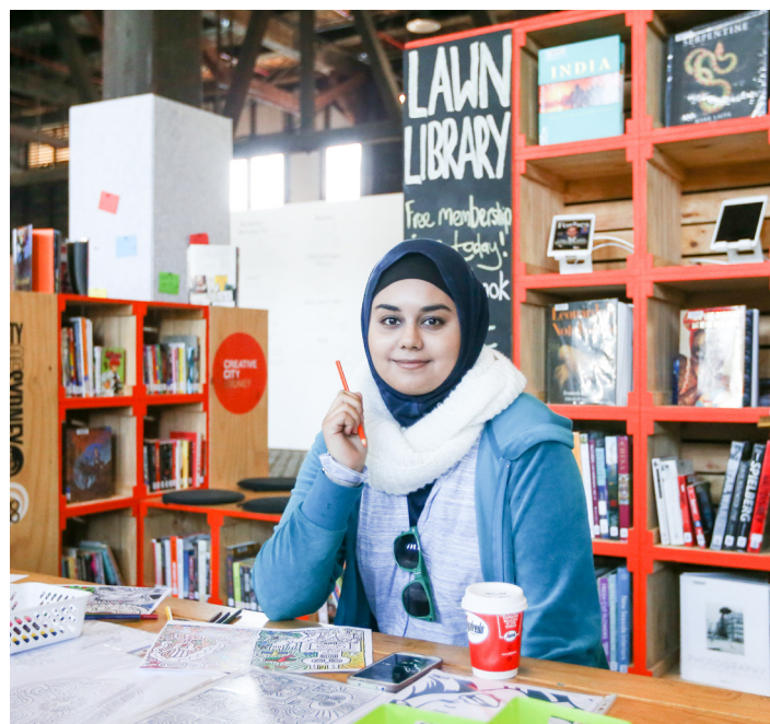
Lawn Library activation at the Sydney Writers Festival held at Walsh Bay

This will support the structural adjustment of the economy towards the valuable knowledge sector, which can help secure the living standards of Sydney residents well into the 21st century.