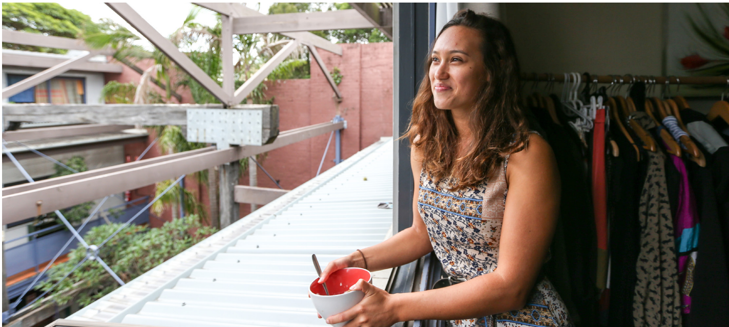
A cooperative housing complex in Newtown providing affordable housing for students