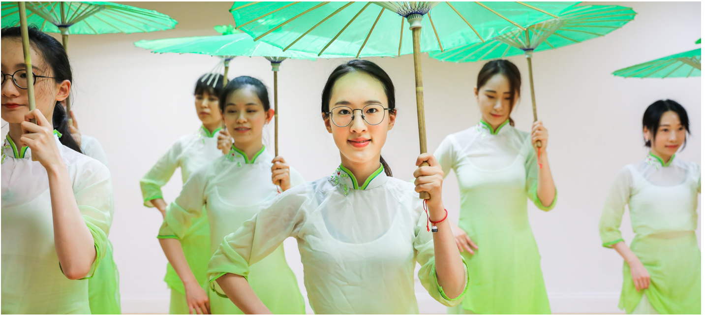
Chinese New Year 2018 festivities include events run by ISLA ambassadors for international students