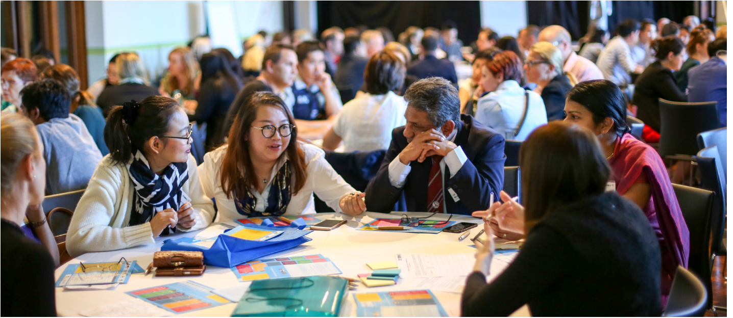
Group discussion at the Education Provider Forum on international student wellbeing