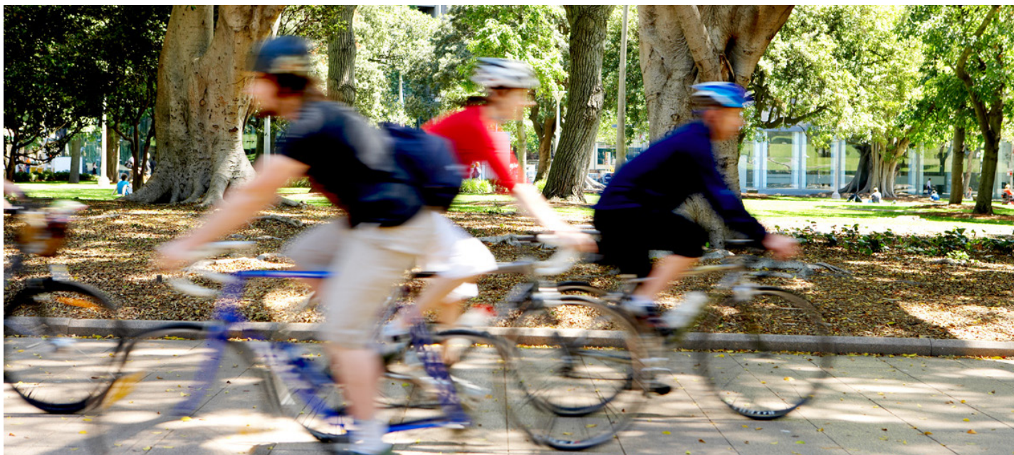
The City offers courses on cycling, bike care and maintenance at the Sydney Park Cycling Centre