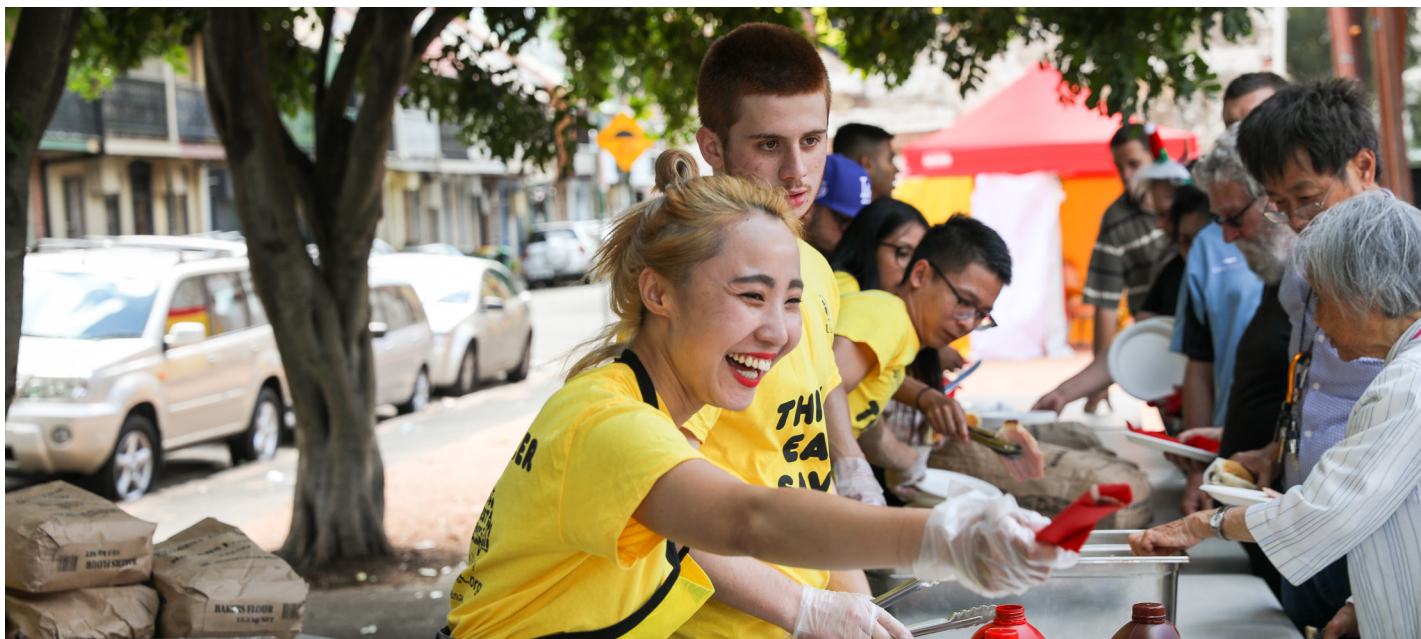
Volunteers helping at the Redfern Community Centre Christmas Party

Globally, the international student market is one of the fastest growing industries in the world, and national and international competition is intensifying. This means we can't be complacent, and we can't work alone. We need to partner with StudyNSW, the NSW Police Force, Redfern Legal Centre and Sydney's educational establishments to maintain our status as a premier education destination.