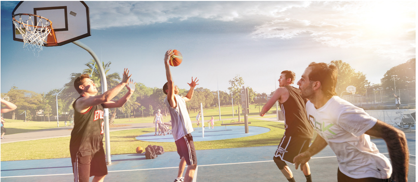
Prince Alfred Park offers 7.5 hectares of green space, basketball courts, tennis courts, fitness stations as well as benches to sit and relax, barbecue facilities and picnic areas