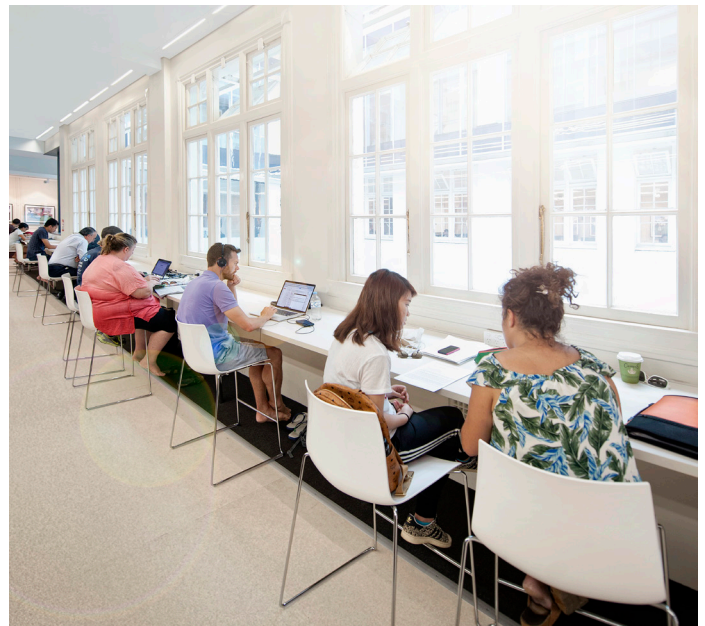
The library network offers access to a huge number of books, CDs and DVDs

Australia's education sector is so globalised that one in five students is from abroad 5 , with students from Asia making up more than two-thirds of their number. 6 In Sydney, most of our international students are from Asia, putting the city in a strong position to benefit from these growing economies. 7 In addition to benefiting employers who hire international students, the sector can help local businesses, workers and residents build productive social, cultural and business relationships in Asia.