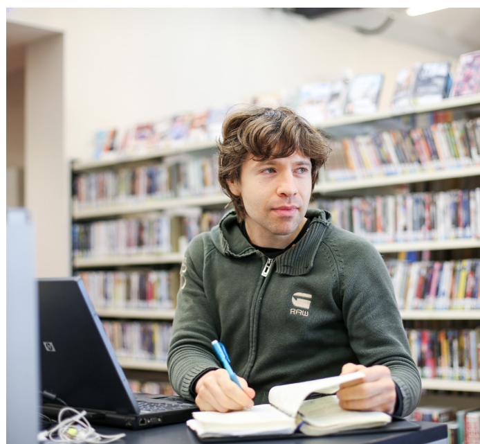
Our libraries offer study space and free wifi

The quality of the international education sector enhances Sydney's position globally as a leading education and research destination. The sector also delivers direct and indirect benefits to local economies, creating jobs and contributing to the community. International students increase cultural diversity, enhance the vibrancy of the city and promote its reputation internationally. Today's student is tomorrow's ambassador abroad.