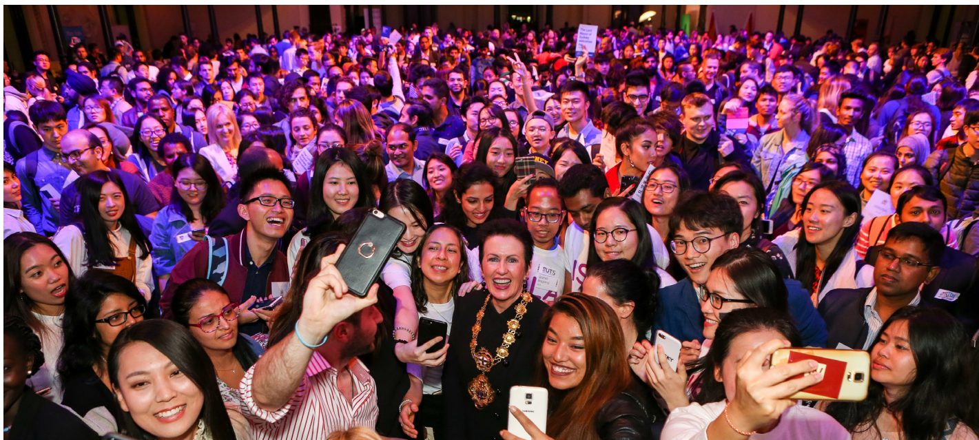
Official Welcome to Sydney for international students at Sydney Town Hall