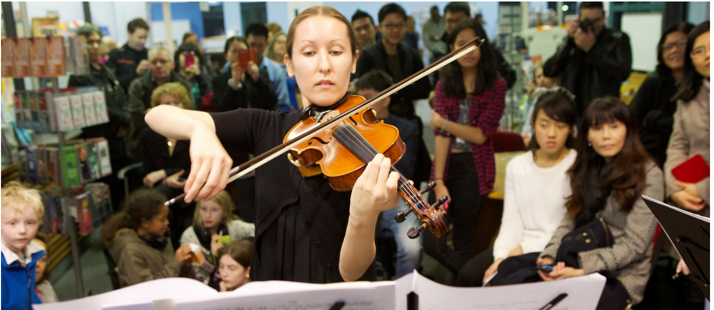
International students can attend community events, such as the one above held at Glebe Library featuring The Glebe Strings Ensemble