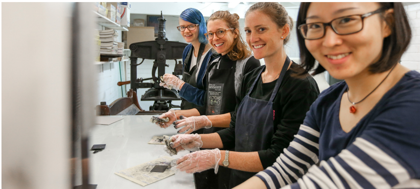
Group enjoying a workshop at Pine Street Creative Community Arts Centre