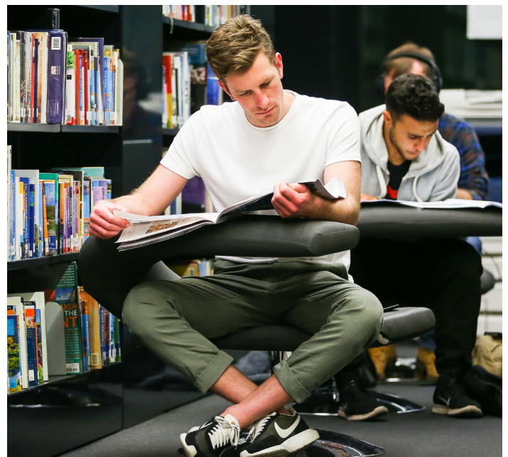
Our libraries offer a quiet place to study

We will examine quantitative and qualitative indicators to track the success of the actions in this plan. Our indicators will not be absolute measures of performance, but rather signal trends in the sector. We may be able to compare the results we generate with Australian and NSW statistics on the education sector. However, we will not be able to tell whether the local sector is outperforming or underperforming against state or national trends.