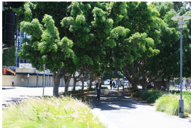
Figure 31 - Prominent Fig planting often defines the harbour foreshores and extends into surrounding park and reserves.

Given that most underground and overhead services run in the existing footways and verges, providing new planting blisters, mid-road islands or median strips within the road carriage way