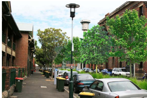
Figure 34- An artists impression of potential median planting in Windmill St, Millers Point

The proposed species to be planted in-road shall be as per the precinct maps contained in Part C unless special circumstances or design constraints dictate otherwise.