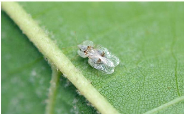
Figure 44- Sycamore Lace Bug - Adult Stage

The ultimate affect of this pest on Sydney's Plane Tree population is still unknown but attempts have been made in this 2011 Master Plan to reduce the reliance on Plane Trees and continue to investigate the efficiency of treatments such as insecticide injections to affected trees.