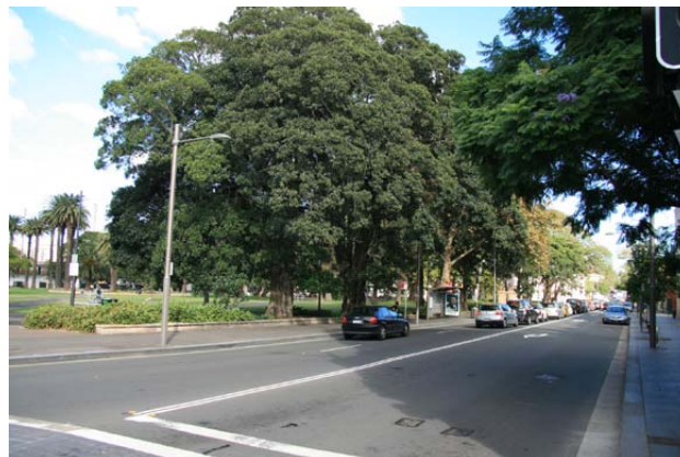
Figure 24- Victorian era planting in Redfern Park provides strong historic and cultural associations and contribute significantly to the street character

The selection of species may be made to reinforce historical, cultural or natural associations from our past, particularly Victorian era landscape planting.