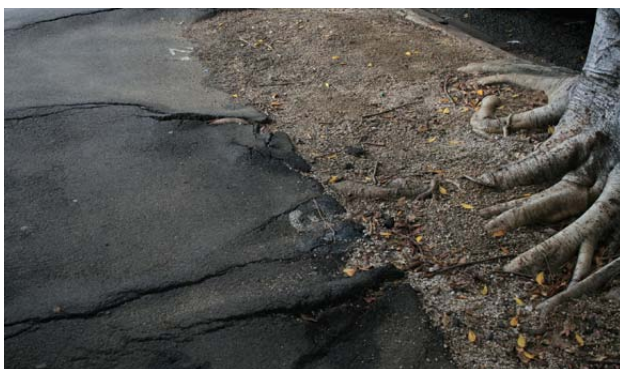
Figure 27- Shallow soils or too larger trees can lead to pavement damage and the associated risks.