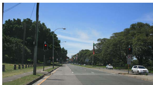
Figure 30- Anzac Parade; one of the grand Fig Avenues leading to the city. These suitably large trees are planted in the adjoining open spaces but form the streetscape. Additional tree planting within the street verges would simply detract from these grand statements and will typically be avoided.