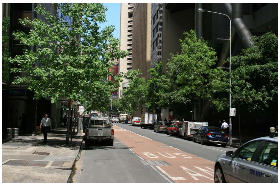
Figure 17 - City high rise buildings and fully paved environments can present very difficult conditions for street trees.

Many areas are also extremely disturbed and have the original soil stripped and replaced by building debris and landfill materials including garbage. This is particularly common around the harbour foreshores and the industrial areas.