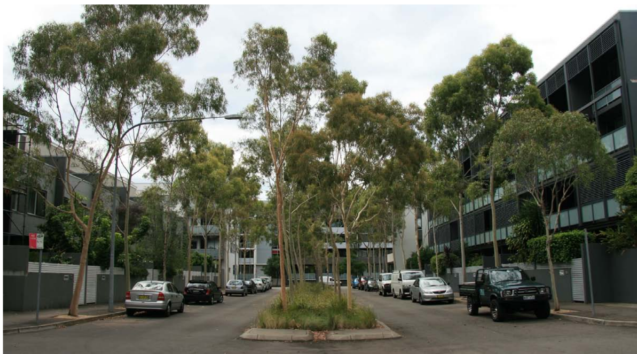
Figure 21- Where space and conditions allow, Eucalypts can provide useful street trees but they are not suitable for many locations.

Also they are highly adapted to fire and a consequence is that they often 'bolt' in growth for brief periods when post-fire soil nutrients are temporarily higher. As this bolting of growth continues in a high nutrient, fire free environment the tree may become structurally weak and the foliage and bark becomes susceptible to attack by insects and other pests.