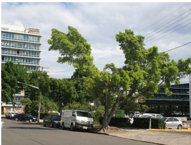
Figure 25- Pruning to facilitate overhead services can substantially impact on the form and long term health of a tree

The City of Sydney recognises the importance of acknowledging the first people of this land. As the City develops the Eora Journey project, proposed in the Sustainable Sydney 2030 Strategy, the planting of indigenous trees and plants within the public domain will be considered for the nominated sites.