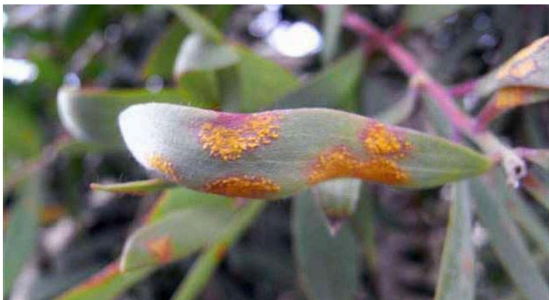
Figure 47 - Illustration of the purple discolouration and distortion of the leaves and the prominent yellow fruiting spores of the Myrtle Rust.

The following schedules list the proposed species to be used as street trees with the City of Sydney. The listing is divided into native tree species and exotic tree species and also lists deciduous trees separately to evergreen species in each of those categories. There are a total of 70 species proposed, 39 (or 55%) are native species and 31 (or 45%) are exotic species. There are a variety of small, medium and larger trees to suit individual street planting requirements.