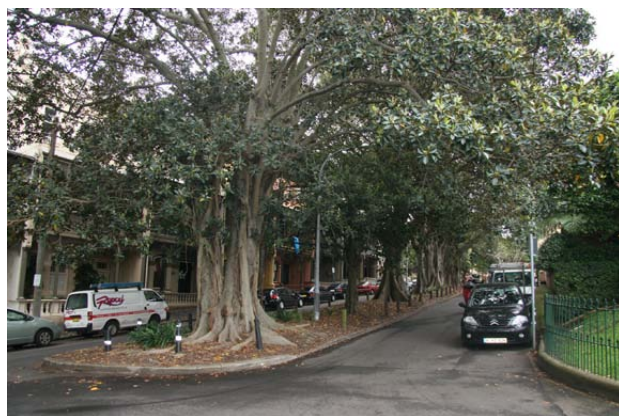
Figure 33- Historically significant planting such as the Figs in Georgina St Newtown will be retained where appropriate space is available.