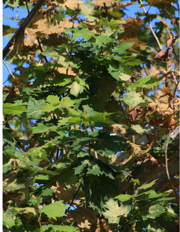
Figure 45- Sycamore Lace Bug damage to London Plane Tree illustrating the premature death of some leaves, the attempt by the tree at secondary foliage growth late in the season and the subsequent chlorosis occurring also to those new leaves as a result of the pest.