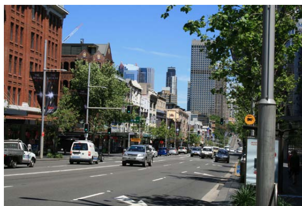
Figure 29- William Street; one of the gateways and grand boulevards created for the city with consistent Plane Tree planting.

One principle is to establish, where appropriate, fig and palm trees and other indigenous trees such as the Sydney Red Gum ( Angophora costata ) along the harbour foreshore to provide a strong edge definition and sense of place. Palm trees will be used in clusters or avenues to identify key nodes or axes.