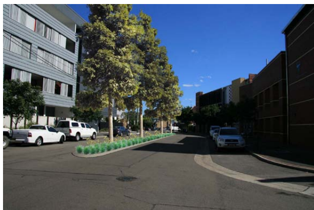
Figure 36- An artists impression of potential median planting in Garden Street, Eveleigh