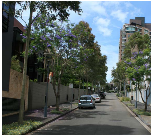
Figure 42- Cadigal St, Pyrmont - Some select streets can accommodate both higher level native trees such as Spotted Gum and under planting of feature trees such as Jacarandas

The Draft Sydney DCP 2010 identifies the location of new streets and lanes throughout the Local Government Area. New streets are identified in the urban renewal areas, including Green Square, Rosebery, Harold Park, Ashmore Estate and the Southern Industrial Area.