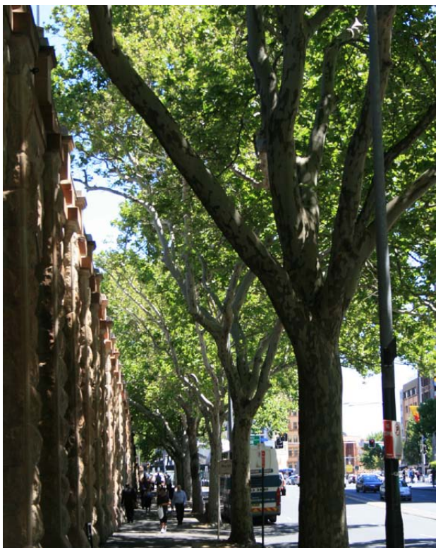
Figure 22- Great streets are often defined by equally great trees.

In summary both natives and exotics have their strengths and weaknesses for use as street trees. The Street Tree Master Plan will aim to plant the right tree for the right location, for the right reason and strike an appropriate balance.