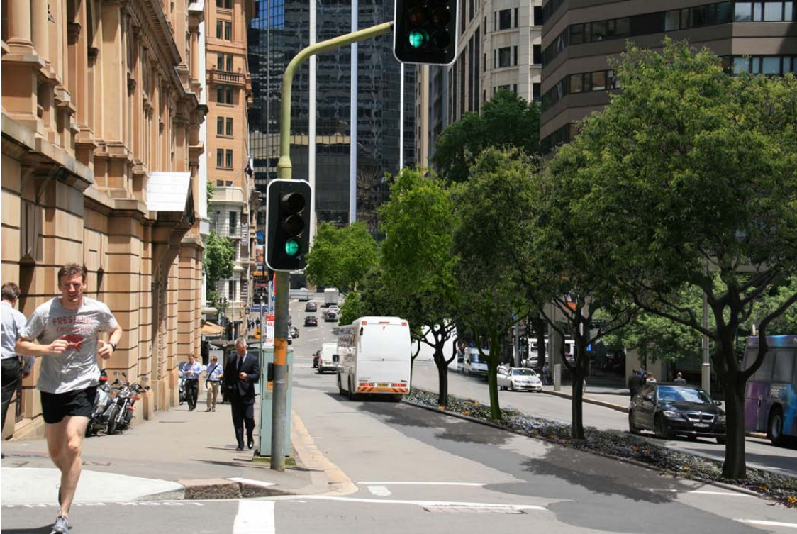
Figure 38- An artists impression of potential median planting in Bridge Street in the CBD