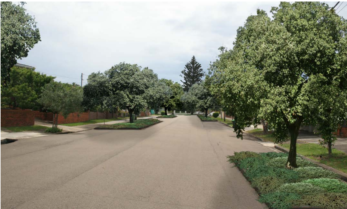
Figure 41- An artists impression of potential blister style planting in Ripon Way, Rosebery