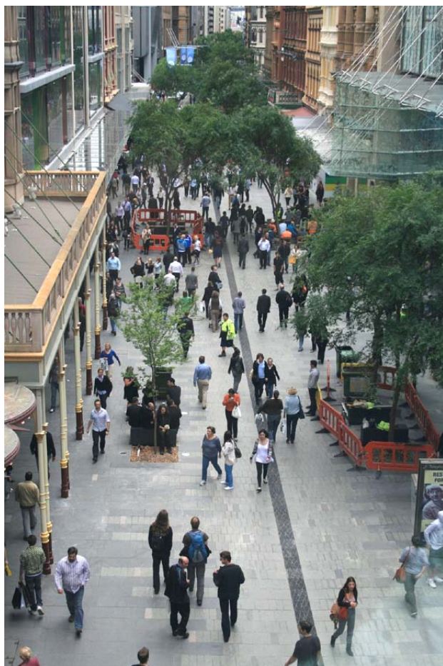
Figure 23 - Pitt Street Mall - Tree selection needs to consider many competing interests and factors such as supply, tree form, ultimate size, deciduous or evergreen

All trees selected will require minimal maintenance subsequent to establishment.