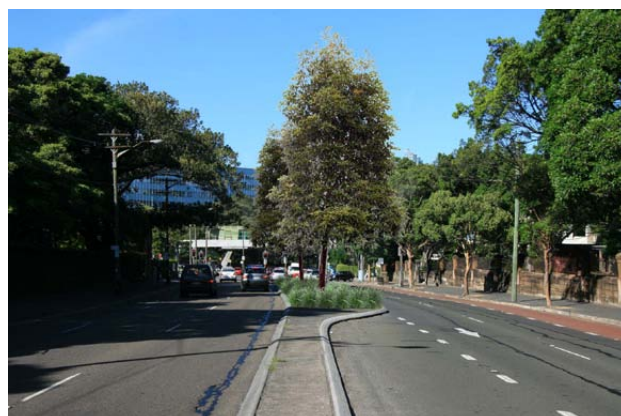
Figure 35- An artists impression of potential median planting in City Road, Darlington