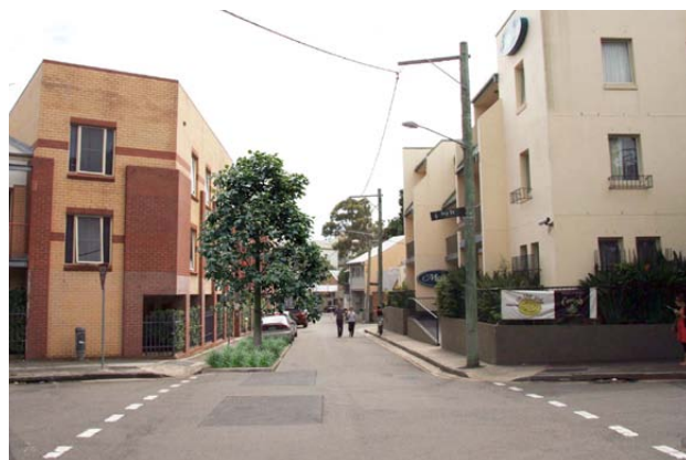
Figure 37- An artists impression of potential blister style planting in Boundary Street, Darlington