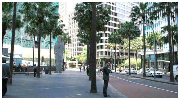
Figure 28- Precinct based planting such as the palms of Phillip Street in the CBD.

Also an important consideration is the site preparation and establishment techniques used for tree planting. The use of nature strips, median planting, and in-road blisters where possible, maximising the size of the planting 'cut outs' in pavements and the use of flexible pavements will help minimise future instances of pavement damage and associated risk management issues.