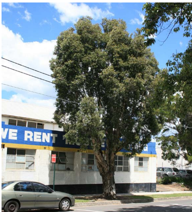
Figure 26- Aerial Bundled Cable can reduce the need for pruning allowing healthy trees with typical forms to be maintained.

Where site constraints limit the optimum size of street plantings, consideration may be given to mechanisms which minimise or remove the impact of these constraints. These could include for example, replacing overhead powerlines with Aerial Bundle Conductors, planting trees within the median or road carriageway (where footpaths are narrow and streets are sufficiently wide) and increasing the root zone soil volume by use of structural soils or similar technologies.