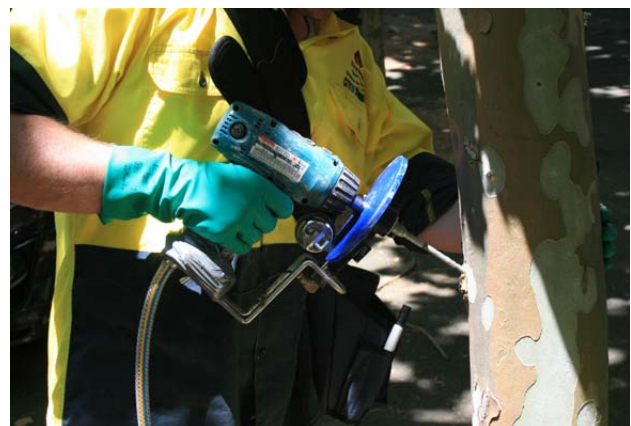
Figure 46- Tree injections with insecticide is costly and time consuming but trials currently underway by the City may prove useful in limited areas to help control the impact of the pest.