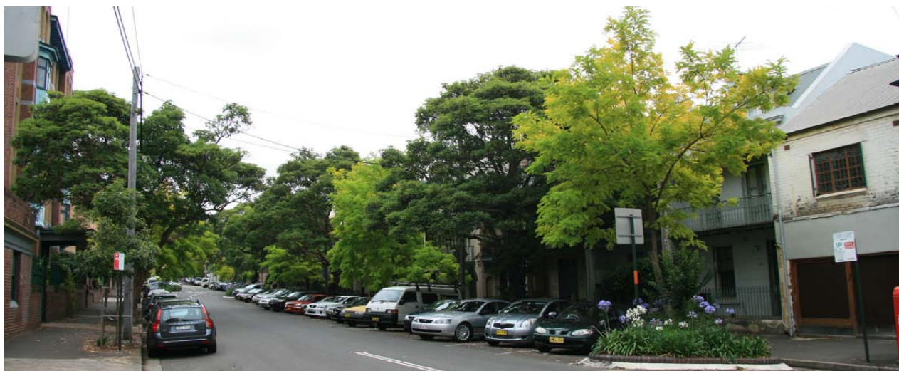
Figure 43- Forbes Street, Darlinghurst illustrating a good use of mixed avenue planting - offering good visual interest and a pleasing mix of native and evergreen trees and exotic and deciduous trees.

These Urban Renewal Areas have been shown in the relevant precincts within this plan. The species will be determined following further information of the renewal which may impact species selection, such as building heights / configuration, soil conditions, underground constraints etc. Their selection will be based upon the palette of trees nominated within the relevant precinct area, or those immediately surrounding.