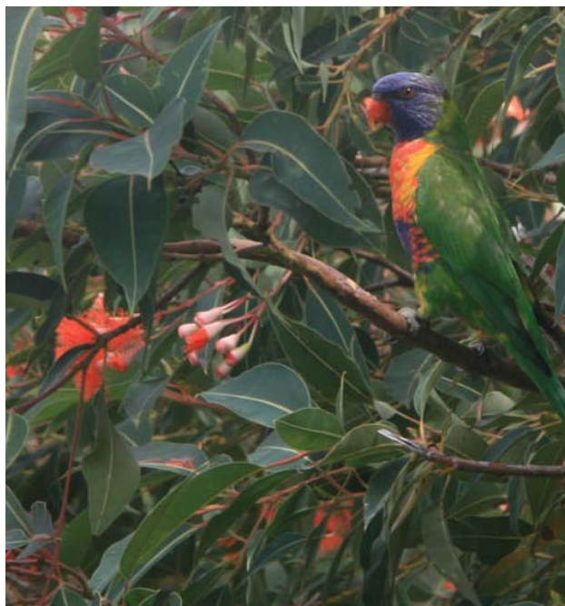
Figure 20 - Combinations of exotic and native trees can provide interest and variety to the streetscape and habitat for our native wildlife.

There is much debate about the use of locally indigenous species, that is, species that originally grew within the area. Whilst locally indigenous species may be the most appropriate for local environmental conditions, the growing conditions within the urban environment are often now very different, particularly in a street situation. Disturbed soil profiles, compaction, higher nutrient status, altered drainage patterns and paved surfaces are just a few of the problems with which urban trees must contend.