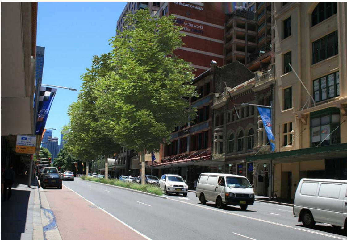
Figure 39- An artists impression of potential median planting in Elizabeth Street in the CBD (Source: Arterra Design)