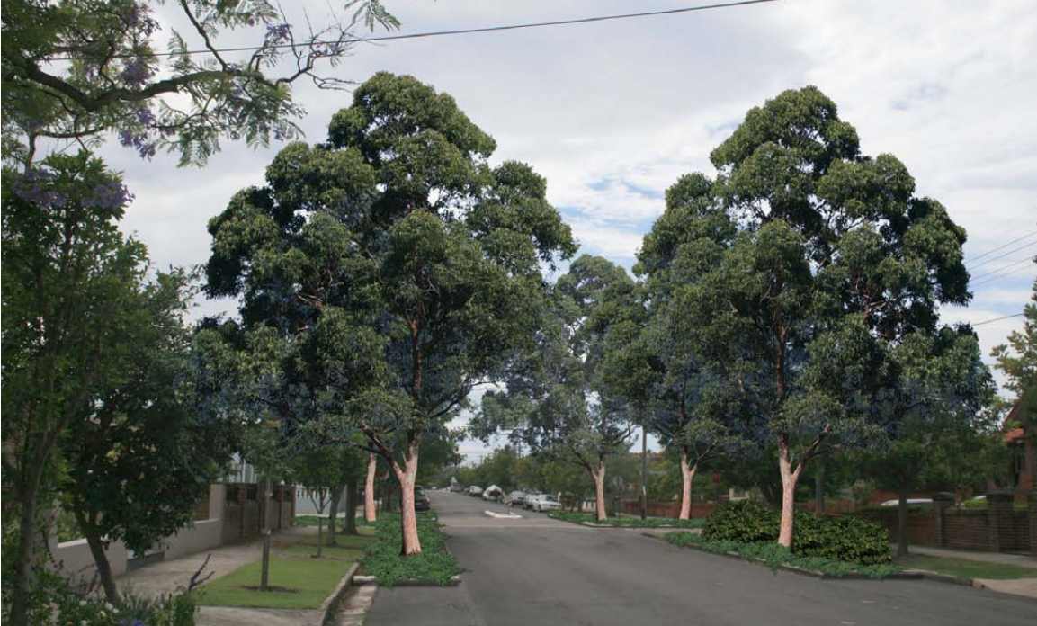
Figure 40- An artists impression of potential intersection blister planting in Tweedmouth Ave, Rosebery with Smooth-barked Apple that will give shade and create a unique identity for the suburb.