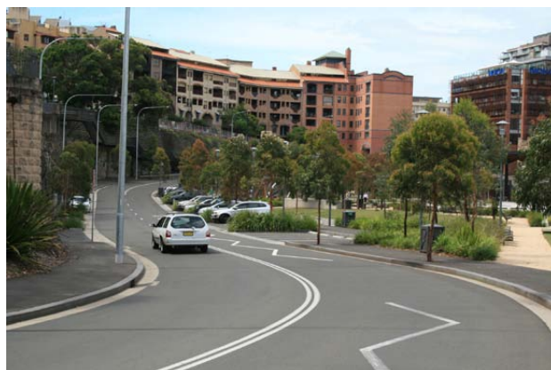
Figure 32- The locally indigenous Smooth-barked Apple ( Angophora costata ) is proposed to supplement the harbour side Fig planting and provide biodiversity and habitat values