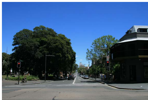
Figure 60- Redfern Park provides significant amenity to the surrounding area.