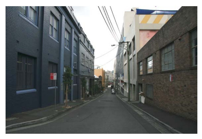
Figure 69- Streets around Broadway are often shaded by surrounding buildings and have narrow footways.