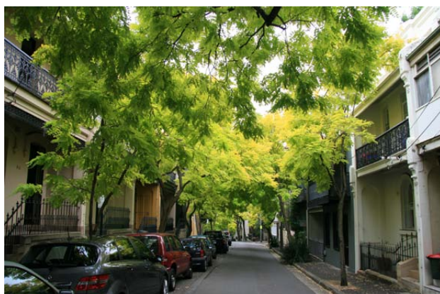
Figure 71- Several streets with Golden Robinias create a very unique character.