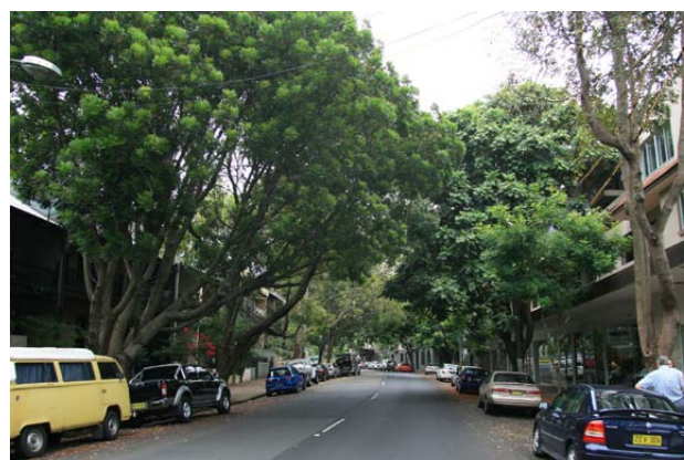
Figure 72- Boundary Street is a mix of mature established rainforest species.