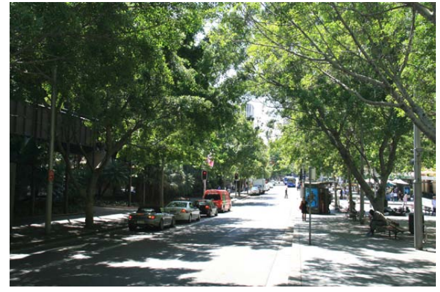
Figure 51- Ficus hillii on Alfred street provide great amenity.