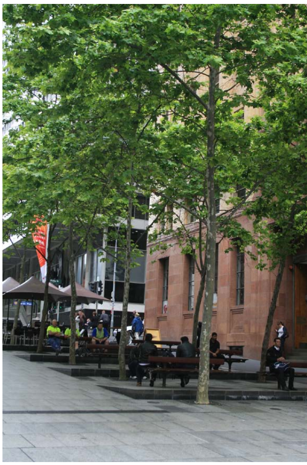
Figure 54- Plane trees in Martin Place.