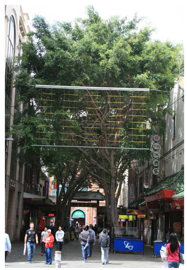
Figure 56- Ficus benjamina on Dixon street contribute significantly to the quality of the surrounding public domain.