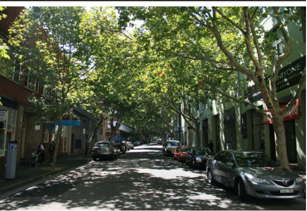
Figure 58- Mixed residential and commercial streets.