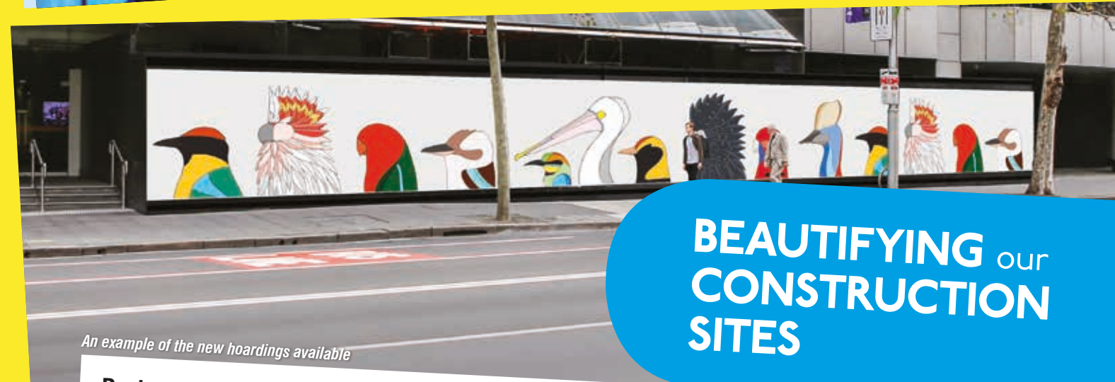
An example of the new hoardings available

We will continue to advocate for a strong and successful live music and performance sector as a member of the NSW Government's night time economy taskforce.