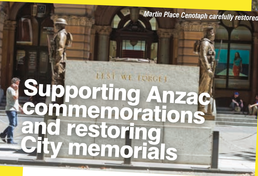
Martin Place Cenotaph carefully restored

It's time for the new Premier to hit pause on the destructive WestConnex toll-road – on track to be one of the most wasteful and expensive road projects ever undertaken anywhere in the world – before it becomes an ongoing nightmare affecting city health, wellbeing and living environment.