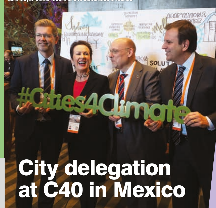
Lord Mayor Clover Moore at C40 conference in Mexico

Riding to work also makes economic sense. More people commuting by bike means less congestion on our roads, keeping the city moving for couriers, buses and business deliveries.