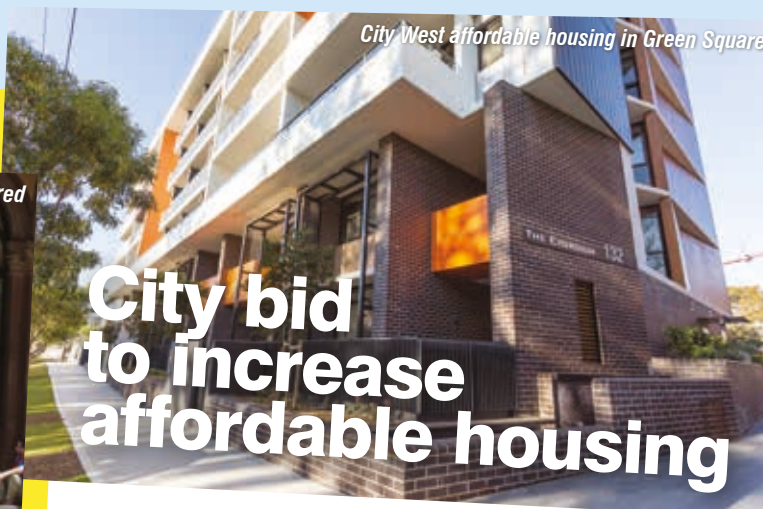
City West affordable housing in Green Square

That is all in addition to the $3.1 million we spent restoring the pool of reflection in Hyde Park ahead of the Centenary, the $173,000 we invested on restoration work on other war memorials and the $500,000 commemoration artwork, "Yininmadyemi", installed in Hyde Park as a tribute to Aboriginal and Torres Strait Islander servicemen and women.