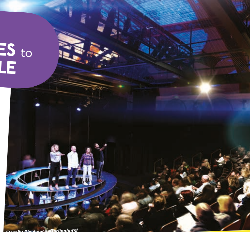
Eternity Playhouse, Darlinghurst

The digital theatre passport scheme was one of the great ideas from the City's cultural policy, aimed at helping young audiences develop a taste for Sydney's diverse cultural life.