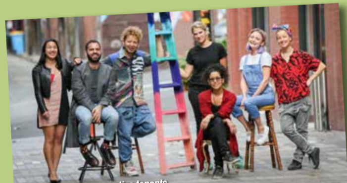
Foley Street's new creative tenants