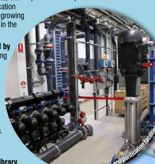
Water recycling and purification facilities