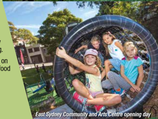
East Sydney Community and Arts Centre opening day