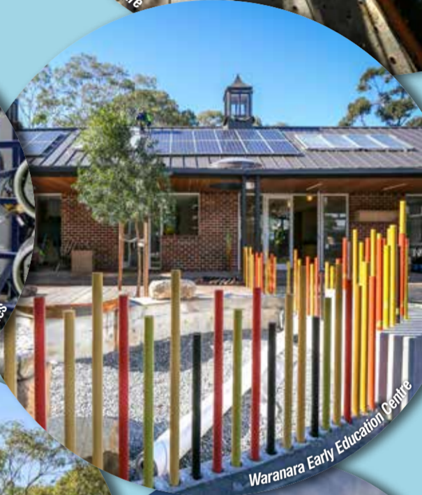
Waranara Early Education Centre