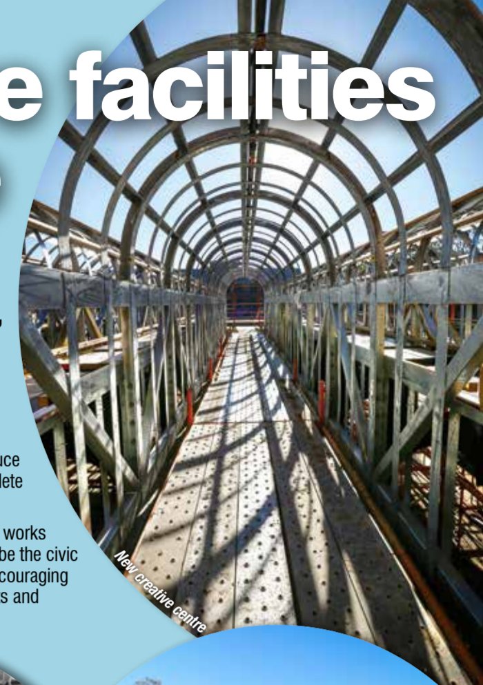
New creative centre

Construction of the Gunyama Park Aquatic and Recreation Centre will start in 2018 and is expected to be finished in late 2019.