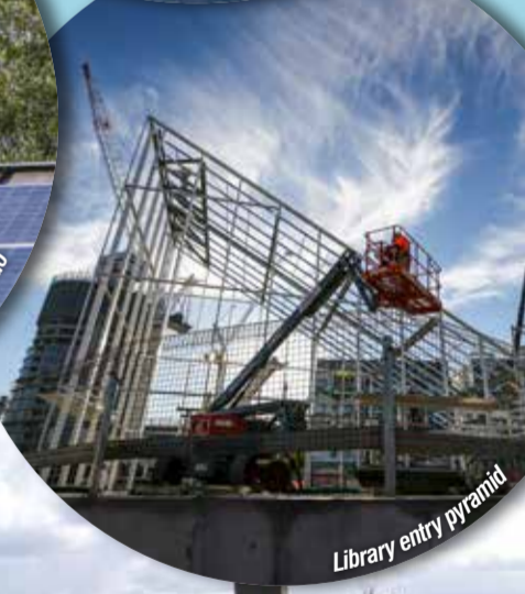
Library entry pyramid