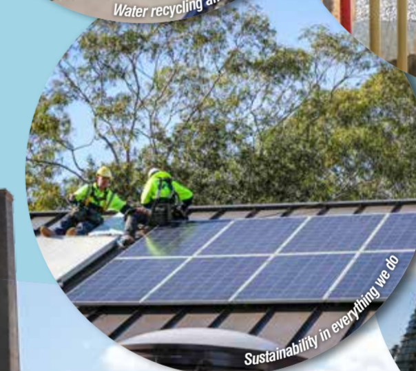
Sustainability in everything we do