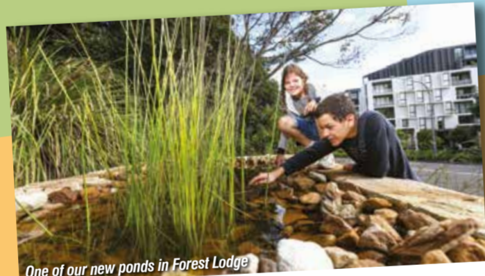
One of our new ponds in Forest Lodge

We're pleased to welcome this new round of artists and creative workers into the program and we look forward to the distinctive contribution that they will make to Foley Street and Oxford Street.