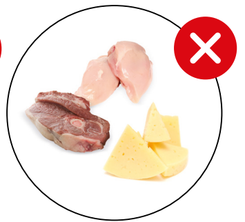
Meat or dairy products