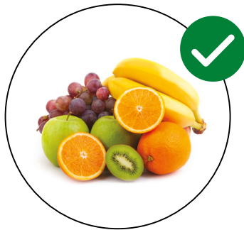
Organic fruit (no pesticides)