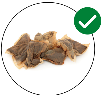
Tea bags (remove string and staple)