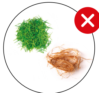
Fresh grass clippings and raw sawdust