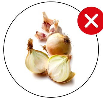
Onions and garlic