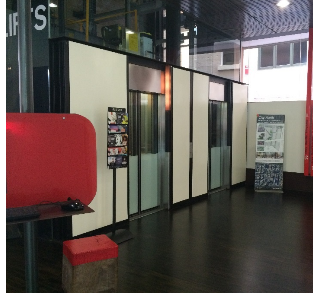
Customs House includes stairs to level 1 and 2.

From the main pedestrian entrance, travel straight ahead to the far end of atrium, turn right and the stairs are straight ahead. The stairs include handrails on both sides, tactile ground surface indicators, and nosings (non-slip edges). The stairs are 1520mm wide.