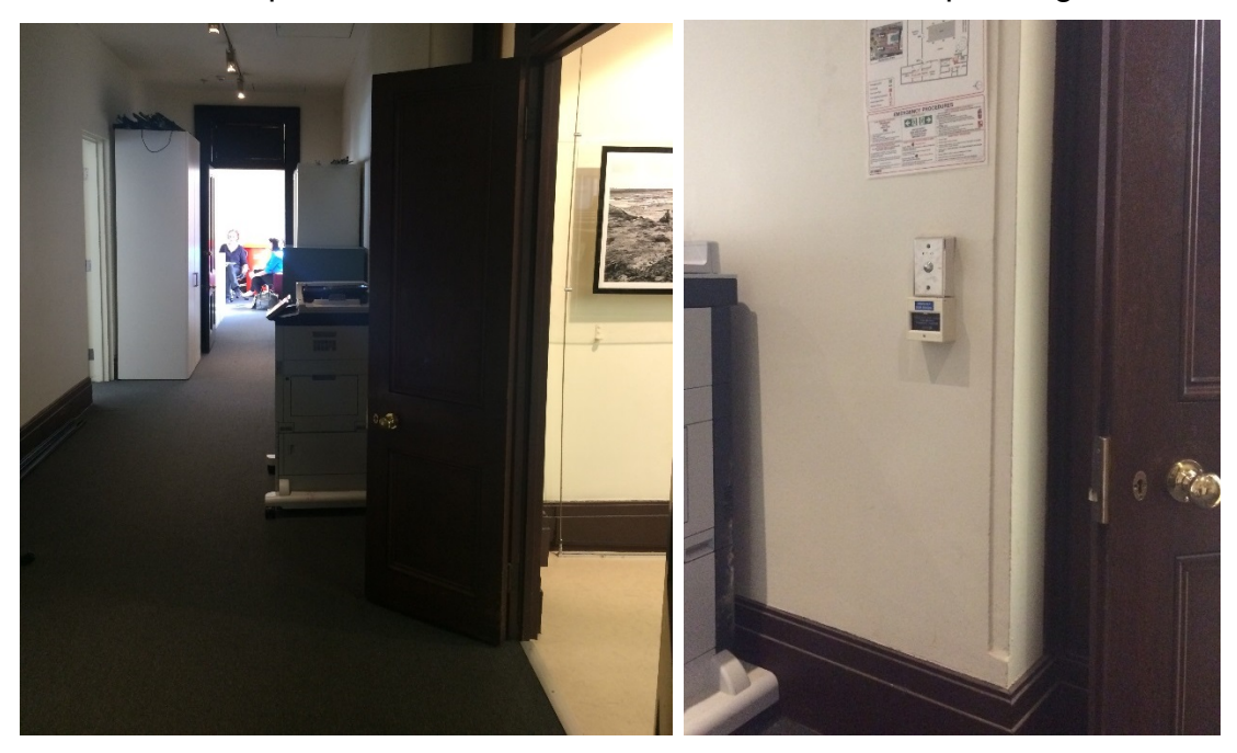
Once through first doors, turn right and travel down the hallway, the hallway is 1300mm wide. Entrance to small meeting room is on the left. Door to small

First doorway towards small meeting room is double wooden swinging doors. Doors are controlled by swipe access from library staff. Single door opens to 550mm wide, and double doors open to 1140mm wide. Push to open. There is a small lip at doorway where floor transitions from linoleum to carpet. Doors remain open for the duration of the hire period. If doors are closed, exit is via button on silver panel to the left of double doors, 1090mm up from ground.