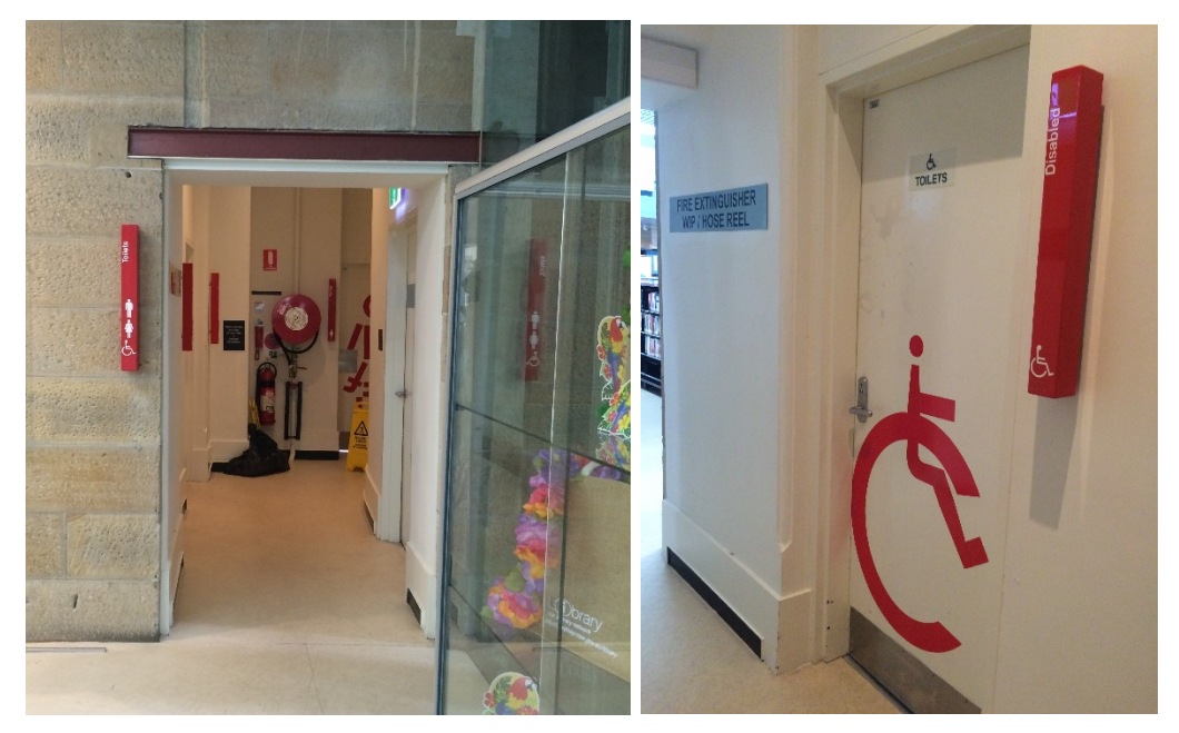
There are no ambulant toilets at Customs House