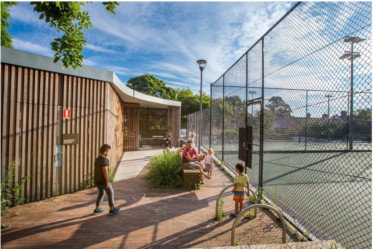
Figure 1. St James Park Tennis Courts, Glebe – Photo by Katherine Griffiths / City of Sydney