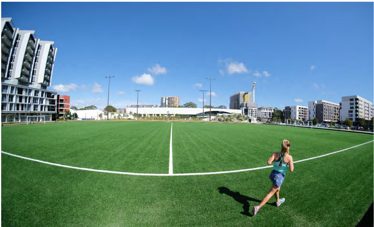
Figure 1. Gunyama Park, Zetland synthetic playing field