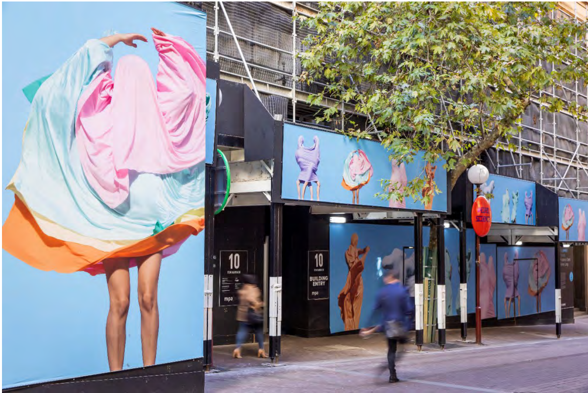
Image: 2018-22 Site Works artwork Suspended Figures by Prue Stent and Honey Long.

Hoardings are made of panels put side-by-side to form a protective wall. While many hoardings are a standard 2.4m high, their lengths vary. To allow for this we've created the Hoarding Artwork Template and Submission Guide . The template is a grid-based, flexible and modular system of different panel sizes. It allows for panels to be placed end-to-end in various lengths and combinations to suit different hoarding dimensions.