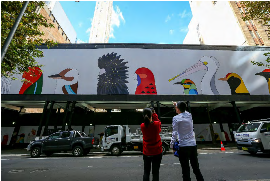
Image: 2017/18 Site Works Artwork Birds of Australia by Egg Picnic.

The City plans to select and licence up to 10 artworks.