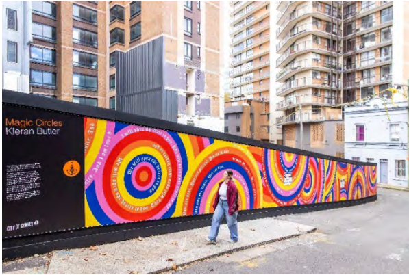
Image: Type A hoarding 2018-22 Site Works artwork Magic Circles by Kieran Butler.

A hoarding is a temporary protective structure that wraps and protects a construction site. They come in various dimensions. Two of the most common hoardings are known as a Type A Hoarding and a Type B Hoarding .