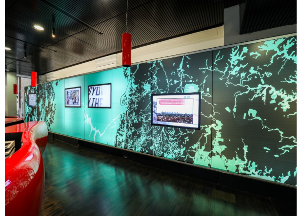
Exhibition: Customs House historical display (media wall) Exhibition: Cartographica, Sydney on the Map (media wall)