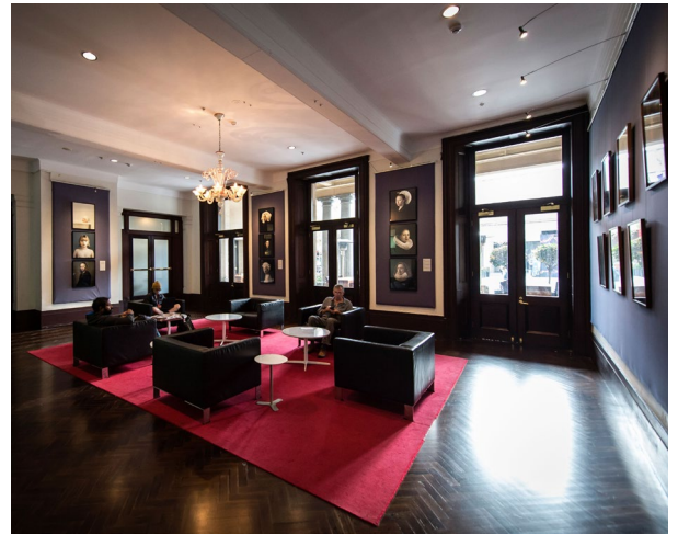
Exhibition: Dutch Masters of Light [Left] Media wall [Right] In the Red Room framed photographs were displayed in front of plain coloured fabric panels.