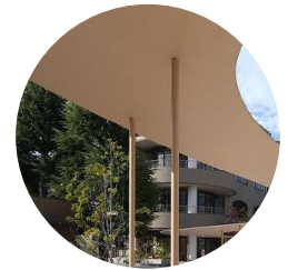
Fine steel columns at entry