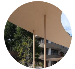
Fine steel columns at entry