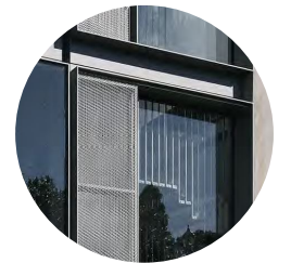
Steel framed windows