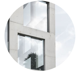
Glass window to street