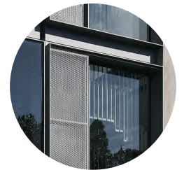
Steel framed windows