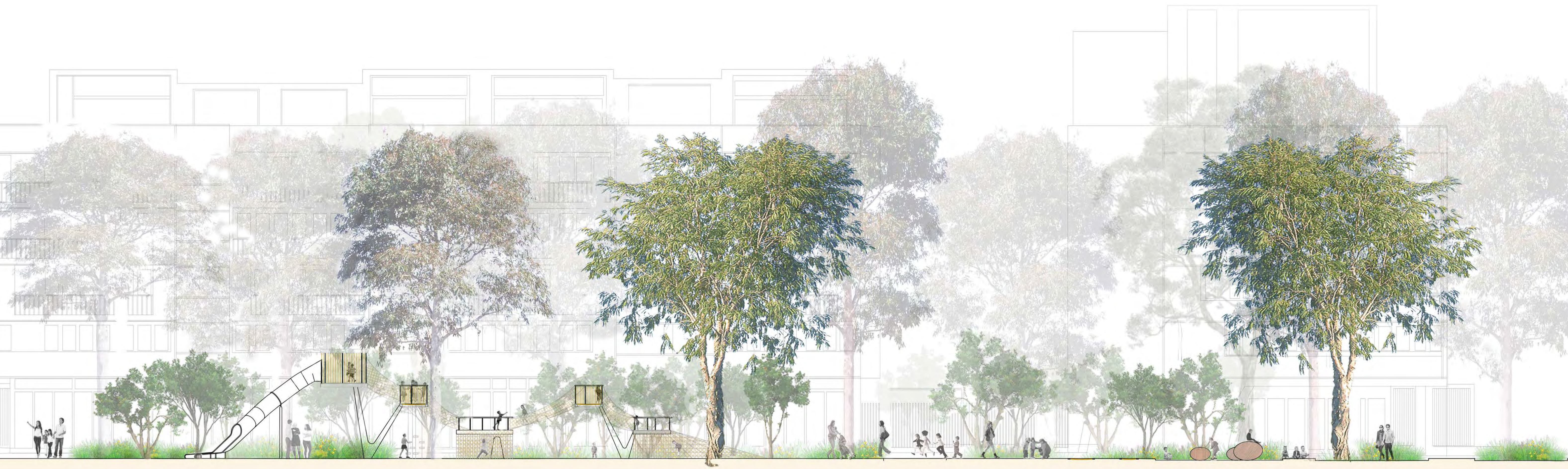
Gum Nest Play Zone: A play area for older children zone incorporating a custom play structure with rope bridges, platforms, nets and a slide.