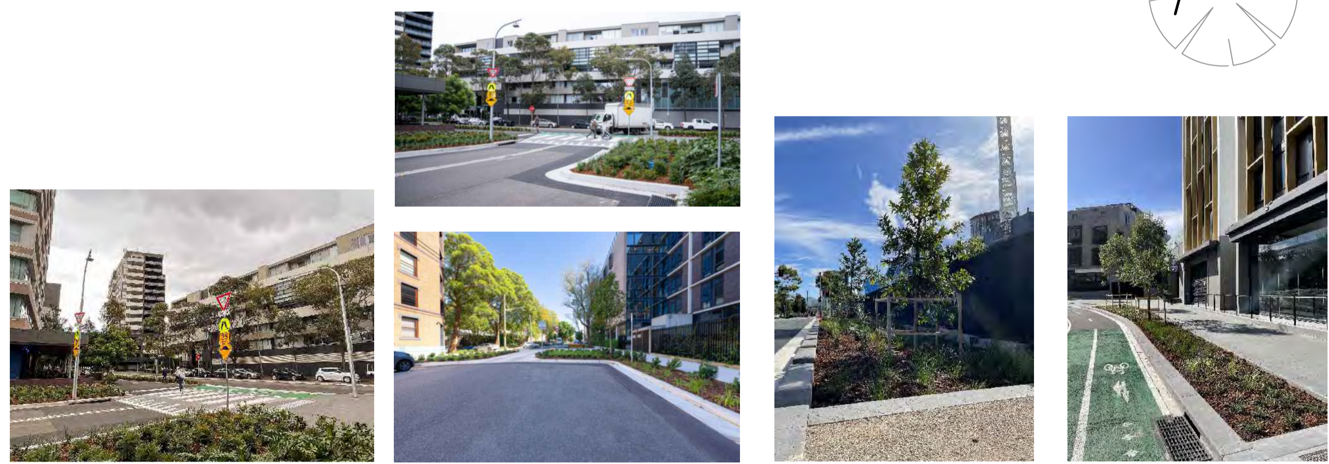
NOTE: IMAGES INDICATIVE ONLY