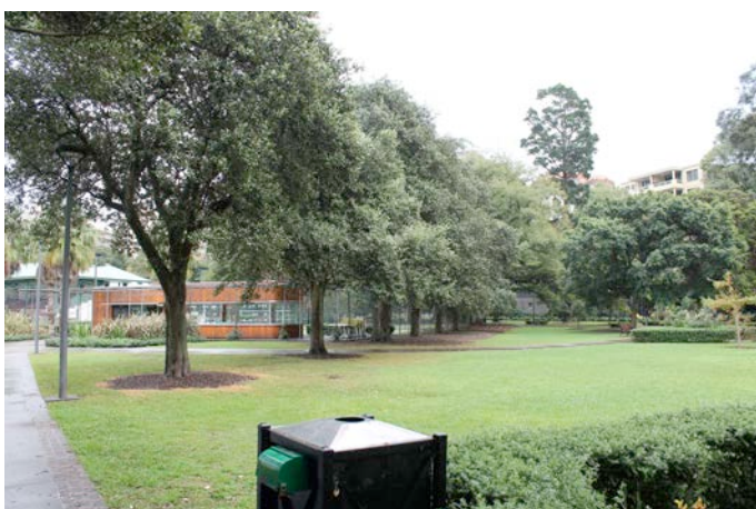
Figure 3.7 Rushcutters Bay Park View to path at the kiosk