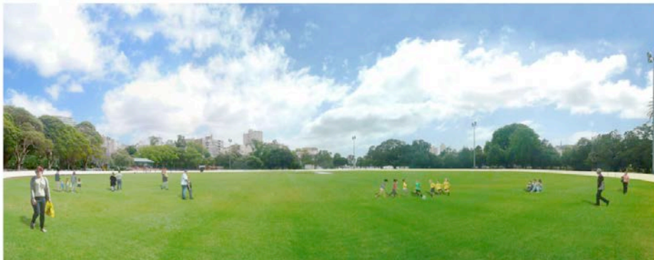
Proposed oval layout and lighting

The new oval lights are taller than the existing (20 metres) and are sectioned to allow them to be lowered for replacement of globes. The path lights are to the standard detail used in the Park.