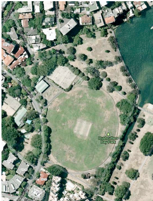
Figure 1.1 The Study Area

The study area is the Reg Bartley Oval and the Rushcutters Bay Park at Rushcutters Bay, NSW being Lots 1 and 2 in DP 554114 (Figure 1.1).