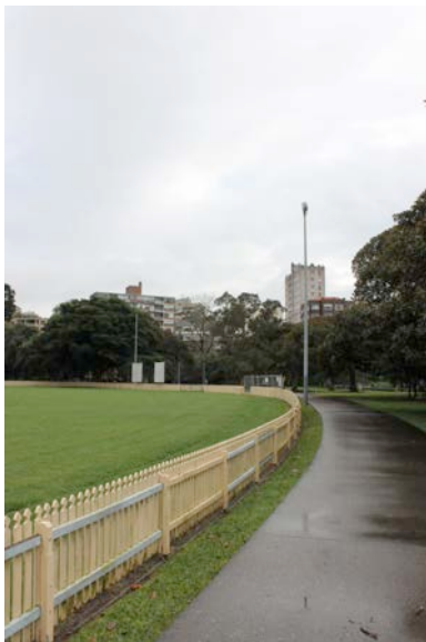
Figure 3.3 Rushcutters Bay Park Canal path and oval lights