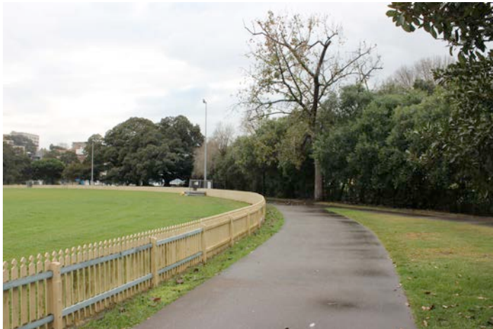
Figure 3.2 Rushcutters Bay Park Canal path looking north – currently no lighting