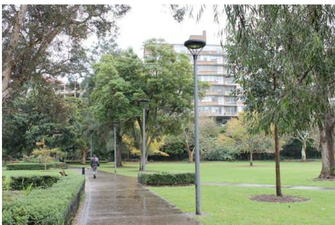
Figure 3.6 Rushcutters Bay Park Main path and standard light poles