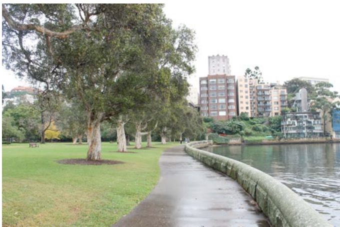
Figure 3.5 Rushcutters Bay Park Foreshore path – currently no lighting