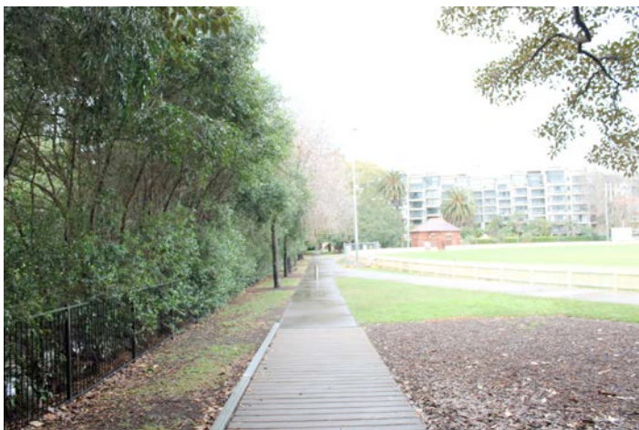
Figure 3.4 Rushcutters Bay Park Canal path looking south