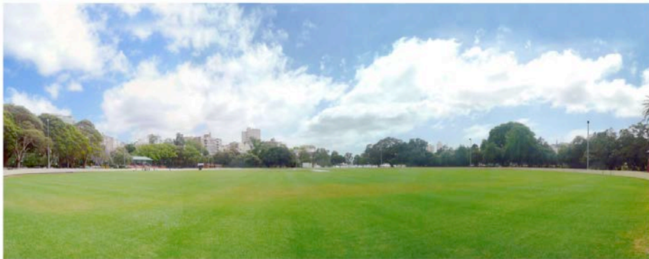
Existing oval layout and lighting

The proposal for the oval lights is shown below: