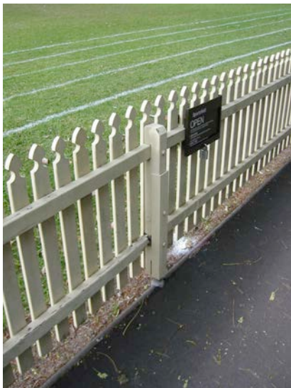
Figure 3.8 Reg Bartley Oval, Rushcutters Bay Typical fixing detail of the timber posts on steel stanchions