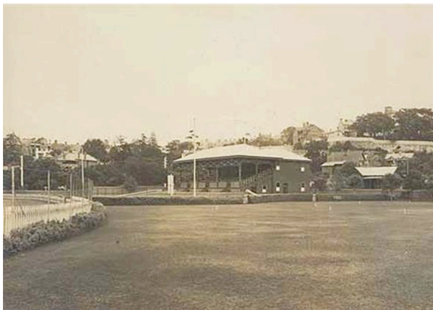
Figure 2.2 View to the grandstand in 1910 from the croquet lawns