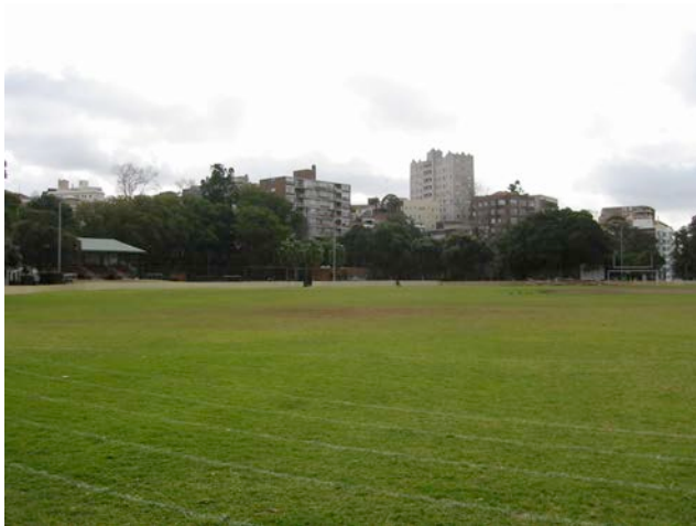
Figure 3.2 Reg Bartley Oval, Rushcutters Bay View looking north west