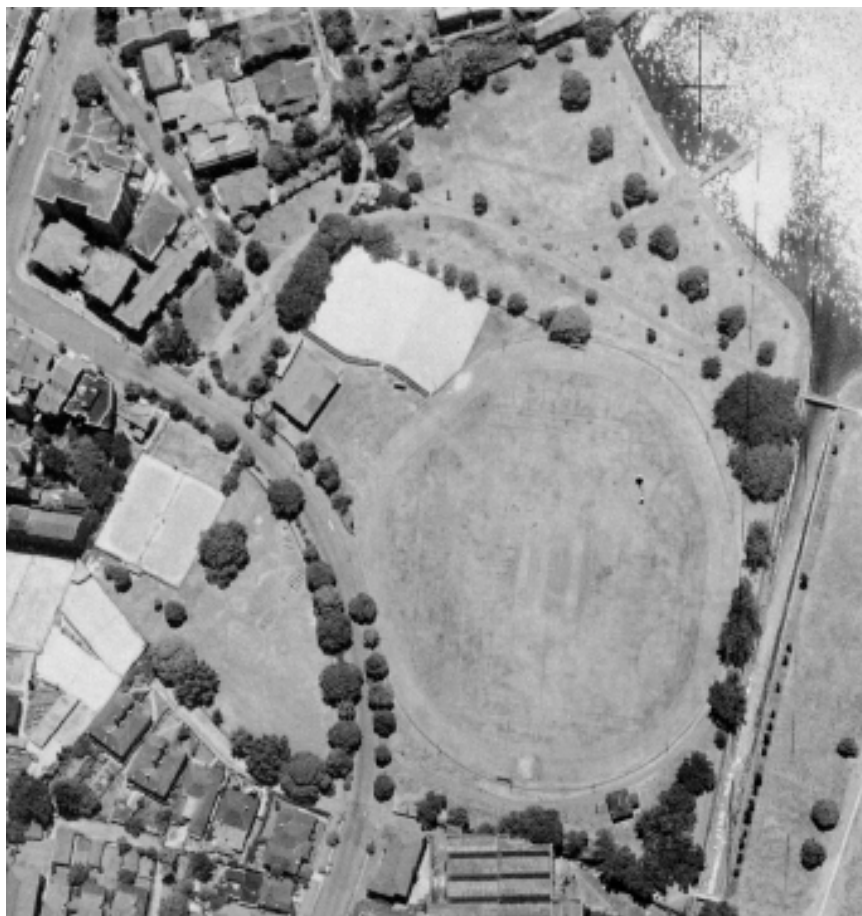
Figure 2.1 Aerial view to the oval in 1949