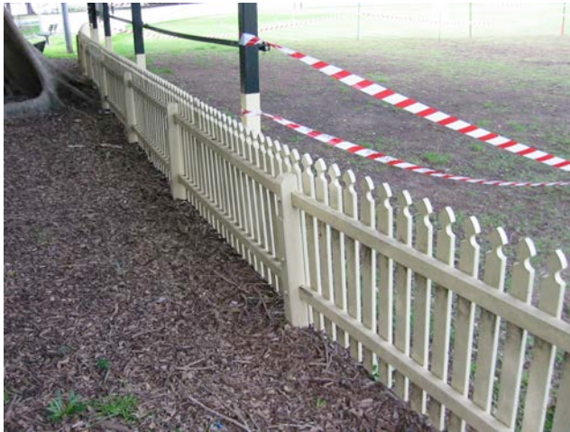
Figure 3.7 Reg Bartley Oval, Rushcutters Bay Picket detail showing a lean to the fence post