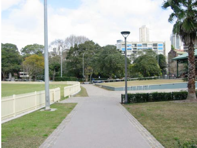
Figure 3.10 Reg Bartley Oval, Rushcutters Bay View to the path to the front of the grandstand