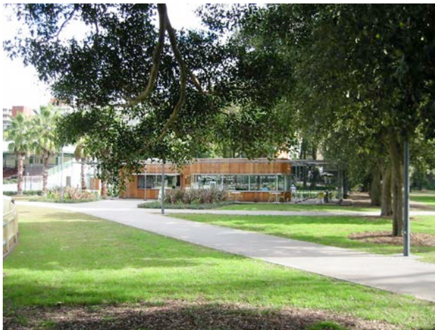
Figure 3.11 Reg Bartley Oval, Rushcutters Bay Café and tennis office