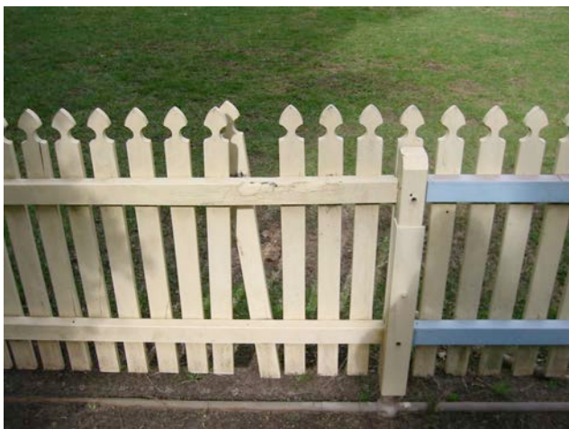
Figure 3.6 Reg Bartley Oval, Rushcutters Bay

Junction of new and current pickets. The new pickets are on the left. The larger timber posts mark gates