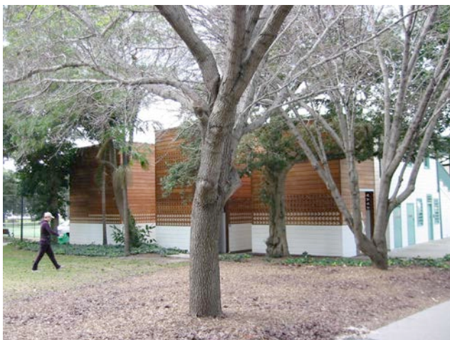
Figure 3.12 Reg Bartley Oval, Rushcutters Bay New amenities blocks at the rear of the grandstand