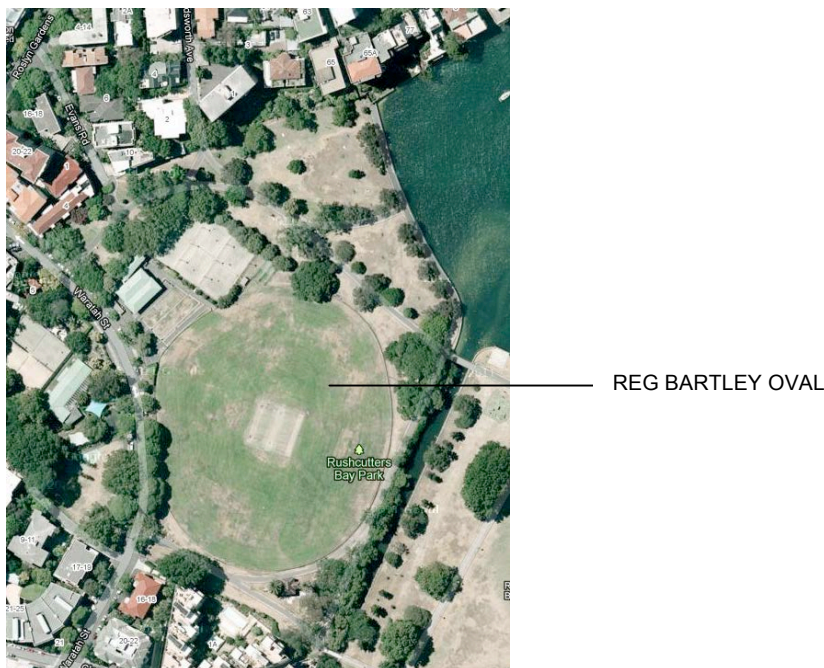
Figure 1.1 The Study Area

The study area is the Reg Bartley Oval and the Rushcutters Bay Park at Rushcutters Bay, NSW being Lots 1 and 2 in DP 554114 (Figure 1.1).