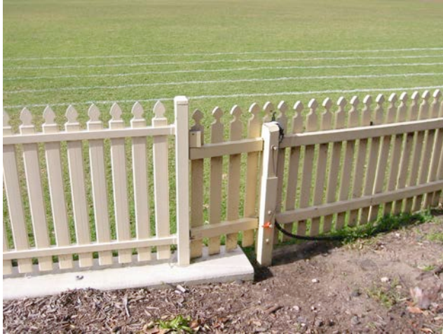
Figure 3.4 Reg Bartley Oval, Rushcutters Bay

Junction of new and current pickets. The new pickets are on the right