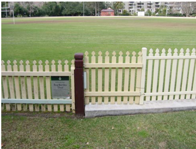
Figure 3.5 Reg Bartley Oval, Rushcutters Bay

Junction of new and current pickets. The new pickets are on the right