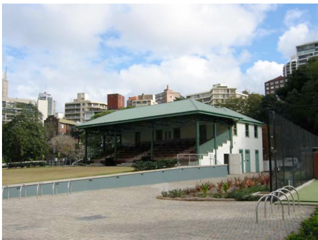
Figure 3.9 Reg Bartley Oval, Rushcutters Bay Grandstand