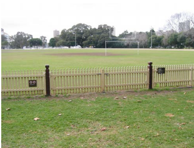
Figure 3.3 Reg Bartley Oval, Rushcutters Bay Gate detail