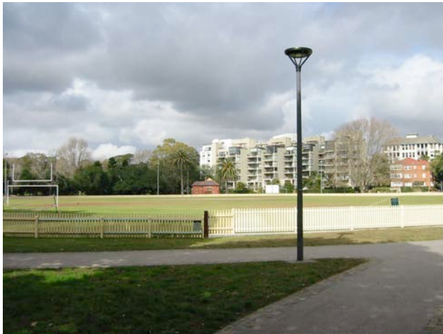
Figure 3.1 Reg Bartley Oval, Rushcutters Bay View looking east