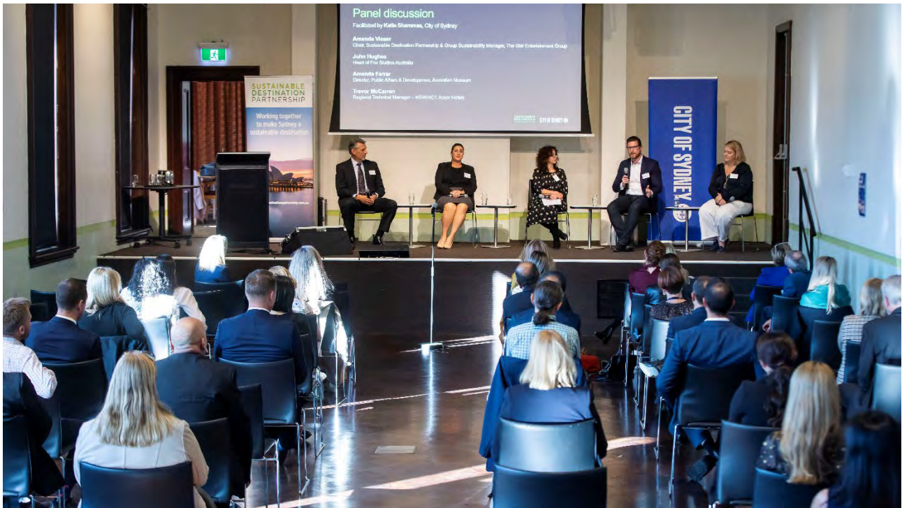
Figure 2. Barnet Long Room, Customs House at Circular Quay – Photo by Anna Kucera / City of Sydney