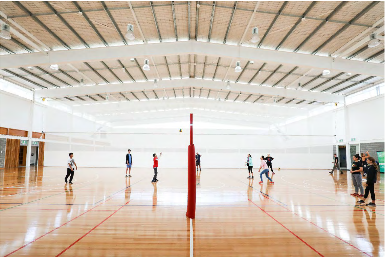
Figure 2. Indoor play at Perry Park Recreation Centre, Alexandria