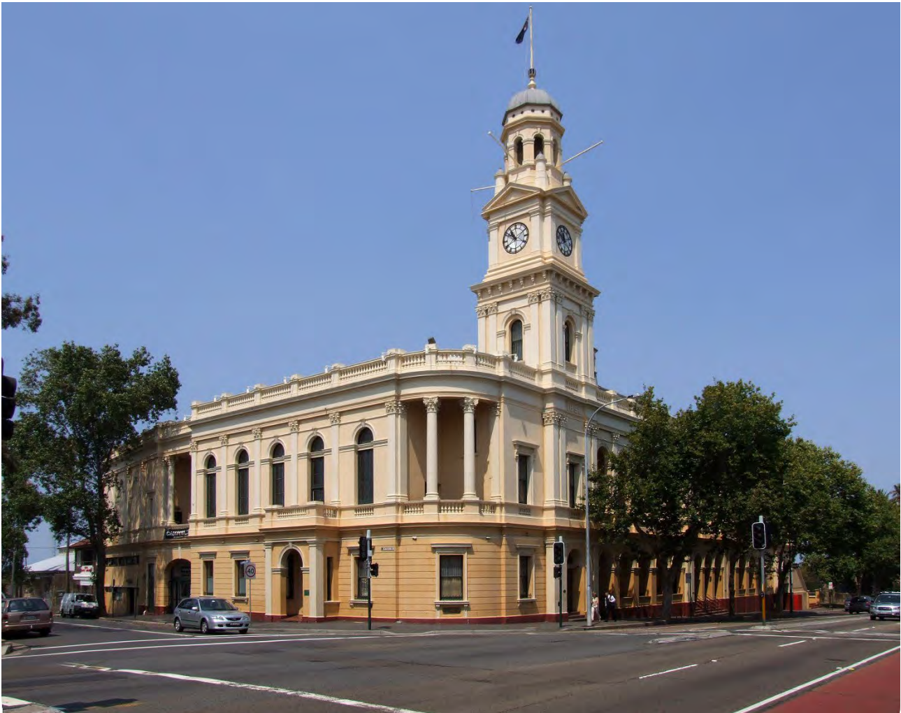
Figure 4. Paddington Town Hall, Paddington