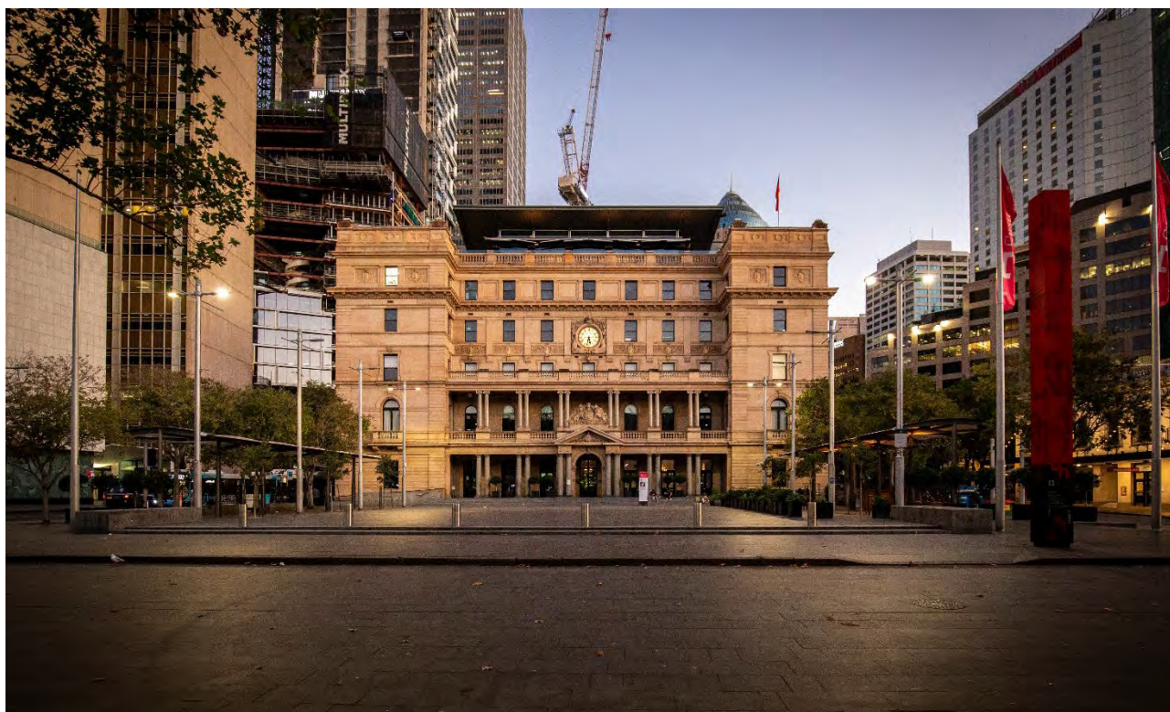
Figure 3. Customs House, Circular Quay

1 Hourly rate is the rate charged per hour, over and above the total minimum venue hire charge. These venues are not hired on an individual hourly rate, so the hourly rate only applies where the duration of the booking exceeds the total minimum hours per day.