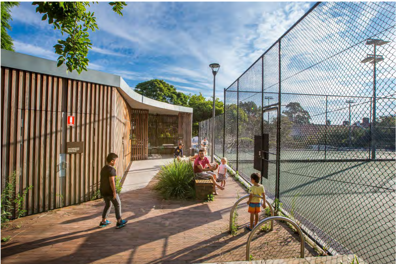
Figure 1. St James Park Tennis Courts, Glebe