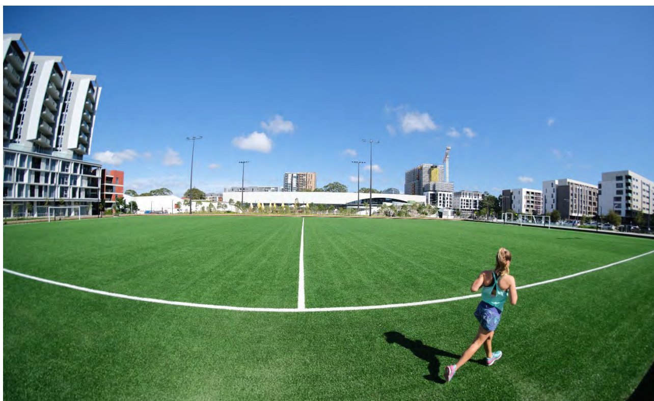
Figure 1. Gunyama Park, Zetland synthetic playing field