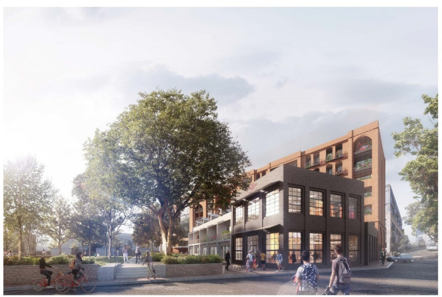
Artist impression of preliminary concept from Wentworth Street