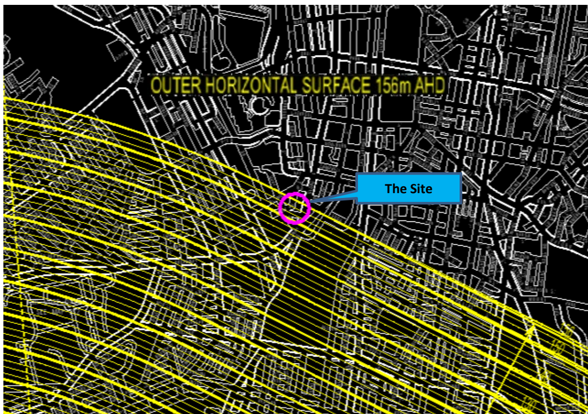
Figure 1: Extract from draft OLS Chart