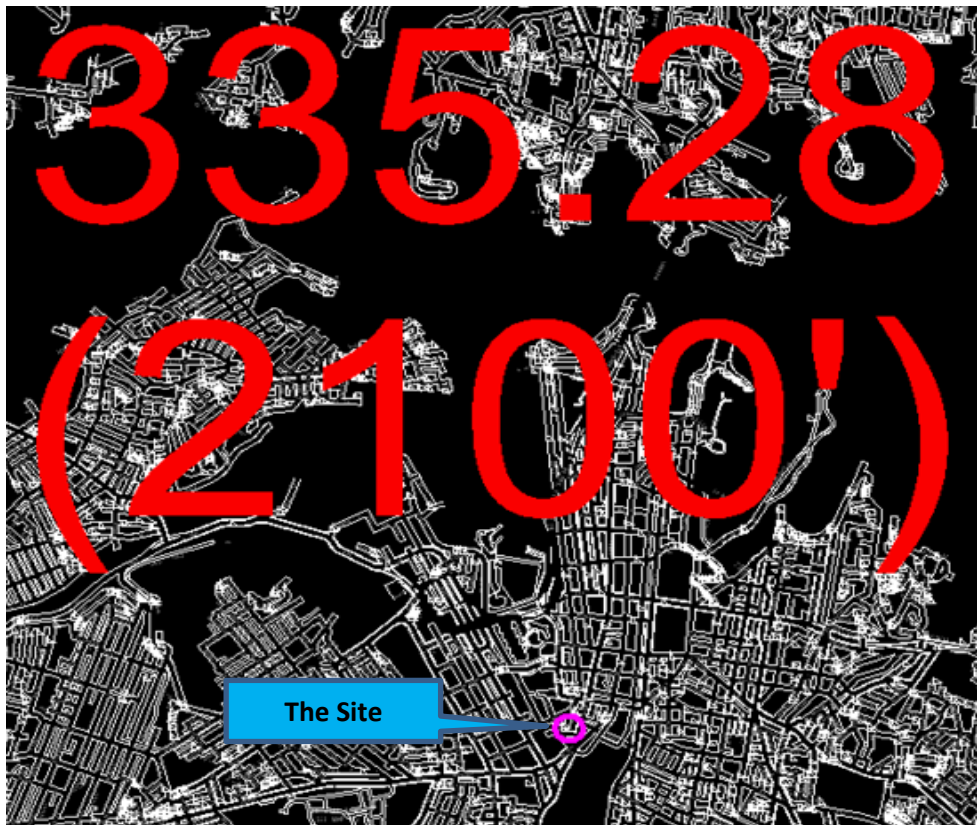
Figure 3: Extract from draft RTCC (2019)

(Note: the reference to 2100ft is the lowest altitude ATC can vector aircraft whilst maintaining 1000ft vertical separation from obstacles)