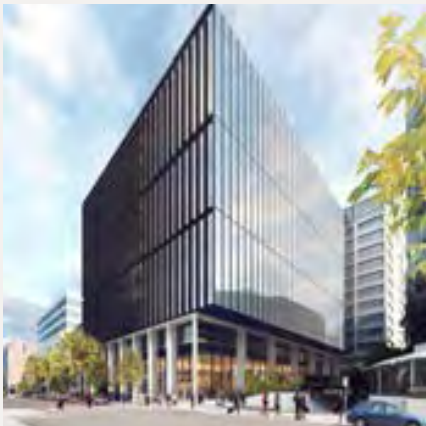
105 PHILLIP ST, PARRAMATTA, NSW