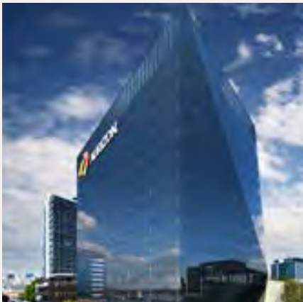
900 ANN ST, BRISBANE, QLD