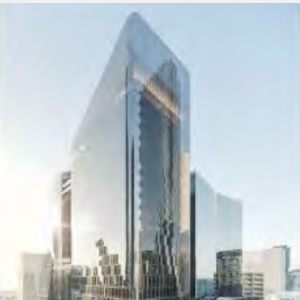
555 COLLINS STREET, MELBOURNE, VIC