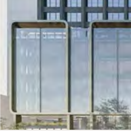
150 LONSDALE ST, MELBOURNE, VIC