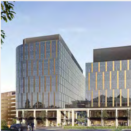
IQ WESTMEAD, NSW