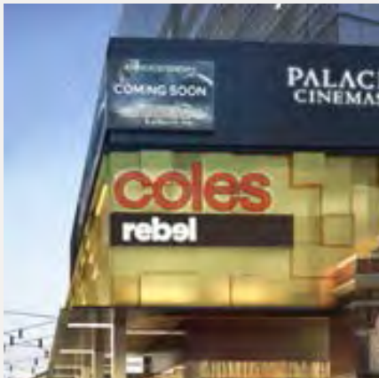
RAINE SQUARE, PERTH, WA