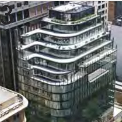
333 GEORGE STREET, SYDNEY