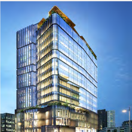
11BCR, NEWSTEAD, QLD