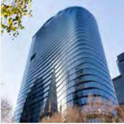
130 LONSDALE ST, MELBOURNE, VIC