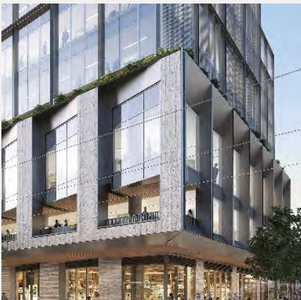
480 SWAN ST, RICHMOND, VIC