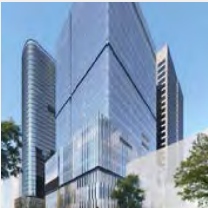
140 LONSDALE ST, MELBOURNE, VIC