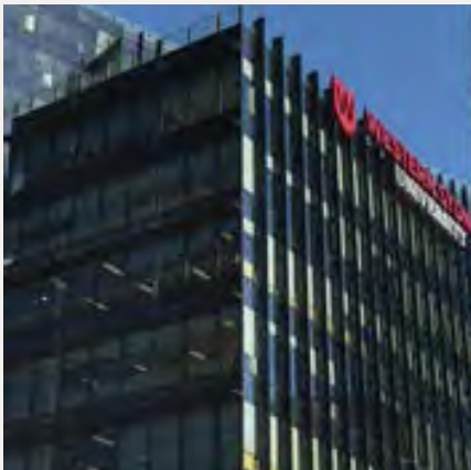
1PSQ, WSU, PARRAMATTA, NSW