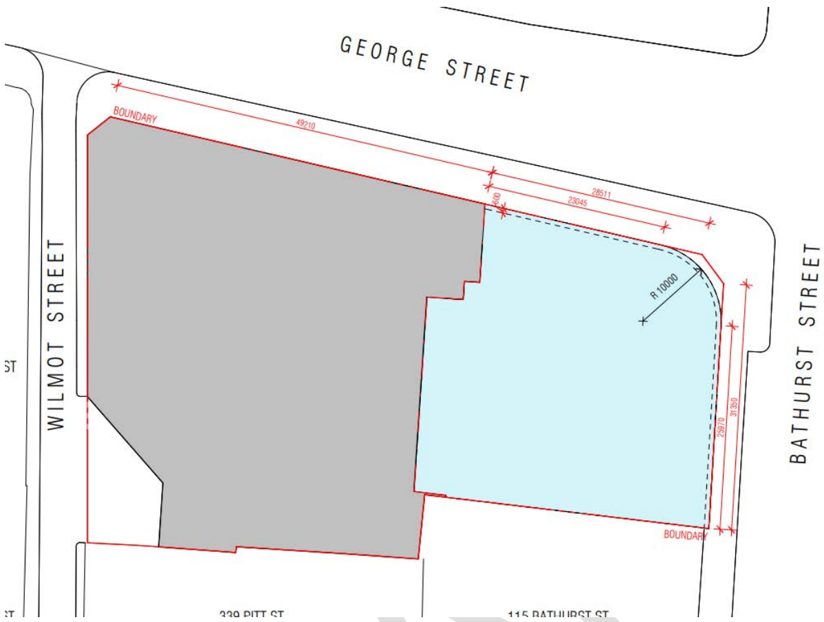
Figure 1 Ground floor envelope setback plan