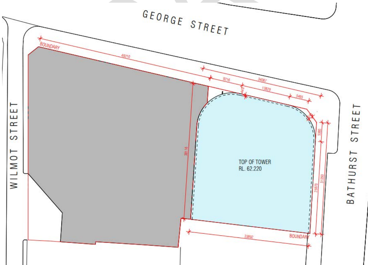
Figure 2: Above podium envelope setback plan