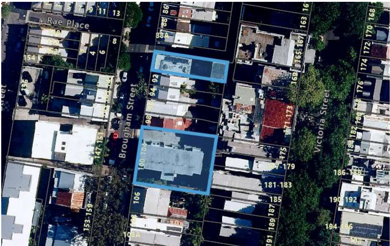
Figure 1. Aerial image showing the site's location

The site is located in Potts Point approximately two kilometres east of Central Sydney. Uses along Brougham Street are predominantly residential, and the most common building type is three storey terrace dwellings with dormer roofs. There is approval for a hotel use at 92-98 Brougham Street, which sits between these two properties.