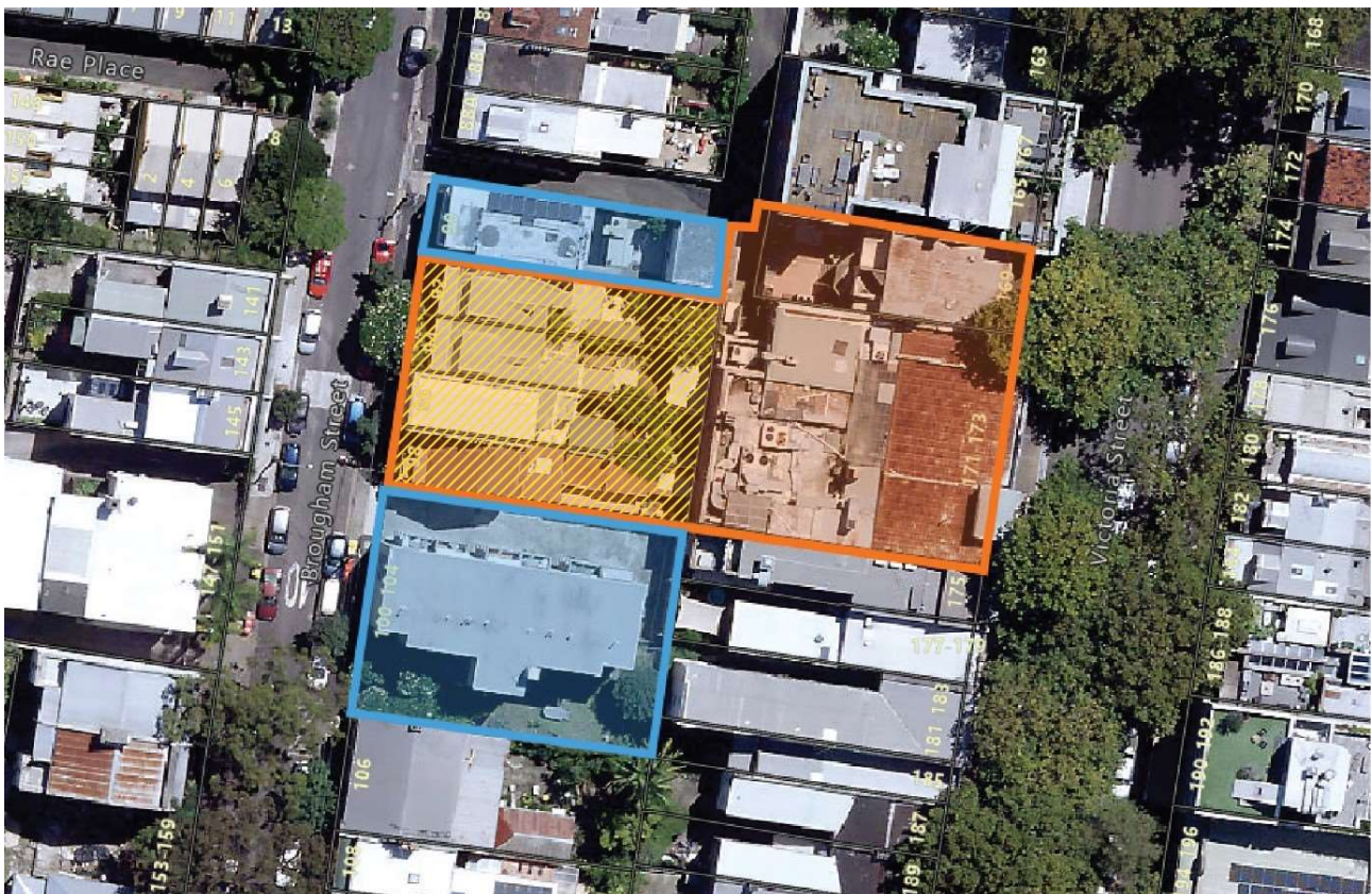
Figure 5. The Piccadilly Hotel