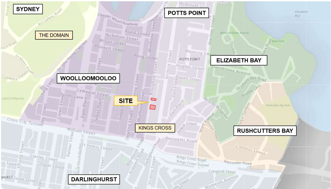
Figure 2. Indicative plan showing the site's context and suburb boundaries