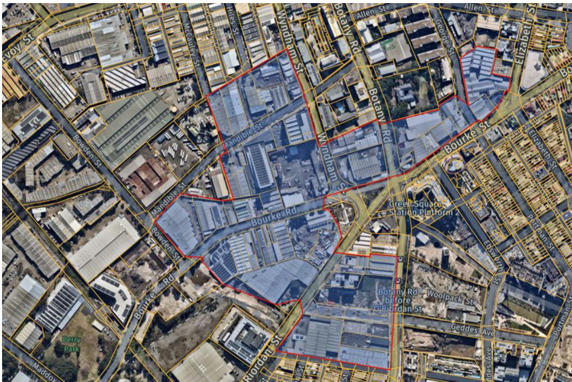
Figure 2: Expanded retail area